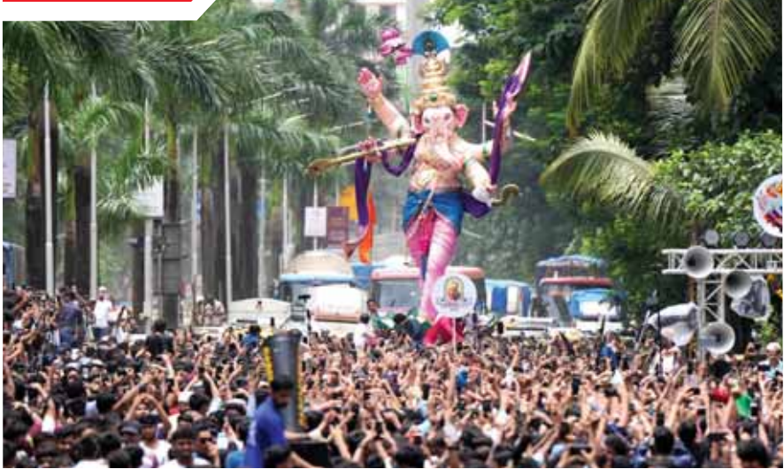
Devotees carry a Lord Ganesh idol for the Ganesh Chaturthi festival, in Mumbai