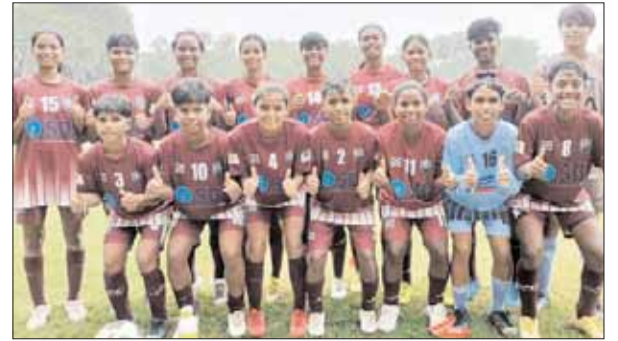
Jharkhand's Under-17 girls team members pose for photo during 63rd National Subroto Cup Under-17 Girls Football Tournament at Haryana on Monday.