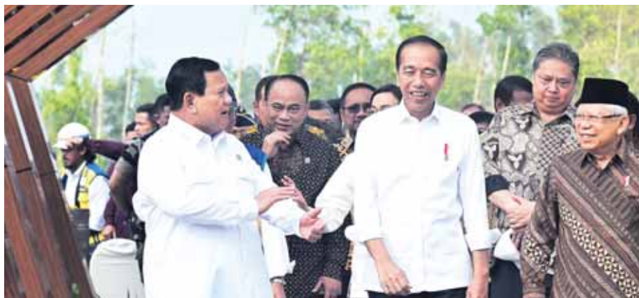
In this photo released by Indonesian Presidential Palace, Indonesian President Joko Widodo (centre) talks with Indonesian Defense Minister and president-elect Prabowo Subianto (left) and Indonesian Vice President Ma'ruf Amin (right) in the new capital city Nusantara in Penajam Paser Utara, East Kalimantan, Indonesia, on Monday.

Indonesian President Joko Widodo held his first cabinet meeting in the future capital of Nusantara, amid miles of construction sites and doubts about the sustainability of the ambitious mega project. Widodo began working from the city two weeks ago, using an office inside the construction site of the massive new palace in the form of the mythical eagle-shaped Garuda, the symbol of the country. The city is set to hold its first Indonesian Independence Day celebration in less than a week. Appearing with his successor, President-elect Prabowo Subianto, in front of the palace, Widodo insisted that the controversial USD 33 billion construction effort will be worth it. "The Nusantara capital is a canvas that carves the future. Not all countries have the opportunity and the ability to build their capital city starting from zero," Widodo said.