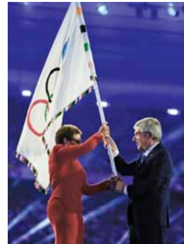
IOC President Thomas Bach hands the Olympic flag to Los Angeles Mayor Karen Bass during the 2024 Summer Olympics closing ceremony at the Stade de France.