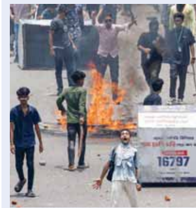
This is in response to the news article, "Bangladesh: Uncertainty and Chaos Grip the Nation" (August 10). The recent vio-