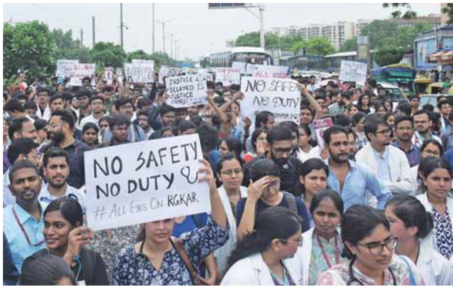
Doctors protest against the sexual assault and killing of a postgraduate trainee doctor in Kolkata, in New Delhi, on Monday

The brutal nature of the crime has intensified calls for justice and has led to the nationwide strike as a mean of expressing solidarity with the victim and demanding systemic changes to ensure the safety of healthcare