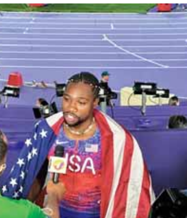
Noah Lyles celebrating on the track, wearing a USA flag.

doing well because I'm not a traditional learner. It was very hard going through that. Going through the school system, it made me feel like I was stupid. I felt like none of my gifts I have now were worth anything." Lyles pushed through the skeptics,