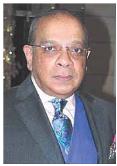
Bangladesh Chief Justice Syed Refaat Ahmed

"I will work with devotion and honesty. I will do everything to establish justice in the society after the mass upheaval. Our sense of justice has been destroyed over the years," he said.