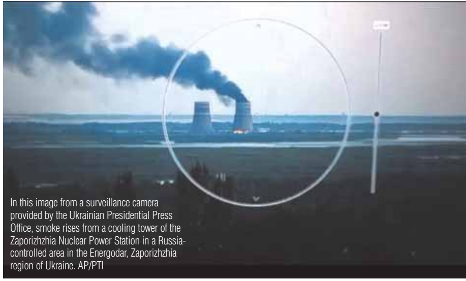
In this image from a surveillance camera provided by the Ukrainian Presidential Press Office, smoke rises from a cooling tower of the Zaporizhzhia Nuclear Power Station in a Russia-controlled area in the Enerhodar, Zaporizhzhia region of Ukraine.

raid — remain unclear. The stunning maneuver that caught the Kremlin's forces unawares counters Russia's unrelenting effort in recent months to punch through Ukrainian defences at selected points along the front line in eastern Ukraine. Russia has seen previous incursions into its territory during the nearly 2 1/2-year war, but the foray into the Kursk region marked the largest attack on its soil since World War II, embarrassing President Vladimir Putin and constituting a milestone in the hostilities. The advance has delivered a blow to Putin's efforts to pretend that life in Russia has largely remained unaffected by the war. State propaganda has tried to play down the attack, emphasizing the authorities' efforts to help residents of the region and seeking to distract attention from the military's failure to prepare for the attack and quickly repel it. Retired Gen. Andrei Gurulev, a member of the lower house of the Russian parliament, criticised the military for failing to