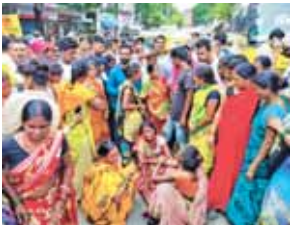
Family members of the victims mourn after a stampede at Baba Siddhanath temple, in Jehanabad district, Monday morning, Aug. 12, 2024. At least seven people were killed and 16 others suffered injuries in the stampede

An official from the Union Tourism Ministry praised the State's initiative stating the project aims to contribute to the long-term growth and sustainability of the tourism sector in the region.