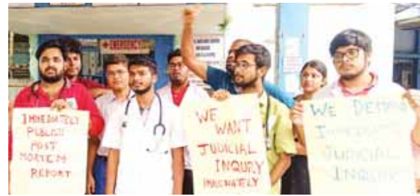
Junior doctors and medical students stage a protest against the sexual assault and murder of a postgraduate trainee doctor in RG Kar Medical College & Hospital, in Kolkata, on Sunday

Police sources revealed that the brutal attack took place within 30 to 35 minutes. The panel of doctors who conducted the postmortem suggested that she might have been raped after being killed, as it would have been nearly impossible for one person to inflict such extensive injuries in such a short time, said the police. Family sources shared that the victim was scheduled to get married next year. A colleague from the same college,