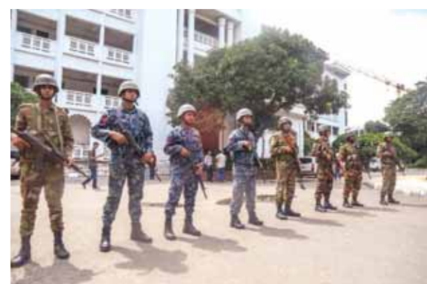
Bangladeshi Army and navy officials stand guard in front of the Supreme Court area in Dhaka, Bangladesh

Central Police Hospital. He warned that the media outlets would face closure if they provided misleading news, the Dhaka Tribune newspaper reported. Meanwhile Syed Refaat Ahmed was sworn in as Bangladesh's new chief justice on Sunday, a day after Obaidul Hassan stepped down as the top judge following an ultimatum by the protesters demanding a revamp of the judiciary. Hassan and five other judges of the apex Appellate Division on Saturday tendered their resignation,