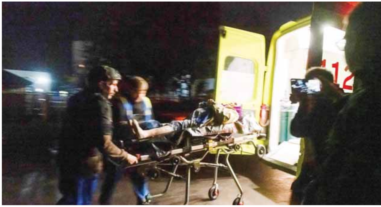
Russian Emergency paramedics roll a stretcher with a resident of an apartment building damaged after shelling by the Ukrainian side into an ambulance in Kursk, Russia, on Sunday.

in the district were also injured in the attack. Serhii Popko, head of the Kyiv City Military Administration said the it was the second time this month Kyiv was targeted. Popko said ballistic missiles did not reach the capital but that suburbs took the hit, while drones aiming for the capital were shot down. Zelenskyy, citing preliminary information, said that Russia had used a North Korean missile in the strike. Ukraine and the US have previously said that Russia has used North Korean missiles in the war. Zelenskyy reiterated calls to Western allies to step up in assistance to Ukraine, and that "to really stop Russian terror, we need not only a full-fledged air shield that will protect all our cities and communities, but also strong decisions from partners — decisions that will remove restrictions on our defensive actions." Meanwhile, Ukraine's incursion into Russia continued for a sixth day. The largest such attack since the full-scale invasion and unprecedented for its