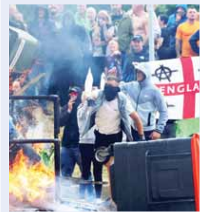
The world seems to be in flames. In the UK, violent clashes between communities are intensifying, with immigrants gaining

ground in the conflict. Across Europe, a similar surge sees immigrants clashing with native populations. But the most alarming development this week has been the chaos and coup in our neighboring country—once a close friend and an Islamic nation that upheld peaceful coexistence among all religions, now plunged into turmoil. These are difficult times where unrests and upheavals have become order of the day.