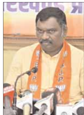
of JMM-Congress-RJD, he said. Rural Development