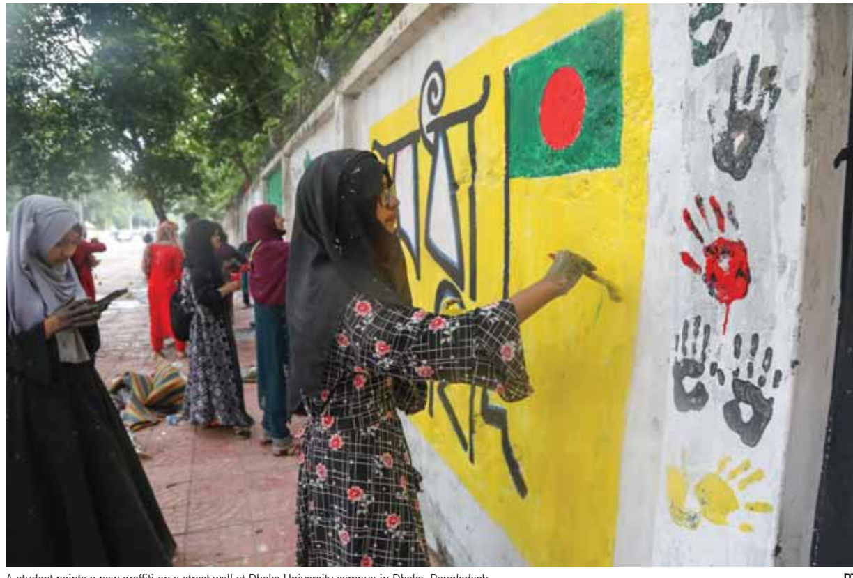
A student paints a new graffiti on a street wall at Dhaka University campus in Dhaka, Bangladesh