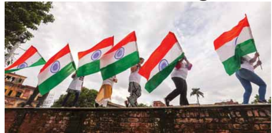
People wave the Indian national flags at Mubarak Mandi palace ahead of the Independence Day, in Jammu, on Sunday