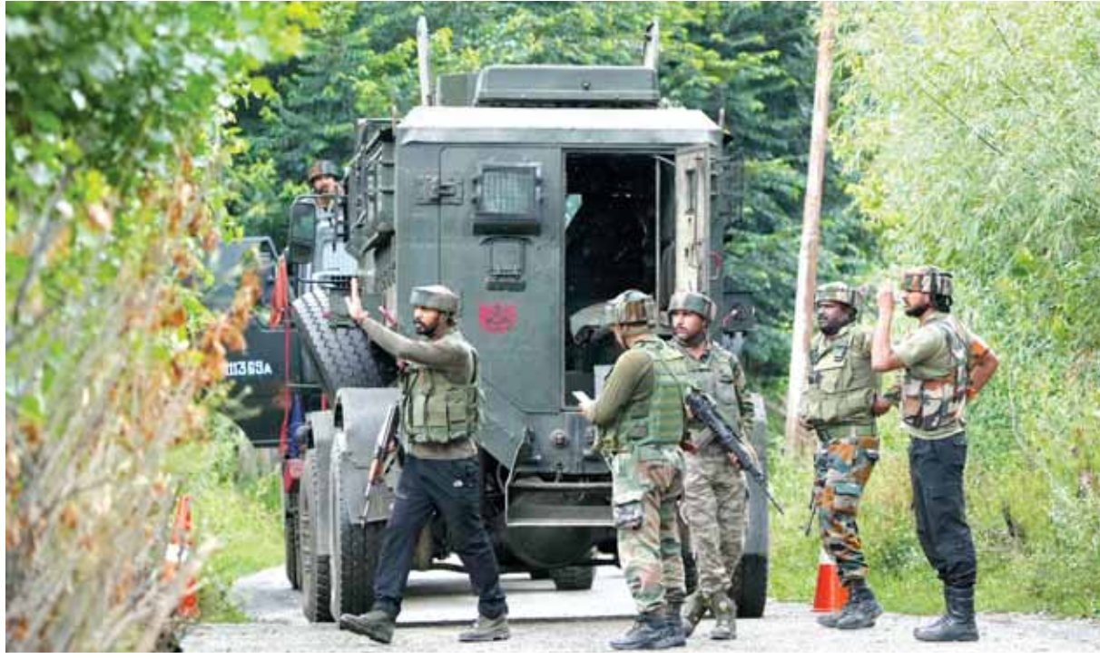
Security personnel during an encounter with terrorists at Ahlan Gagar-Mandu forest area, in Anantnag district of South Kashmir, on Sunday