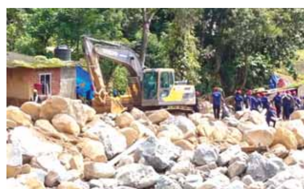
Search and rescue operation underway at a landslide-hit area in Wayanad district, Sunday

away because of the snapping of the chain link by the floodwaters has jolted people in five districts of Kerala. Tungabhadra dam built in 1953 and Mullaperiyar in Kerala, built 130 years ago have a lot of similarities. Both are built with a combination of surki, mortar, mud and limestone making them the last surviving non-cement dams in India. The Mullaperiyar dam, constructed across River Periyar in Kerala with the sole purpose of providing drinking and irrigation water to the four districts in Tamil Nadu has become a modern day water bomb. People living in the districts of Idukki, Pathanamthitta, Alappuzha, Kottayam and Ernakulam would be drowned in the deluge that would occur