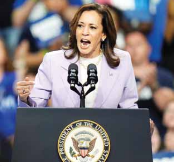
Democratic presidential nominee Vice President Kamala Harris speaks at a campaign rally at the University of Nevada, Las Vegas on Saturday

my NO TAXES ON TIPS Policy." "The difference is, she won't do it, she just wants it for Political Purposes!" the former president wrote. "This was a TRUMP idea - She has no ideas, she can only steal from me." Harris and her running mate, Minnesota Gov. Tim Walz, came to Nevada as the final stop of a battleground blitz in which their party has shown new energy after President Joe Biden exited the race and endorsed Harris. On Sunday, the vice president is holding a San Francisco fundraiser that has already raised more than USD 12 million, her campaign said, with House Speaker Emerita Nancy Pelosi among those set to speak. There were 12,000-plus people inside the campus basketball arena on Saturday and, before the event started, local law enforcement opted to close the doors to the event due to people becoming ill while waiting outside to go through security in the 109-degree heat. Approximately 4,000 people were in line when the entrances were shut down. Walz referenced that during his speech, but turned it into an