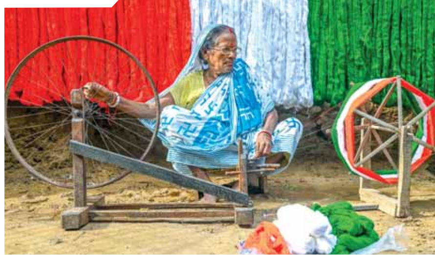
An elderly woman spins tricolour yarns ahead of the Independence Day in Nadia district