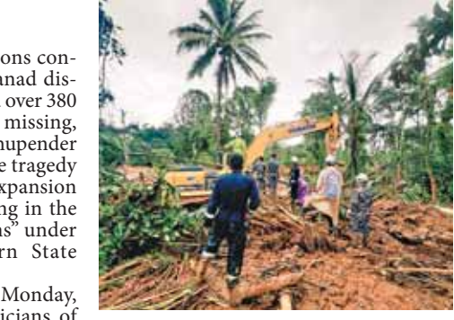
A rescue operation underway after a landslide in Wayanad

As search and rescue operations continue in landslide-hit Wayanad district in Kerala which has claimed over 380 lives and left more than 100 missing, Union Environment Minister Bhupender Yadav on Monday attributed the tragedy to the "illegal human habitat expansion and protection for illegal mining in the fragile region by local politicians" under the tutelage of the Southern State Government. Talking to reporters here on Monday, Yadav also accused local politicians of failing to regulate and protect sensitive zones, contributing to the disaster that struck the region six days ago. The impacts of the landslides are still being felt by the locals, exacerbating the ongoing crisis in Wayanad. "It is an illegal protection to the illegal human habitation by the local politicians. Even in the name of tourism, they are not making proper zones. They allowed encroachment of