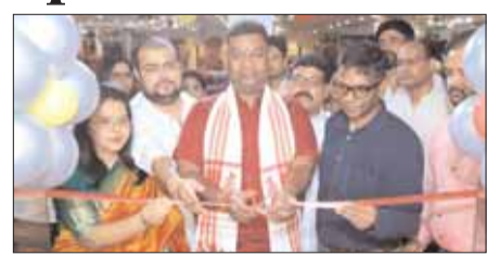
Industry Minister Satyanand Bhokta inaugurates the Jharcraft Emporium at Janpath in Delhi on Monday.

On this occasion, Secretary, Industries Department, Government of Jharkhand,