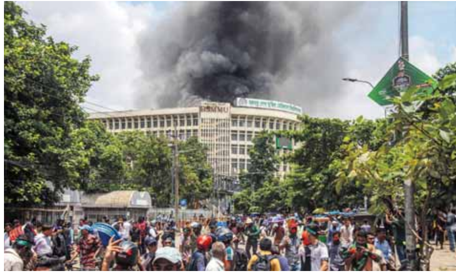
Black smoke rises from the Bangabandhu Sheikh Mujib Medical University during clashes between protesters and Awami League members, on the first day of the non-cooperation movement in Dhaka, on Sunday, August 4

became prime minister. Five years later, Hasina was elected prime minister in the 1996 general elections. Hasina was voted out of office in the 2001 elections but returned to power with a thumping victory in 2008 polls. Khaleda Zia-led BNP has been left in the lurch since then. Hasina escaped an assassination bid in 2004 when a grenade exploded at her rally. Soon after coming to power in 2009, Hasina set up a tribunal to try 1971 war crimes cases. The tribunal convicted some high-profile members of the opposition, sparking violent protests. Jamaat-e-Islami, an Islamist party and a key ally of BNP, was banned from participating in elections in 2013. BNP chief Khaleda Zia was sentenced to 17 years in prison on corruption charges. The BNP boycotted the 2014 elections but joined the one in 2018, which party leaders later said was a mistake, alleging that the voting was marred with widespread rigging and intimidation. In the 2024 elections,