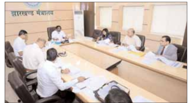
Chief Minister Hemant Soren holds a meeting of the 31st meeting of the Jharkhand State Sentence Review Board, in Ranchi on Monday.

The 31st meeting of the Jharkhand State Sentence Review Board was held today in the Jharkhand Ministry under the chairmanship of Chief Minister Hemant Soren. In the meeting, a review was done regarding the release of 74 prisoners serving life sentence in various jails of the state. In the meeting, the CM, in the light of the recommendation of the State Sentence Review Board, gave his approval to the decision to release 39 prisoners. In the course of the review, after discussing point-wise on the opinion of the courts, Superintendent of Police of the concerned districts, Jail Superintendent and Probation Officer, a consensus was reached to release 39 prisoners. In the meeting, Soren directed the officials to verify the family background, social and economic status of the prisoners released after serving life sentence in various jails of the state in the light of the recommendation by the Jharkhand State Sentence Review Board. The CM said that a special action plan should be made for income generation for the livelihood