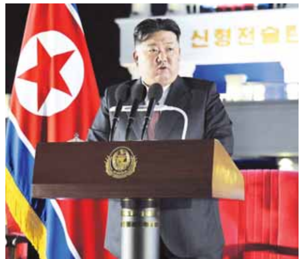
In this photo provided by the North Korean government, Kim Jong Un speaks during a ceremony to mark the delivery of 250 nuclear-capable missile launchers to frontline military units, in Pyongyang, North Korea, on Sunday

North Korea marked the delivery of 250 nuclear-capable missile launchers to frontline military units at a ceremony where leader Kim Jong Un called for a ceaseless expansion of his military's nuclear program to counter perceived US threats, state media said on Monday. Concerns about Kim's nuclear program have grown as he has demonstrated an intent to deploy battlefield nuclear weapons along the North's border with South Korea and authorised his military to respond with preemptive nuclear strikes if it perceives the leadership as under threat. North Korea's official Korean Central News Agency said the launchers were freshly produced by the county's munitions factories and designed to fire "tactical" ballistic missiles, a term that describes systems capable of delivering lower-yield nuclear weapons. Kim said at Sunday's event in Pyongyang the new launchers would give his frontline units "overwhelming" firepower over South and make the operation of tactical nuclear weapons more practical and efficient. State media photos showed lines of army-green launcher trucks packing a large street with seemingly thousands of spectators attending the event, which included fireworks. North Korea has been expanding its lineup of mobile short-