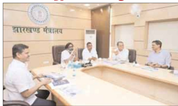
Chief Minister Hemant Soren launches the 'Upasthiti Portal' in the presence of senior officials in Ranchi on Monday.

RANCHI Chief Minister Hemant Soren today launched the 'Upasthiti Portal' on behalf of the Health, Medical Education and Family Welfare Department to ensure the daily attendance of all doctors, para-medical workers, contract workers and other workers working under the Health Department. Through this portal, cross verification of biometric attendance being recorded by the employees of the Health Department will be done. While launching the portal, the Chief Minister said that the government is committed to improve the health facilities of the state and to provide accessible and better health related facilities to all the people of Jharkhand state.