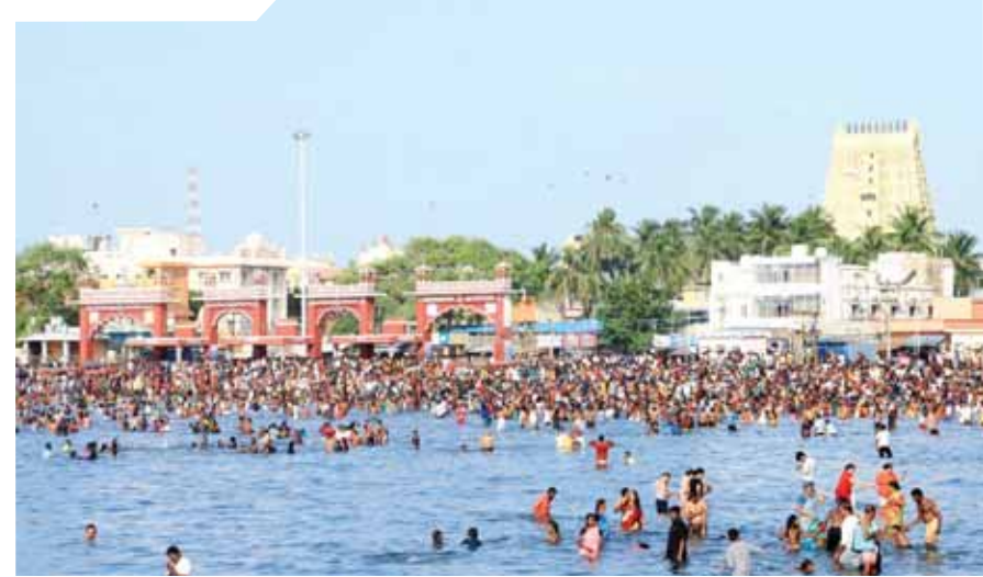
People take a dip before performing rituals on the occasion of 'Aadi Amavasi', in Rameshwaram