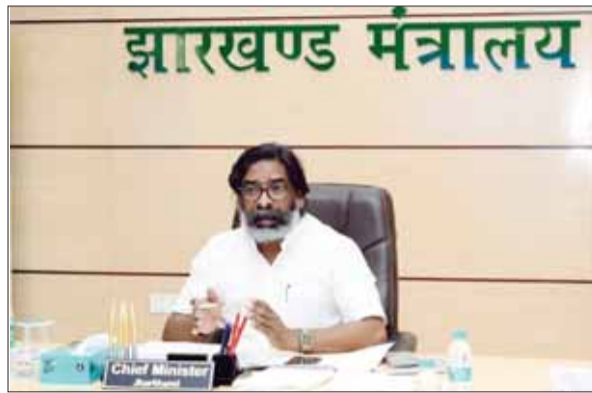
Chief Minister Hemant Soren during a meeting with officials in Ranchi on Monday.

to improve the level of education, health and nutrition of women by providing them with financial assistance. Chief Minister Hemant Soren on social media site 'X'. In his post, he has also congratulated the women of the state on the launch of Jharkhand Mukhyamantri Mainiya Samman Yojana (JMMSY). The CM has said that information has been received about the initial problems faced by the sisters in taking advantage of the scheme. He has instructed the officials to resolve the technical problems as soon as possible.