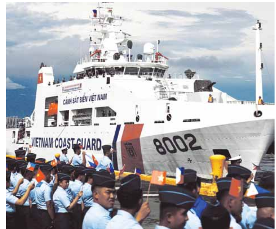
Manila : Philippine Coast Guard personnel wave flags as the Vietnam Coast Guard CSB-8002 patrol ship makes a port call at the Port of Manila, Philippines, 05 August 2024. Philippine and Vietnam coastguards will conduct joint maritime exercises in the disputed South China sea to foster mutual understanding and enhanced cooperation between the two nations