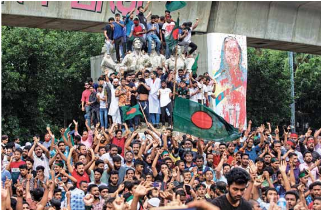
Protesters climb a public monument as they celebrate after getting the news of Prime Minister Sheikh Hasina's resignation, in Dhaka, Bangladesh. (Right top) Sheikh Hasina