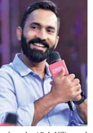
ambassador AB de Villiers and the management team to help strengthen the league’s global fan base and reinforce brand

PTI ■ JOHANNESBURG Former India wicketkeeper F. Batter Dinesh Karthik was on Monday appointed the league ambassador of the SA20 League. Karthik, who is the first Indian player to be associated with the South African tournament, retired from all forms of cricket earlier this year. “The league has been electric in the first two seasons with some of the world’s best players on show and exciting young talent putting up their hands on the global stage,” Karthik was quoted as saying in a media release. “Karthik will be working very closely with fellow SA20