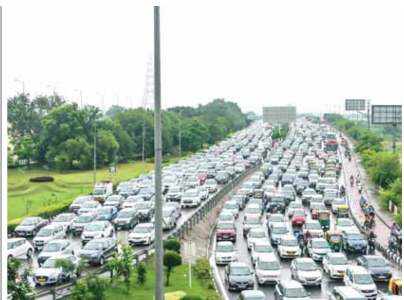
Traffic jam in New Delhi on Thursday