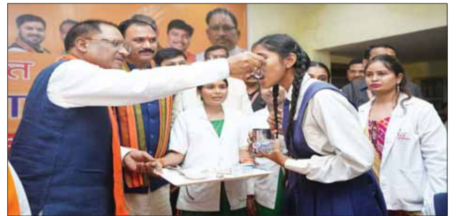
medication on August 29 will have another opportunity on September 4.

On August 29, as part of National Deworming Day, children and teenagers aged one to 19 years in the state were administered the deworming medication. Those who missed the