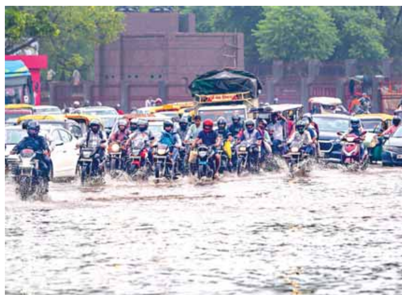
Waterlogged road in New Delhi on Thursday