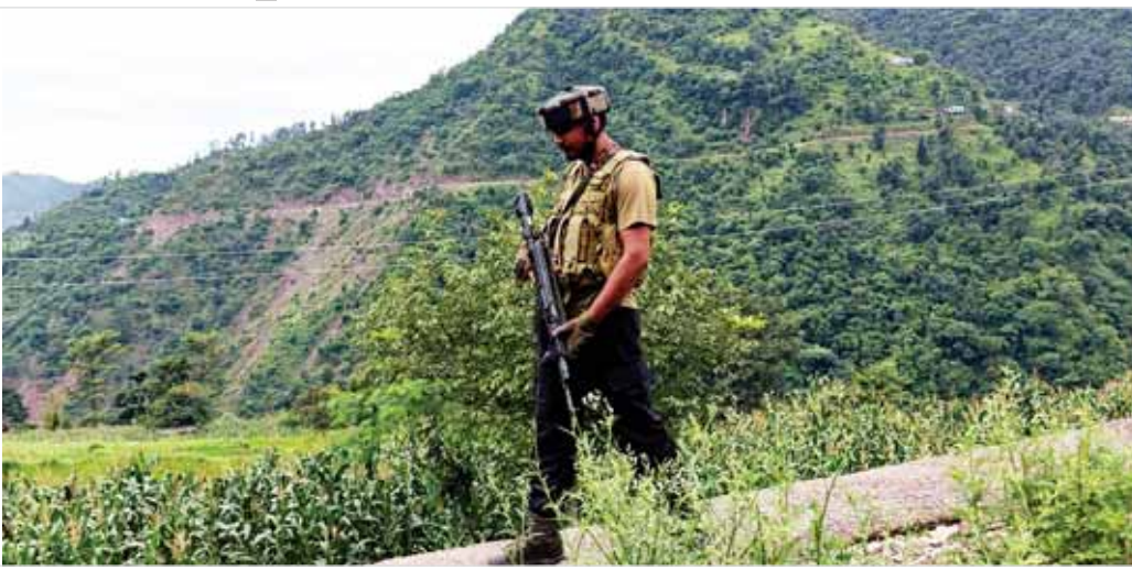
A security personnel keeps vigil during pre-dawn cordon and search operation after reports of suspicious movement, leading to an exchange of fire, in Rajouri district, on Thursday

military forces to be deployed on ground zero to instill confidence among the voters. During the recently held Lok Sabha polls the Union Territory witnessed over 58 per cent voter turnout across five Parliamentary constituencies. The Election Commission of India is aiming to further improve the voter percentage turnout during the Assembly polls.