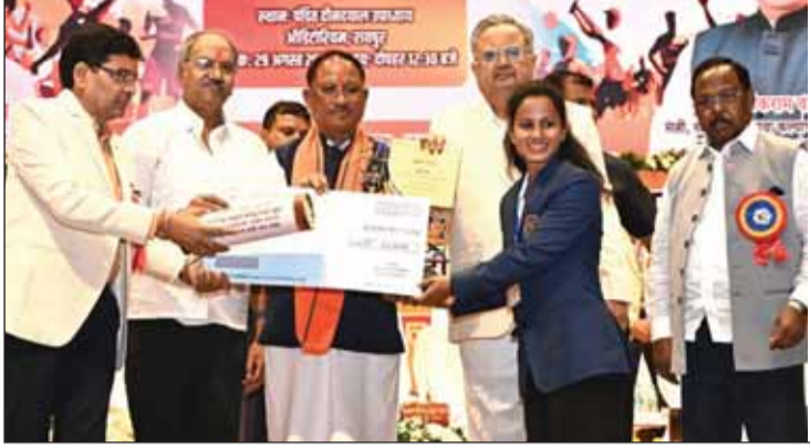
The Chief Minister said the government was committed to augmenting the sports facility in the state in order to promote sports. The government honored six

The programme was presided over by Speaker Dr. Raman Singh. The special guests were Union Minister of State for Housing and Urban Development Tokhan Sahu, Deputy Chief Ministers Arun Sao and Vijay Sharma and Sports and Youth Welfare Minister Tankram Verma.