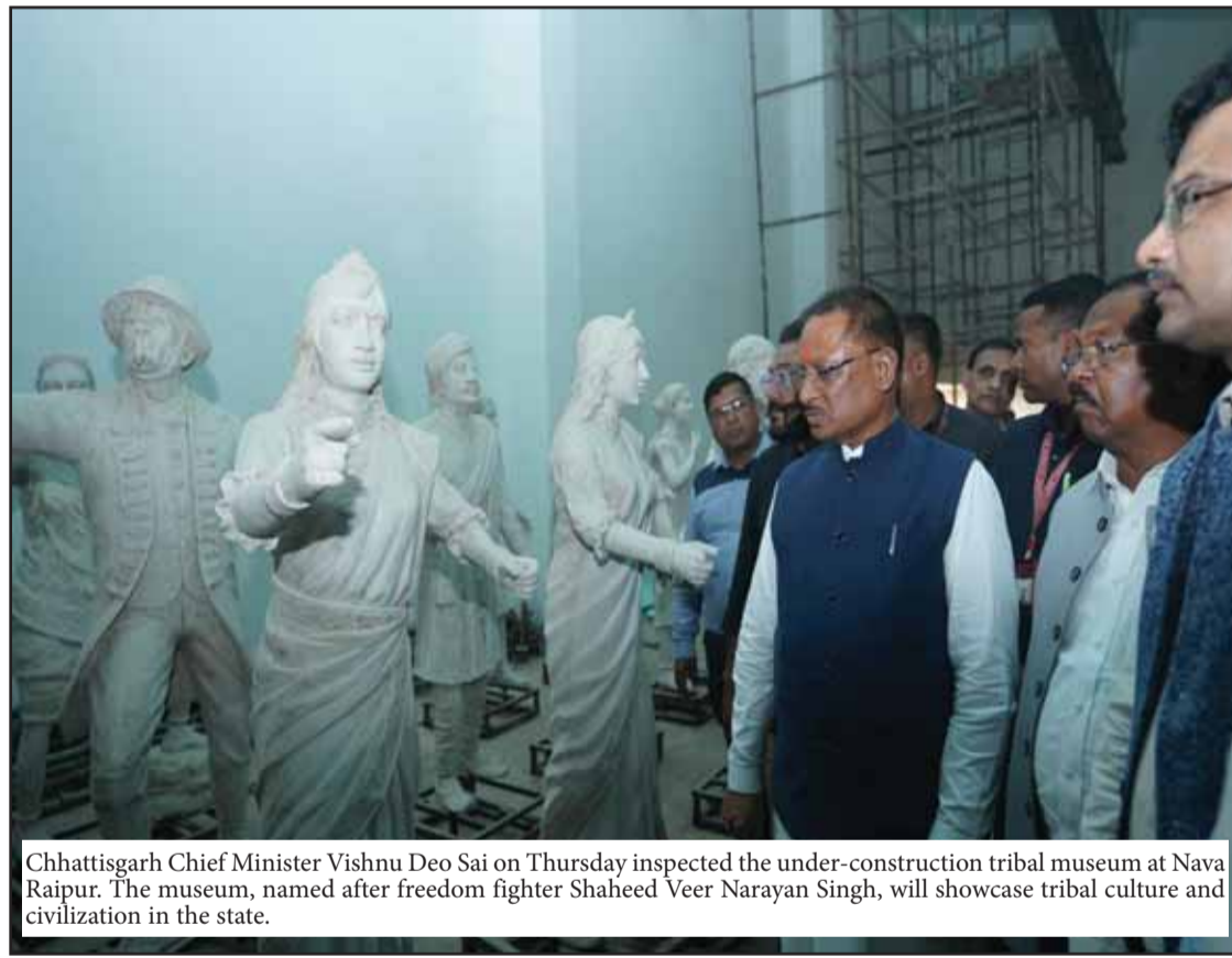
Chhattisgarh Chief Minister Vishnu Deo Sai on Thursday inspected the under-construction tribal museum at Nava Raipur. The museum, named after freedom fighter Shaheed Veer Narayan Singh, will showcase tribal culture and civilization in the state.

It was possible to diagnose a number of cardiac conditions, such as ischemic heart disease (IHD), heart failure (HF), atrial fibrillation (AF), and stroke, using hospitalisation records and information from the cause of death registry.