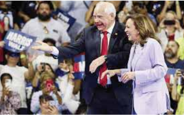
Harris, Trump and Mike Pence, Barack Obama and Biden — all did them at a similar point in the race. The difference is those other candidates had all done solo interviews, too.

Vice President Kamala Harris and her running mate, Minnesota Gov. Tim Walz, will sit down Thursday for their first major television interview of their presidential campaign as the duo travels in southeast Georgia on a bus tour.