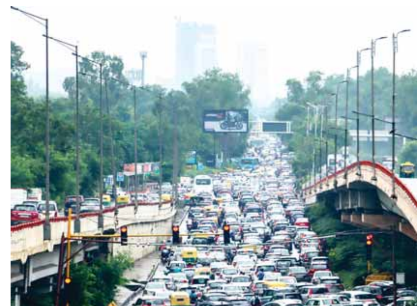
Vehicles stuck in traffic jam after rain in New Delhi on Thursday