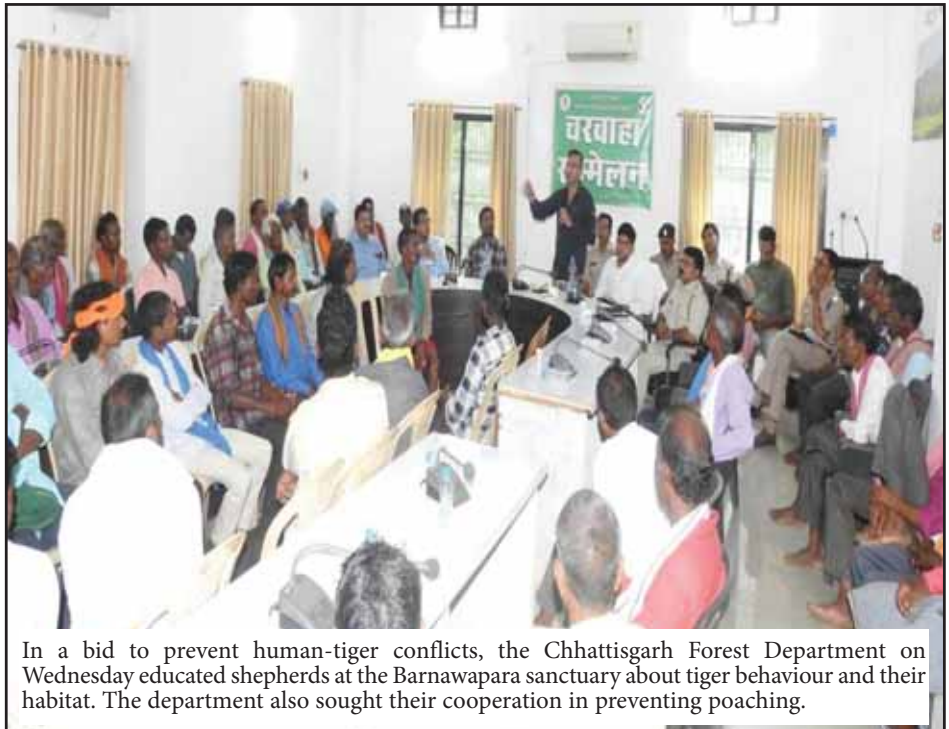
In a bid to prevent human-tiger conflicts, the Chhattisgarh Forest Department on Wednesday educated shepherds at the Barnawapara sanctuary about tiger behaviour and their habitat. The department also sought their cooperation in preventing poaching.