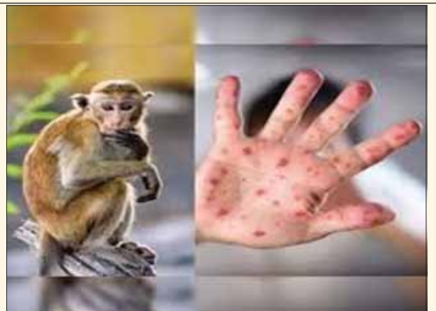
disease, Health Minister Shyam Bihari Jaiswal has told the Health Department to organise camps at all levels to educate people about the disease and preventive measures. The guidelines include surveillance of possible cases of Mpox for prompt

The Chhattisgarh government on Wednesday issued an advisory for the prevention and control of monkeypox (Mpox) and called for strict compliance with the Centre's guidelines. The World Health Organisation (WHO) declared monkeypox a public health emergency of international concern (PHEIC) on August 14. Although it is mainly found in Central and West Africa, cases are being recorded in other countries including in Kerala in India. Taking cognisance of the