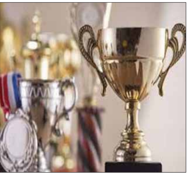
Award, two players will get the Veer Hanuman Singh Award, 11 players the Shaheed Pankaj Vikram Samman, five players the Shaheed Vinod Choubey Samman and 11 players will be awarded the Chief Minister Trophy for 2021-22. Similarly, for 2022-23, four players will be honoured with trophies. Officials said prize money of Rs 76 lakh will be given to 97 awardee players and Rs 60.33 lakh will be transferred to the bank