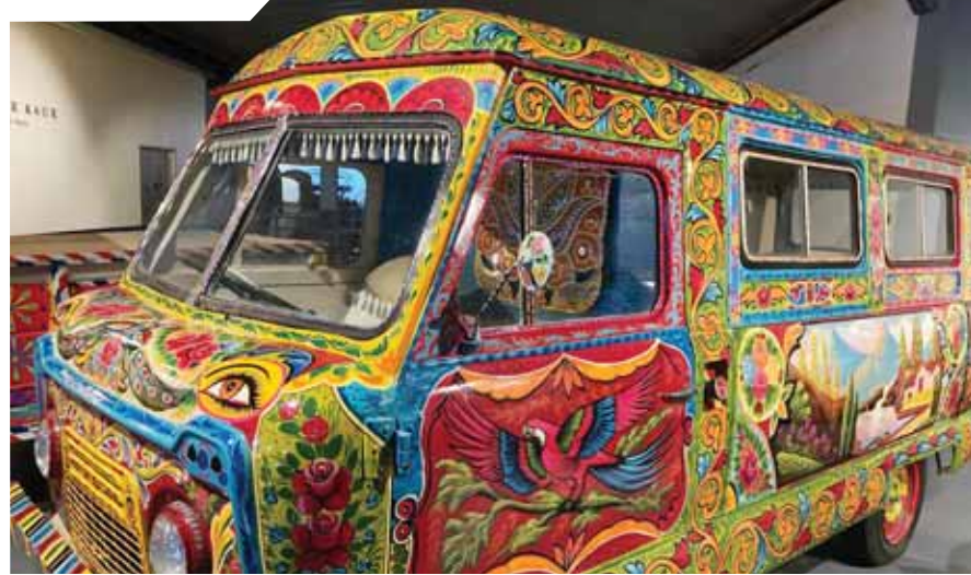
A beautifully painted bus at display in the Heritage Transport Museum, in Gurugram