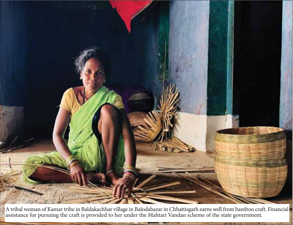
A tribal woman of Kamar tribe in Baldakachhar village in Balodabazar in Chhattisgarh earns well from bamboo craft. Financial assistance for pursuing the craft is provided to her under the Mahtari Vandan scheme of the state government.