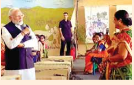
Prime Minister Narendra Modi during an interaction with Lakhpati Didis, in Jalgaon, on Sunday