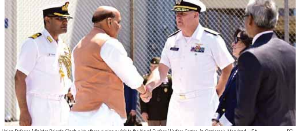
Union Defence Minister Rajnath Singh with others during a visit to the Naval Surface Warfare Centre, in Carderock, Maryland, USA