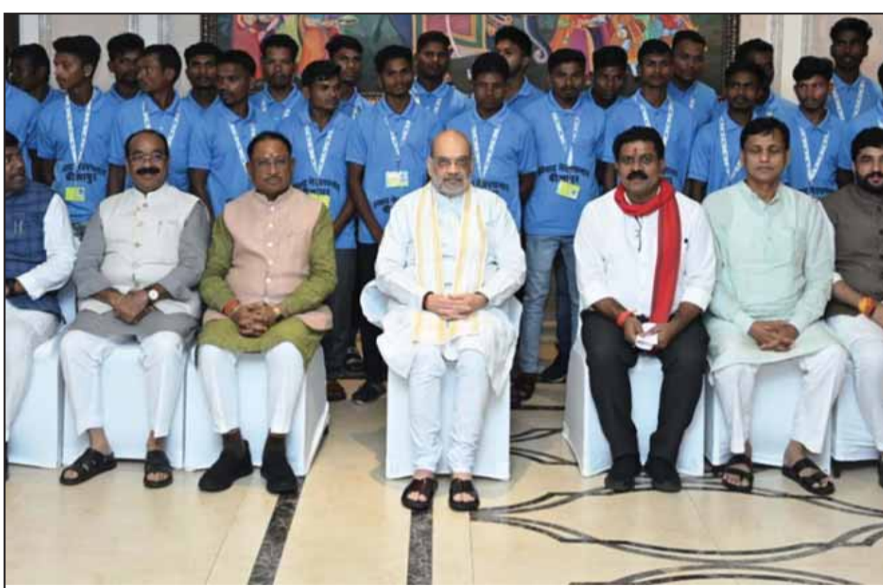
Youths from villages of Maoist-hit Bijapur in Chhattisgarh met Union Home Minister Amit Shah in Raipur on Sunday. The government is introducing them to employment-related development operations.

changing and moving from natural to synthetic drugs. He emphasized on the use of scientific methods in the investigation of drug-trafficking cases. He said one can succeed against drugs by detection of drugs, destruction of the network, detention of the culprit and rehabilitation of the addict. He said that interstate cases should be handed over to NCB to dismantle the entire network of drugs. He said 1,250 cases were registered from 2004 to 2014 whereas this shot up to 4,150 in the next decade. Similarly, arrests went up from 1,360 in 2004-14 to 6,300 in 2014-24.