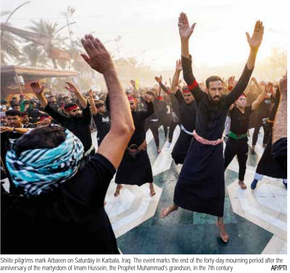
Shiite pilgrims mark Arbæen on Saturday in Karbala, Iraq. The event marks the end of the forty-day mourning period after the anniversary of the martyrdom of Imam Hussein, the Prophet Muhammad's grandson, in the 7th century

Ternate Island (AP): Torrential rains caused a flash flood on Indonesia's eastern Ternate Island, sweeping away residential areas and leaving 13 people dead on Sunday, officials said. The deluges cut off the main road and access to the village of Rua in North Maluku province, the most hard-hit area, and buried dozens of houses and buildings under the mud. Search and rescue teams worked with locals to recover the bodies and look for those still missing. The Meteorology, Climatology, and Geophysics Agency says high-intensity rain is still possible in the Ternate City area and its surroundings in the coming days. Local authorities advised residents to remain vigilant and heed instructions in case of further flooding. Heavy rains cause frequent landslides and flash floods in Indonesia where millions live in mountainous areas and near floodplains.