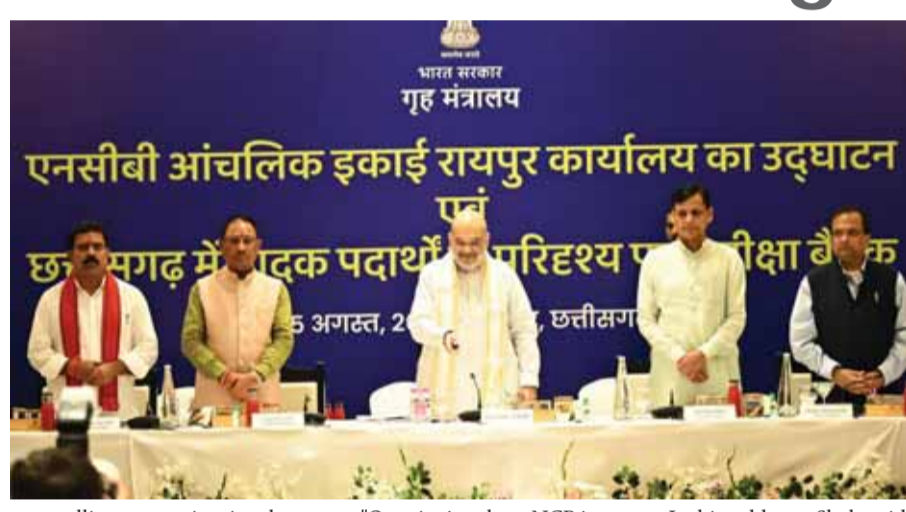
controlling narcotics in the entire region. "Our aim is to have NCB in every state," he said. In his address, Shah said the trend of drug trafficking is

Union Home Minister Amit Shah on Sunday said the percentage of use of sedatives in Chhattisgarh is 1.45, more than the national average. The use of cannabis (ganja) is also 4.98 percent, which too is more than the national average, he said. He said this at a review meeting on the narcotics scenario in Nava Raipur, an official statement said. He also virtually inaugurated the zonal office of Narcotics Control Bureau in the Chhattisgarh capital. Shah said the NCB office will play an important role in