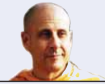
RADHANATH SWAMI MAHARAJ

Understanding and managing stress effectively is essential for a healthier life