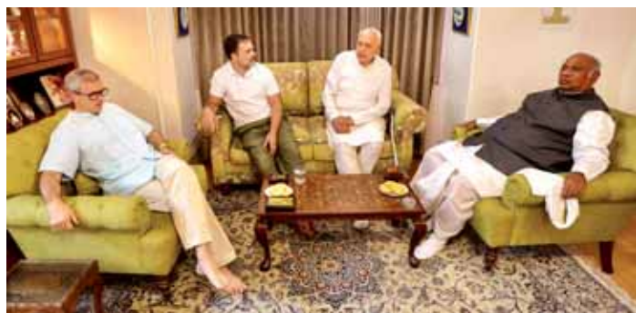
Congress president Mallikarjun Kharge with party leader Rahul Gandhi meets J&K National Conference president Farooq Abdullah and vice president Omar Abdullah, in Srinagar, on Thursday

Former alliance partners Congress and National Conference on Thursday decided to 'unitedly' contest the upcoming Assembly polls by forging a pre-poll alliance in Jammu and Kashmir. By finally stitching the deal, the National Conference has also put to rest all the speculations about the possibility of the post-poll alliance by the Kashmir-based mainstream regional parties with the ruling dispensation in New Delhi. The alliance partners have decided to contest all 90 seats as per the terms and conditions of the pre-poll alliance. The deal was struck between the two parties at the residence of Dr Farooq Abdullah in Srinagar. Omar Abdullah also attended the crucial meeting. Leader of the Opposition in Lok Sabha Rahul Gandhi, Congress chief Mallikarjun Kharge after addressing the workers meeting at a private hotel in Srinagar visited the Gupkar Road residence of Dr Abdullah where they held a closed-door meeting with the top brass of the National Conference discussing the contours of the pre-poll alliance. Soon after the meeting, the National Conference president Dr Farooq formally announced that the pre-poll alliance with Congress is final, and will be approved by this evening.