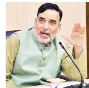
Tower at Connaught Place for a two year pilot study with DPCC as nodal agency for coordination and supervision. IIT Bombay and IIT Delhi were supposed to analyse the performance efficiency of the Tower," the letter stated. On June 19, the Environment Minister directed the submission of IIT Bombay's final report on the working of Smog Tower at Baba Kharak Singh Marg, New Delhi, to the Supreme Court. Expressing his