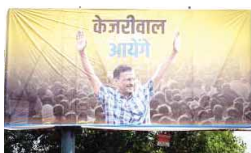
Arvind Kejriwal as the centre and under his leadership, once again the people of Delhi will form the AAP government by giving a huge majority?" He asserted that the people of Delhi have understood the conspiracies of the BJP and will give a befitting reply to the BJP in the Assembly elections this time. "The party has launched the 'Kejriwal Aayenge' campaign. Hoardings of Kejriwal with the tagline 'Kejriwal Aayenge'