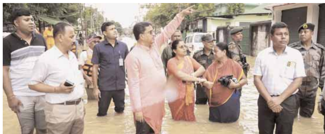
Tripura Chief Minister Manik Saha inspects a flood-affected area after heavy rains, on the outskirts of Agartala, on Thursday

India on Thursday described as factually incorrect reports floating in Bangladesh that the current flood situation in certain parts of the country has been caused by the opening of the floodgates of the dam on the Gumti river in Tripura. The Ministry of External Affairs (MEA) said floods in the rivers flowing through both the countries are a "shared" problem inflicting sufferings on the people on both sides, and require close mutual cooperation for resolution. "We have seen concerns being expressed in Bangladesh that the current situation of flood in districts on the eastern borders of Bangladesh has been caused by opening of the Dumbur Dam upstream of the Gumti river in Tripura. This is