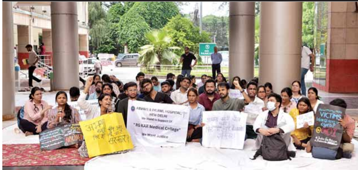
Doctor sitting on protest against the death of a doctor of RG Kar Hospital, at RML hospital on Thursday