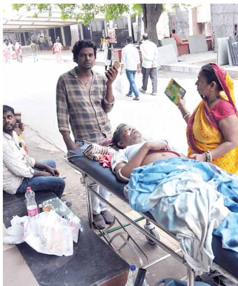
Patients arriving at the RML Hospital being denied treatment and referred to other hospitals