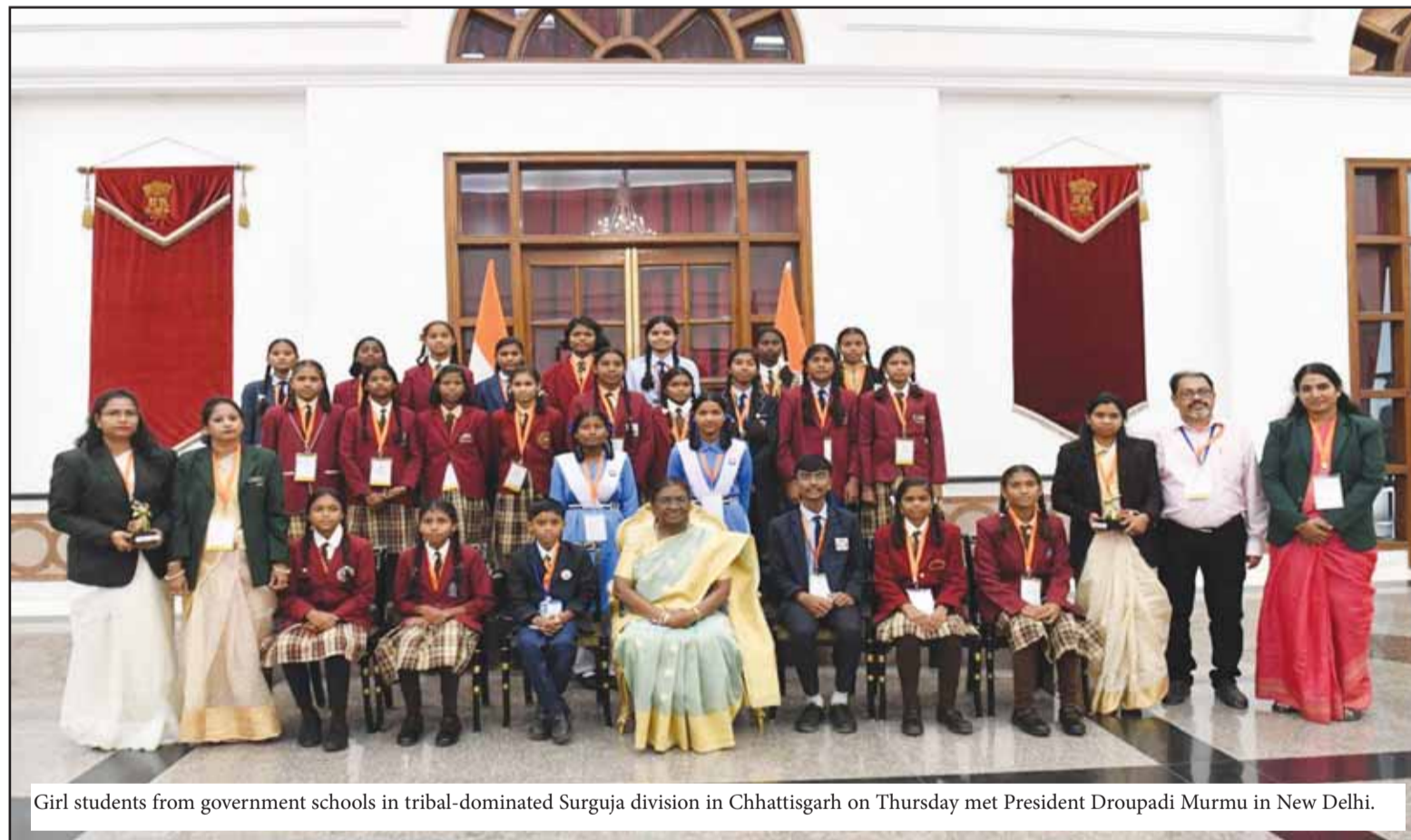
Girl students from government schools in tribal-dominated Surguja division in Chhattisgarh on Thursday met President Droupadi Murmu in New Delhi.

This year, the state government has set a target of distributing Rs 7,300 crore in loans. The loans are being provided based on the area under cultivation.