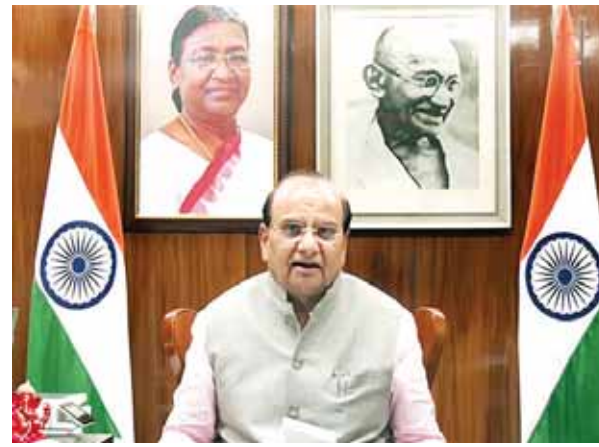
projects and re-engineering of 07 existing hospitals as 'ICU Hospitals', without factoring in the staff/HR requirement, machinery and equipment requirement and financial allocations required for the same.

neglect. Neither was the manpower for these hospitals approved, nor was the requirement of beds, machines and equipments taken into consideration. No budgetary provisions were made for these Heads, the LG was informed. What the people of Delhi are staring at, is construction of shells of concrete with no equipments, beds, operation theatres, doctors, nurses and staff in the name of hospitals, at a cost of Rs 8,000 crores. The AAP government had undertaken the exercise of redevelopment of 13 existing hospitals as 'Brown Field' projects, construction of 04 new hospitals as 'Green Field'