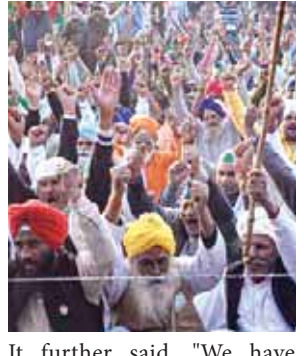
SHAMBHU BORDER BLOCKADE

The Supreme Court on Thursday said it would soon form a multi-member panel to amicably resolve the grievances of farmers 'for all times' and asked both the Punjab and Haryana governments to persuade the agitators at the Shambhu border between the states to remove their tractors and trolleys from the site.