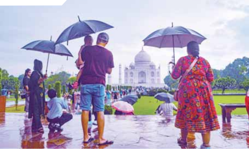
Visitors at the Taj Mahal in Agra