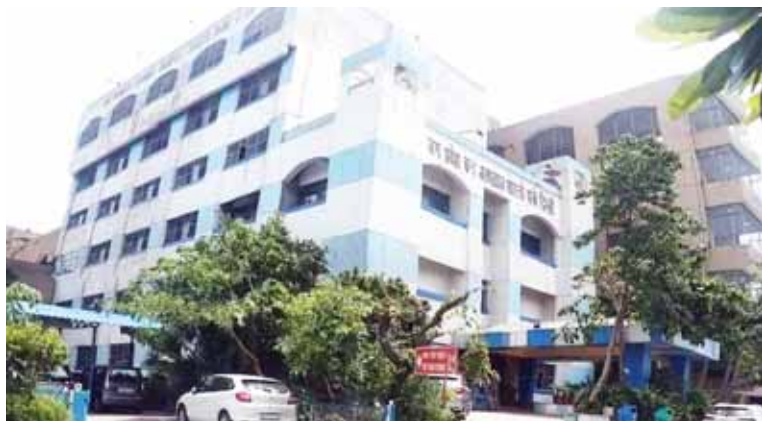
As the accused threatened the doctors and abused them, hospital staffers recorded it on their mobile phones. According to the FIR, the accused's wife was given medication by the doctor on duty based on her complaints but her husband refused those and instead suggested his own mode of treatment, a police official said. "A Person came to the casualty around 9:00 pm on Wednesday and the patient was given medication according to the