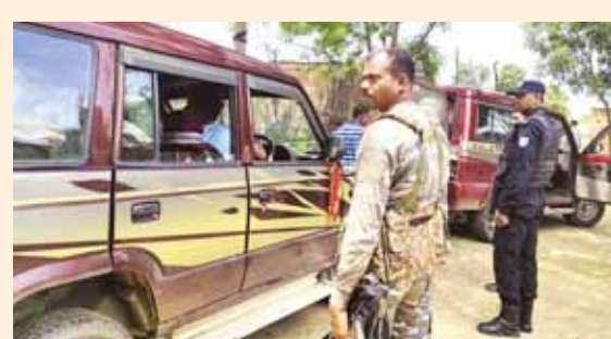
Security personnel outside the residence of a man allegedly linked to Al Qaeda, in Lohardaga, on Thursday. Seven people allegedly linked to Al Qaeda were detained by Jharkhand Anti-Terrorist Squad in raids in different parts of the State on Thursday

"The first thing is, is it true that the UD (unnatural death) was recorded at 10.30 hours (10.30 am)? Second, who is this assistant superintendent non-medical (person), her conduct is also very doubtful. Why did she act in this manner?" It directed the Kolkata Police officer, who registered the first entry about the incident that shocked the country, to appear in the next hearing and disclose the time of the entry. The court also observed that there seemed to be an attempt to pass off the murder as a suicide. Meanwhile, the Central Bureau of Investigation (CBI) while sharing a status report on the matter claimed that the crime scene was altered and tempered with which has hindered the further probe in the case. The CBI also informed the court that the FIR was lodged after the cremation of the trainee doctor.