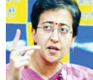
state of sewer overflow was absolutely shocking. These localities have been turned into a living hell. This kind of sewage overflow is a breeding ground for several diseases and can cause a serious public health crisis," she added. The senior AAP leader said that the residents informed them that the DJB officials, upon receiving the complaints, claimed that they do not have machines and manpower due to lack of funds. "The national capital could come to a standstill if DJB fails to do its work properly. A budget of Rs.7195.00 crore has been passed by the Delhi assembly which is 9.5 per cent of the total budget of Government of NCT of Delhi. This budget has been approved by the Council of Ministers, the LG, MHA and the Delhi Assembly.