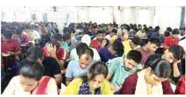
■ GUWAHATI

The Assam government on Thursday introduced a bill to make all applications for its jobs free for Scheduled Caste and Scheduled Tribe candidates.