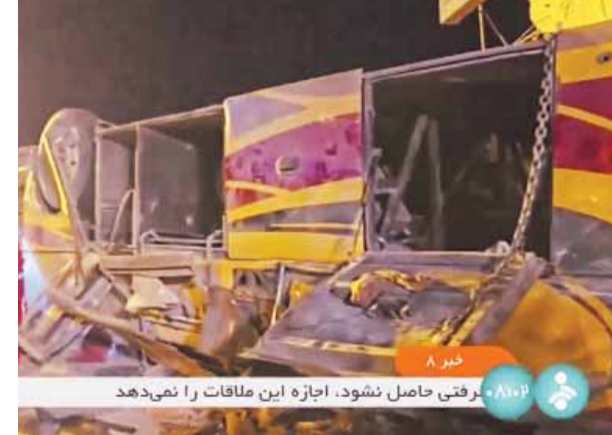
This image taken from a video released by Iranian state television shows the aftermath of a bus crash near Taft, Iran, early Wednesday. A bus carrying Shiite pilgrims from Pakistan to Iraq crashed in central Iran, killing multiple people, an official said Wednesday.