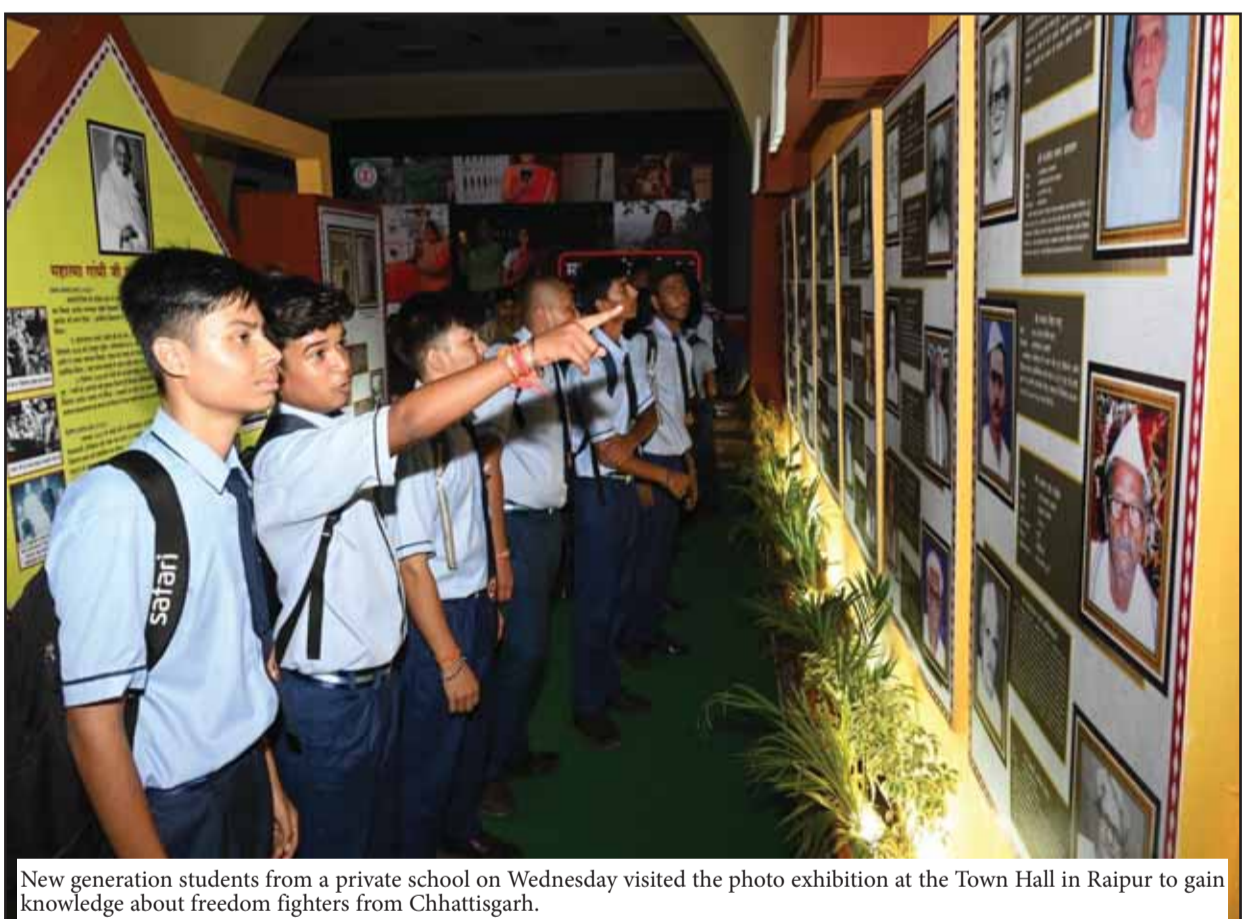
New generation students from a private school on Wednesday visited the photo exhibition at the Town Hall in Raipur to gain knowledge about freedom fighters from Chhattisgarh.

pronounced impact was observed in the Bastar division where there were major disruptions on key highways in southern Chhattisgarh, with significant traffic jams reported. The Jagdalpur-Sukma route, a vital link between Chhattisgarh and the states of Andhra Pradesh and Telangana, was blocked by protesters, leading to long queues of vehicles. Similarly, the Jagdalpur-Bijapur National Highway 63 was jammed. Members of the Adivasi community took to the streets and blocked the road, bringing traffic to a standstill. In Kanker district, protesters entered the Shaheed Ram Kumar Yadav Government Girls Higher Secondary School, dismissing students for the day. Demonstrators also blocked a section of the National Highway by felling trees, causing major traffic disruptions. In Kondagaon, SC-ST community members gathered at the Ambedkar statue and enforced the closure of shops. The bandh received support from several political parties including the Bhim Army and the Bahujan Samaj Party (BSP).