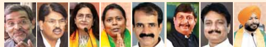
UPENDRA KUSHWAHA, MANAN KUMAR MISHRA, KIRAN CHOUDHARY, MAMATA MOHANTA, GEORGE KURIAN, DHAIRYASHEEL PATIL, NITIN PATIL, RAVNEET SINGH BITTU

"Our mutual commitment to democracy and pluralism further reinforces our relationship. I look forward to meeting my friend Prime Minister Donald Tusk and President Andrzej Duda to further advance our partnership," he said.