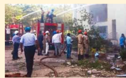
Firefighters douse a fire which broke out following an explosion in a reactor pharma unit of pharmaceutical company Escientia, in Anakapalle, Andhra Pradesh, on Wednesday