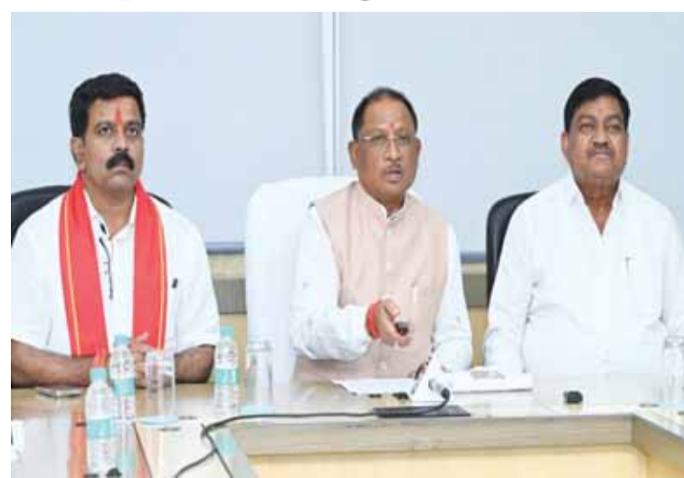
delays. They will be informed about the time of appointment through SMS and e-mail. This will save them a lot of time. The Chief Minister's Office (CMO) portal will provide information about welfare schemes. People will be able to know about the