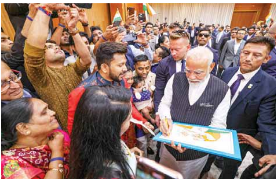
Prime Minister Narendra Modi gives his autograph on a portrait presented to him by the Indian community members upon his arrival at a hotel, in Warsaw, Poland, on Wednesday

On the first leg of the visit, Modi is visiting Polish capital city of Warsaw on August 21