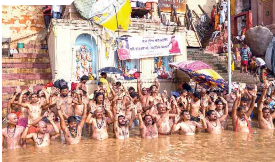
People perform Shravani Purnima rituals while taking bath in the Ganga river, in Varanasi