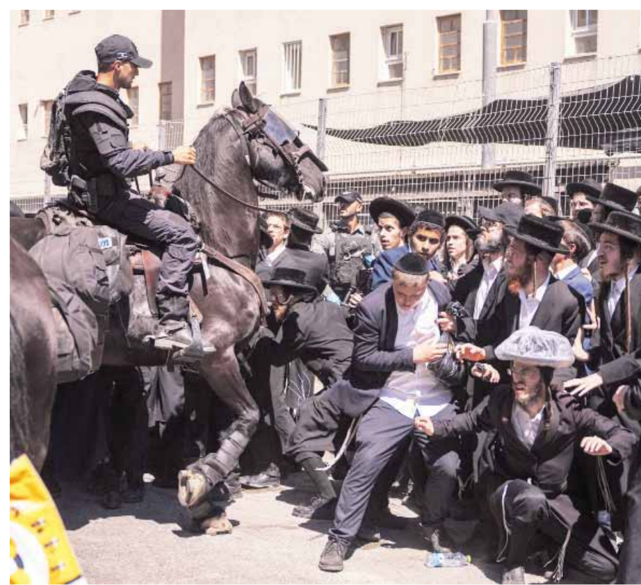
Israeli police officers scuffle with ultra-Orthodox Jewish men during a protest against a potential new draft law which could end their exemptions from military service in Jerusalem, Wednesday.

of Aden. A Liberian-flagged oil tanker came under a particularly intense series of attacks, beginning August 8, likely carried out by the rebels. A similar attack happened Aug. 13 as well. As Iran threatens to retaliate against Israel over the assassination of Hamas leader Ismail Haniyeh in Tehran, the US military told the USS Abraham Lincoln aircraft carrier strike group to sail more quickly to the area. America also has ordered the USS Georgia guided missile submarine into the Mideast, while the USS Theodore Roosevelt aircraft carrier strike group was in the Gulf of Oman. Additional F-22 fighter jets have flown into the region and the USS Wasp, a large amphibious assault ship carrying F-35 fighter jets, is in the Mediterranean Sea.