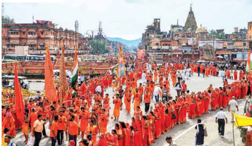
Women devotees carry holy water in the 'Kalash Yatra' in Jaipur