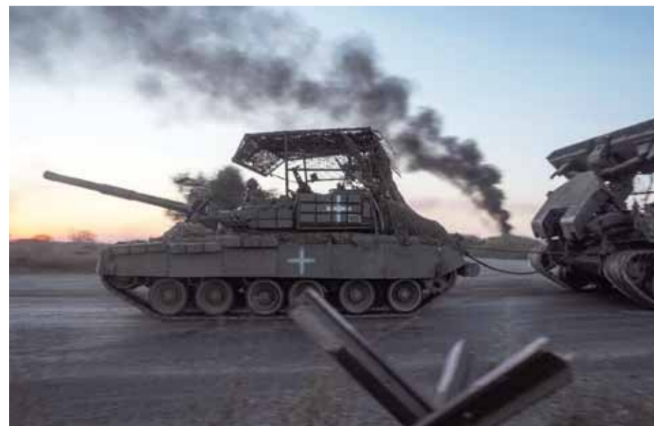
Ukrainian servicemen ride atop on a tank after returning from Russia near the Russian-Ukrainian border in Sumy region, Ukraine, on Saturday, August 17, 2024.

country since World War II, which took the Kremlin by surprise and saw scores of villages and hundreds of prisoners fall into Ukrainian hands. The Ukrainians drove deep into the Kursk region in several directions, facing little resistance and sowing chaos and panic. Ukraine's Commander in Chief, Gen. Oleksandr Syrskyi claimed last week that his forces had advanced across 1,000 square kilometers (390 square miles) of the Kursk region, although it was not possible to independently verify what exactly Ukrainian forces effectively control. But the strikes on bridges, apparently aimed to stymie a Russian counterpush in Kursk, could mean that Kyiv intends to seek a foothold in the region — or at least signal to Moscow that it plans to do so. Analysts say that although Ukraine could try to consolidate its gains within Russia, it would be a risky maneuver given Kyiv's limited resources, because supply lines extending deep into Kursk would be vulnerable to Russian strikes. The incursion has already