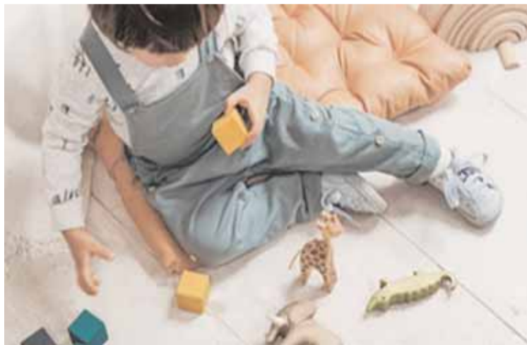
The study evaluated public engagement with cultural, digital, and sporting activities. The researchers controlled for variables such as gender, age, health, employment status, and deprivation levels to assess the general impact of creative arts on well-being. Participants reported their levels of happiness, anxiety, life satisfaction, and whether they felt life was worthwhile. They also noted their engagement