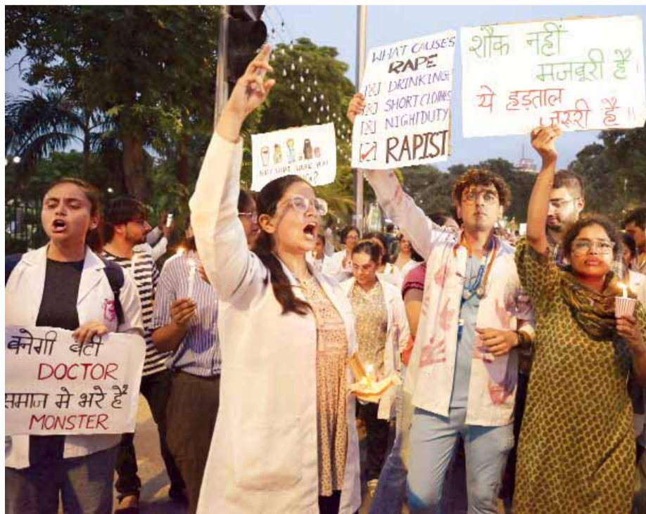
Members of various Resident Doctors' Associations protest during a candle march against the alleged rape and murder of a trainee doctor at Kolkata's RG Kar Medical College and Hospital, at Connaught Place, in New Delhi, on Sunday

"The nation looks to the judiciary as the ultimate guardian of justice, the last refuge for those whose cries