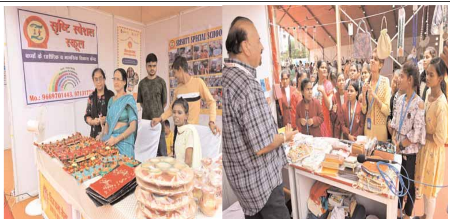
Glimpses of the 'Divya Kala Fair' in Raipur on Sunday. The event provides a platform for disabled entrepreneurs and artists to present their work and businesses. The fair will conclude on August 23.