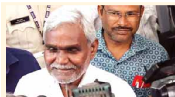
Former Jharkhand Chief Minister Champai Soren speaks with the media upon his arrival at Delhi airport on Sunday