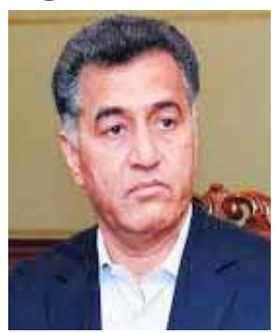
(Hameed's) political meddling will also be proved." Siddique quoted PTI founder Khan as saying that Hameed had supported his party inside Parliament by getting legislation passed and meeting the required number of members in the National Assembly. He said Hameed also remained involved in the general elections by backing the PTI. The senator said the former ISI chief had controlled the media and politicians and tried to control the judiciary as well.

actions were "internal", former premier Khan's Pakistan Tehreek-e-Insaf (PTI) party chairman, Barrister Gohar Ali Khan, said the army is a disciplined and organised institution with its own procedures for dealing with both serving and retired officers, the Dawn newspaper reported. However, members of the ruling Pakistan Muslim League-Nawaz (PML-N), including Information Minister Attaullah Tarar, Senator Irfan Siddiqui, Senator Afnan, Rama Sanaulah as well as Pakistan People Party (PPP) leader Qamar Zaman Kaira, were more open in their views on the move, with Tarar calling it a "right decision". "Action against Faiz Hameed would have been taken on the basis of investigation," the minister said. Pointing out that only a brief announcement had been made by the military spokesman about the ex-ISI DG, Senator Siddiqui said, "When investigation go forward, his