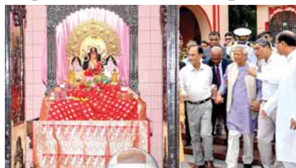
Bangladesh's Chief Adviser Muhammad Yunus with Hindu community members at the famous Dhakeshwari Temple in Dhaka, on Tuesday

Reaching out to the distressed Hindu community members at the famous Dhakeshwari Temple here, Bangladesh's Chief Adviser Muhammad Yunus on Tuesday urged the people to "exercise patience" before judging his Government's role. Yunus, who took charge as the Chief Advisor of the interim Government on August 8 amid ongoing violence and vandalism, including against the minorities, also said each one's rights should be ensured and blamed "institutional decay" for the predicament that his country