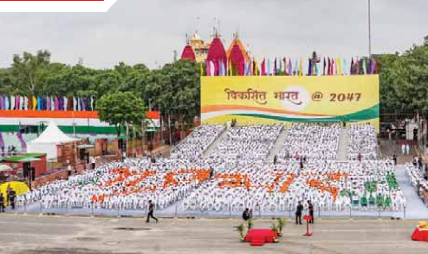
NCC cadets during full dress rehearsal for the 78th Independence Day celebrations at Red Fort, in New Delhi