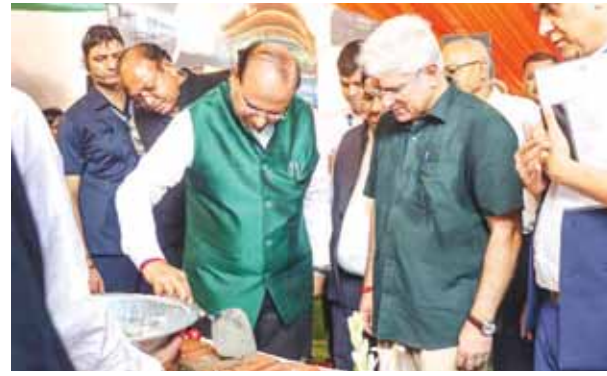
Delhi LG VK Saxena with Transport Minister Kailash Gahlot during foundation stone laying of multi-level electric bus depot, in New Delhi, on Tuesday

Uncertainty over who will hoist the national flag in the absence of Chief Minister Arvind Kejriwal, ended on Tuesday after Lieutenant Governor Vinai Kumar Saxena nominated Delhi Home Minister Kailash Gahlot to hoist the national flag at State Government function on Independence Day at Chhatrasaal Stadium. A controversy erupted with the jailed Chief Minister Arvind Kejriwal directing Cabinet member Atishi to do the same. "Lieutenant Governor is pleased to nominate Minister (Home), GNCTD,