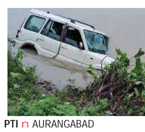
AURANGABAD