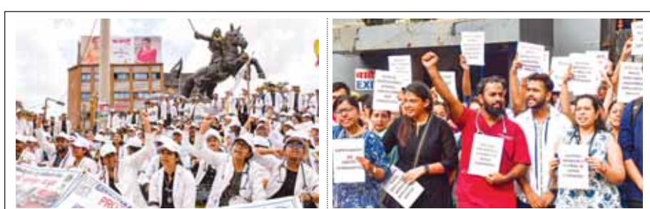
Junior doctors take part in protest at the Rani Chennamma Circle against the rape and murder of a trainee doctor in Kolkata, in Hubballi, on Tuesday PTI Doctors and medical students protest against the sexual assault and killing of a Kolkata based post-graduate trainee doctor, at Nair Hospital in Mumbai, on Tuesday