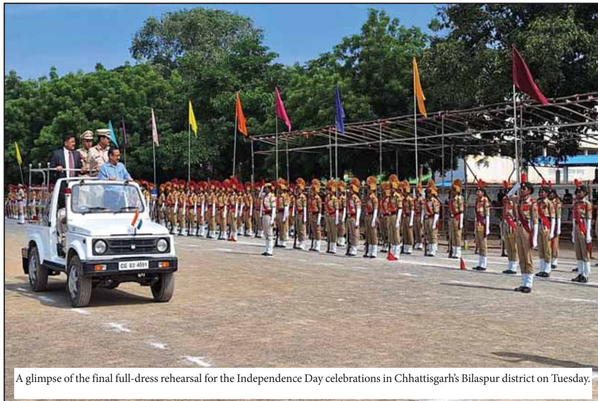
A glimpse of the final full-dress rehearsal for the Independence Day celebrations in Chhattisgarh's Bilaspur district on Tuesday.