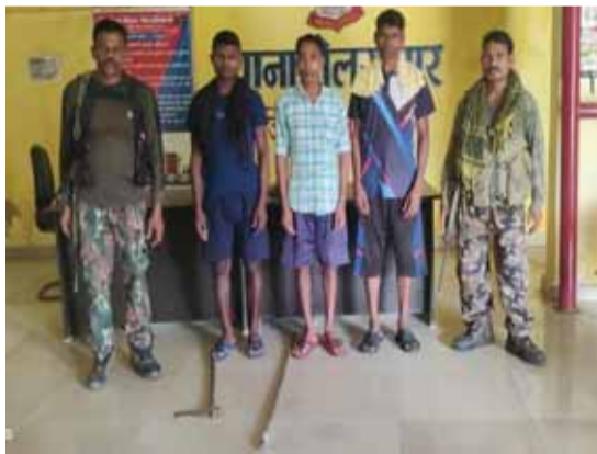
STAFF REPORTER ■ BIJAPUR

Three Maoists, one of them carrying a reward of Rs 1 lakh, were arrested on Monday in Bijapur district of Chhattisgarh.