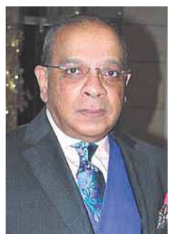
Bangladesh Chief Justice Syed Refaat Ahmed

"I will work with devotion and honesty. I will do everything to establish justice in the society after the mass upheaval. Our sense of justice has been destroyed over the years," he said.