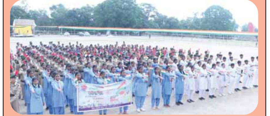
Authorities in Chhattisgarh on Monday organised rallies under the 'Har Ghar Tiranga' campaign and urged people to hoist the tricolour at their homes on Independence Day on August 15.