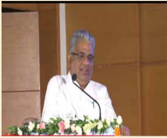
STAFF REPORTER ■ RAIPUR

Steering committee meets on World Elephant Day