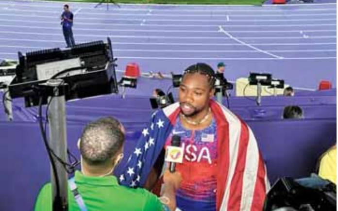
Noah Lyles celebrating on the track, wearing a USA flag.

added to her growing fame with four more medals, and the swimmers, led by another Olympic great in Katie Ledecky, grabbed eight golds. The men's and women's basketball teams won their tournaments, both beating France in the finals. The U.S. Women survived the biggest challenge of their unprecedented run to eight straight Olympic gold medals with a 67-66 win to close out competition at the Paris Games. But the U.S. Women's water polo team went home empty handed after high expectations. FRANCE EXCEED EXPECTATIONS: Led by the brilliant performances of Léon Marchand, who finished with five medals overall, Les Bleus won one more gold than Atlanta in 1996 and nearly doubled their 33 medals overall from the Tokyo Games three years ago. Rugby star Antoine Dupont got the ball bouncing by leading France to gold in the rugby sevens, then Marchand took over.