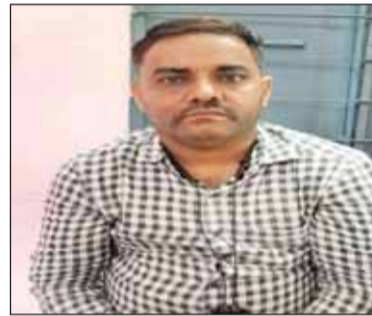
Rs 30,000 as bribe and took Rs 10,000 as the first installment.