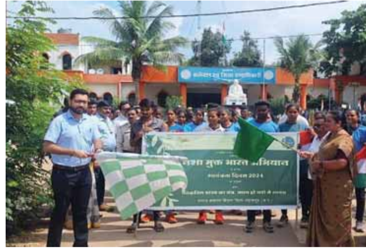
STAFF REPORTER ■ RAIPUR

Under the Nasha Mukta Bharat Abhiyan, authorities in Chhattisgarh took part in a nationwide oath-taking ceremony and called for de-addiction measures on Monday.