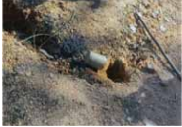
STAFF REPORTER ■ SUKMA

A woman was killed when an improvised explosive device (IED) planted by Maoists exploded in Sukma district in Chhattisgarh, police said on Monday.