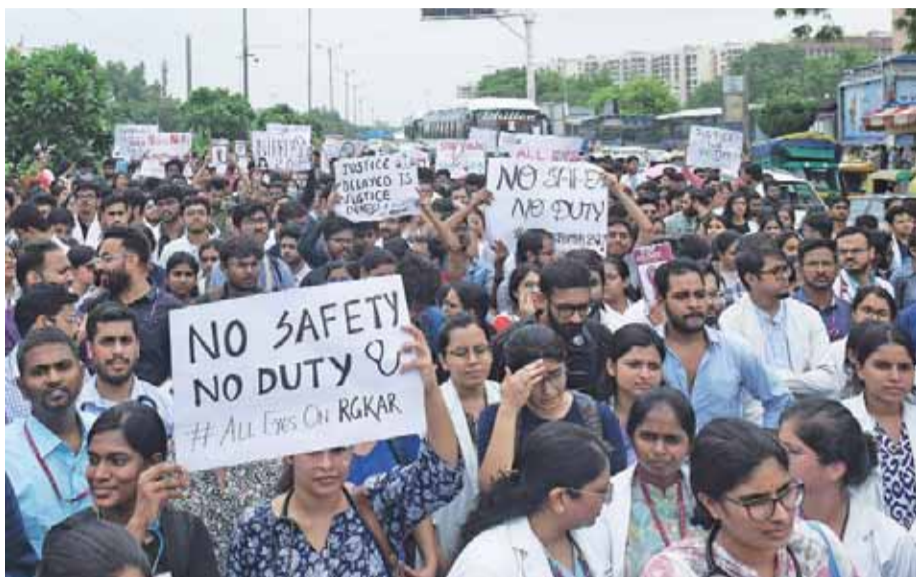
Doctors protest against the sexual assault and killing of a postgraduate trainee doctor in Kolkata, in New Delhi, on Monday

The brutal nature of the crime has intensified calls for justice and has led to the nationwide strike as a mean of expressing solidarity with the victim and demanding systemic changes to ensure the safety of healthcare