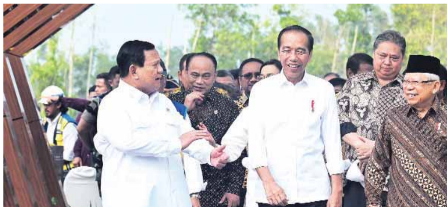
In this photo released by Indonesian Presidential Palace, Indonesian President Joko Widodo (centre) talks with Indonesian Defense Minister and president-elect Prabowo Subianto (left) and Indonesian Vice President Ma'ruf Amin (right) in the new capital city Nusantara in Penajam Paser Utara, East Kalimantan, Indonesia, on Monday.

Indonesian President Joko Widodo held his first cabinet meeting in the future capital of Nusantara, amid miles of construction sites and doubts about the sustainability of the ambitious mega project. Widodo began working from the city two weeks ago, using an office inside the construction site of the massive new palace in the form of the mythical eagle-shaped Garuda, the symbol of the country. The city is set to hold its first Indonesian Independence Day celebration in less than a week. Appearing with his successor, President-elect Prabowo Subianto, in front of the palace, Widodo insisted that the controversial USD 33 billion construction effort will be worth it. "The Nusantara capital is a canvas that carves the future. Not all countries have the opportunity and the ability to build their capital city starting from zero," Widodo said.