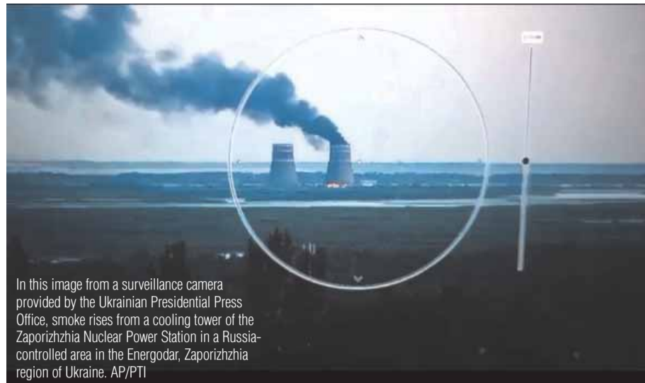
In this image from a surveillance camera provided by the Ukrainian Presidential Press Office, smoke rises from a cooling tower of the Zaporizhzhia Nuclear Power Station in a Russia-controlled area in the Enerгодар, Zaporizhzhia region of Ukraine.