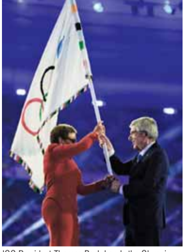
IOC President Thomas Bach hands the Olympic flag to Los Angeles Mayor Karen Bass during the 2024 Summer Olympics closing ceremony at the Stade de France.