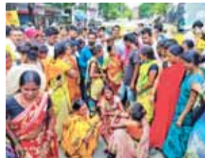
Family members of the victims mourn after a stampede at Baba Siddhanath temple, in Jehanabad district, Monday morning, Aug. 12, 2024. At least seven people were killed and 16 others suffered injuries in the stampede