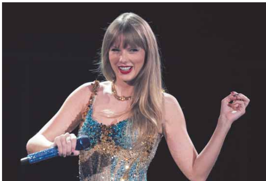
Thursday, Friday and Saturday at the Ernst Happel Stadium, which sat empty Thursday morning aside from media filming outside. Security officials and the organisers of the concerts, Barracuda Music, were in close contact about whether to cancel the three concerts, but in the end it was the organizer who made the call.