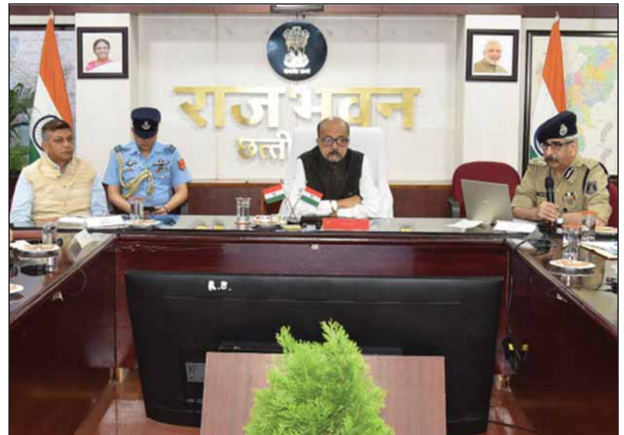
Chhattisgarh Governor Ramen Deka on Thursday took a meeting of officials including the Chief Secretary and the Director General of Police and told them to extend the benefits of government schemes in the Naxalite-affected regions.

August 15, he said. Congress leaders and workers will leave behind stray cattle at district Collectorate and SDM offices, he added.