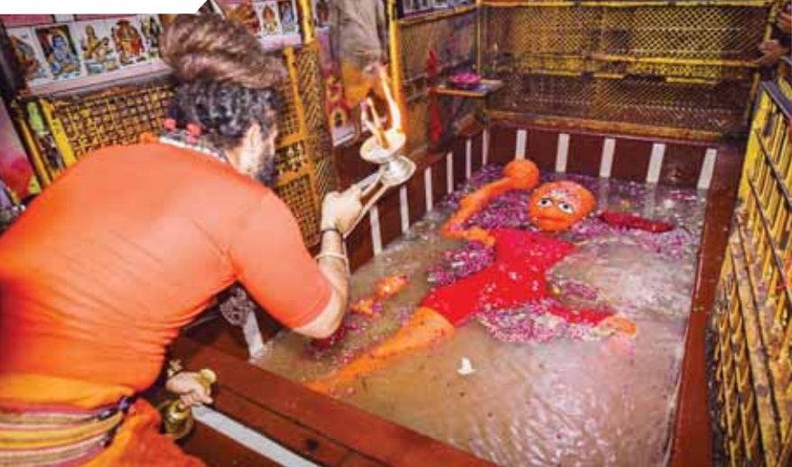
A priest performs 'aarti' at Bade Hanumanji temple which was flooded after heavy rains in Prayagraj