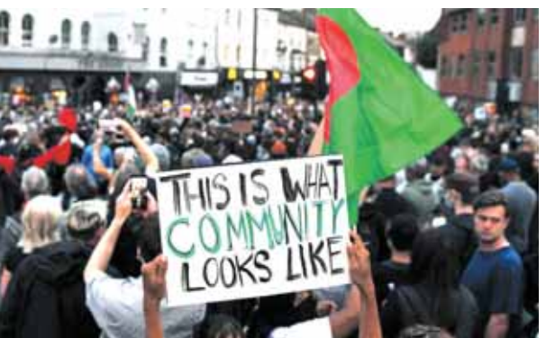
revealed that dawn raids were carried out early on Thursday morning to arrest suspected violent offenders from the past few days. "What I want to make really clear is those we've arrested aren't protesters, patriots or decent citizens. They're thugs and criminals. Around 70 per cent have previous convictions for weapon possession, violence, drugs and other serious offences. Some have football banning orders. These are violent people taking to the streets under the guise of protest to engage in disorder," he said. London Mayor Sadiq Khan thanked people who peacefully stood "united against racism and Islamophobia", as well as the "heroic police force" for working round the clock to

PTI ■ LONDON A massive turnout of anti-racism counter-protesters swarmed the streets of London and other UK cities in an effort to outnumber the far-right violent mobs causing mayhem over the past week, described by Scotland Yard as a "show of unity from communities". Fears of violence at several planned extremist rallies targeting immigration lawyers and agencies across London and other cities on Wednesday evening abated as thousands of specialist police officers patrolled the streets and counter-protesters waving placards reading "Smash Fascism & Racism" and "Stop the far right" turned out in hoards for peace marches. The UK government, however, cautioned that there is intelligence that more far-right action could take place in the next few days even as there was relief that violent disorder was averted overnight. "Last night more than 1,000 officers were deployed across the capital ready to respond to any scenes of disorder. Their efforts and the strength of unity demonstrated by London's communities resulted in a largely peaceful evening," said Metropolitan Police chief Mark Rowley, who