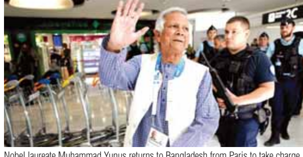
Nobel laureate Muhammad Yunus returns to Bangladesh from Paris to take charge of interim Government