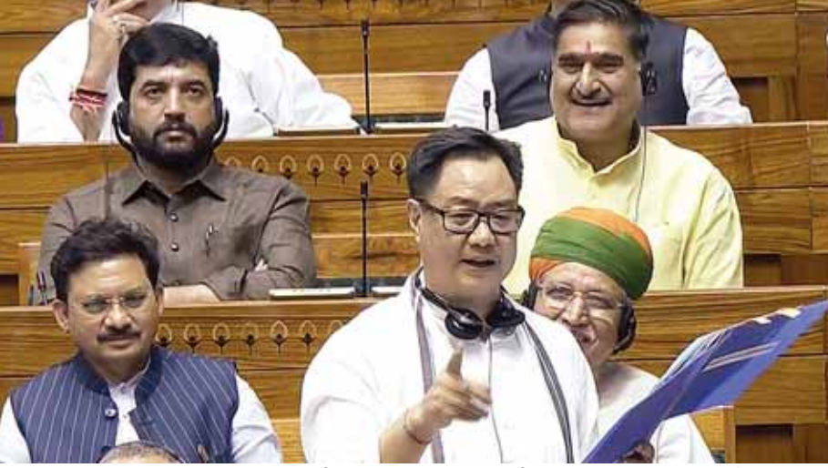
Union Minister Kiren Rijiju speaks in the Lok Sabha during the Monsoon Session of Parliament, in New Delhi, on Thursday