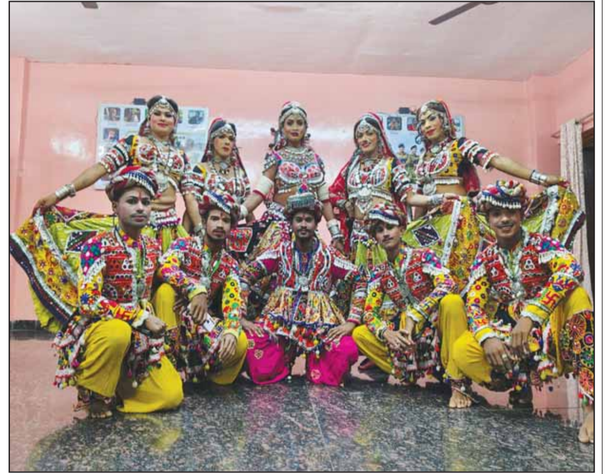
Transgender artists call for dowry abolition through various initiatives at a Chhattisgarh Culture Department programme in Raipur on Monday.

A total of 2,046 children are residing in child care institutions in the state. Of them, 1,318 are studying.