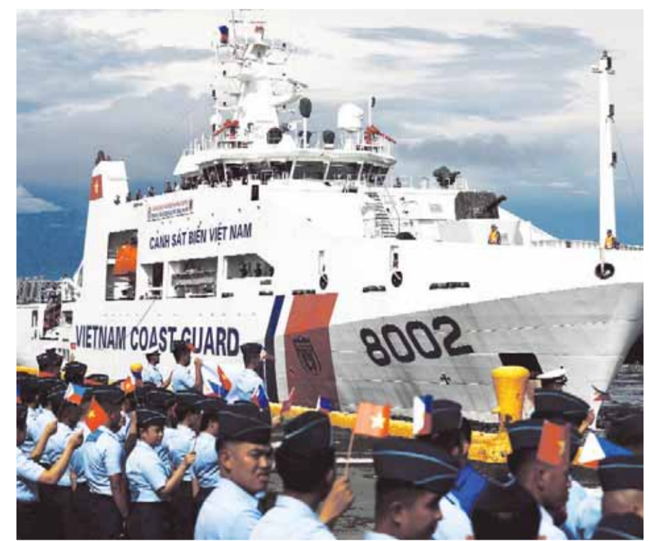
Manila : Philippine Coast Guard personnel wave flags as the Vietnam Coast Guard CSB-8002 patrol ship makes a port call at the Port of Manila, Philippines, 05 August 2024. Philippine and Vietnam coastguards will conduct joint maritime exercises in the disputed South China sea to foster mutual understanding and enhanced cooperation between the two nations

Japan's defence minister held talks with senior officials in Cambodia, a top ally of China, on Monday as he began a Southeast Asian trip that will also take him to Vietnam, whose relations with Beijing are complicated by maritime disputes. Japan has historically maintained warm relations with Cambodia, but its influence is minor compared to that of China, Tokyo's biggest geopolitical rival in Asia, with growing influence throughout Southeast Asia. Tokyo is disturbed by China's aggressive maritime activity, as are several Southeast Asian nations, and seeks to counter Beijing's diplomatic and economic outreach. Defence Minister Minoru Kihara held talks with his Cambodian counterpart, Tea Seha, as well as with Prime Minister Hun Manet and former Prime Minister Hun Sen, who is now president of the Senate, Defence