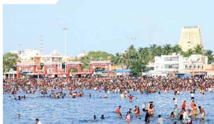
People take a dip before performing rituals on the occasion of 'Aadi Amavasi', in Rameshwaram