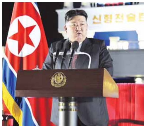
In this photo provided by the North Korean government, Kim Jong Un speaks during a ceremony to mark the delivery of 250 nuclear-capable missile launchers to frontline military units, in Pyongyang, North Korea, on Sunday

North Korea marked the delivery of 250 nuclear-capable missile launchers to frontline military units at a ceremony where leader Kim Jong Un called for a ceaseless expansion of his military's nuclear program to counter perceived US threats, state media said on Monday. Concerns about Kim's nuclear program have grown as he has demonstrated an intent to deploy battlefield nuclear weapons along the North's border with South Korea and authorised his military to respond with preemptive nuclear strikes if it perceives the leadership as under threat. North Korea's official Korean Central News Agency said the launchers were freshly produced by the county's munitions factories and designed to fire "tactical" ballistic missiles, a term that describes systems capable of delivering lower-yield nuclear weapons. Kim said at Sunday's event in Pyongyang the new launchers would give his frontline units "overwhelming" firepower over South and make the operation of tactical nuclear weapons more practical and efficient. State media photos showed lines of army-green launcher trucks packing a large street with seemingly thousands of spectators attending the event, which included fireworks. North Korea has been expanding its lineup of mobile short-