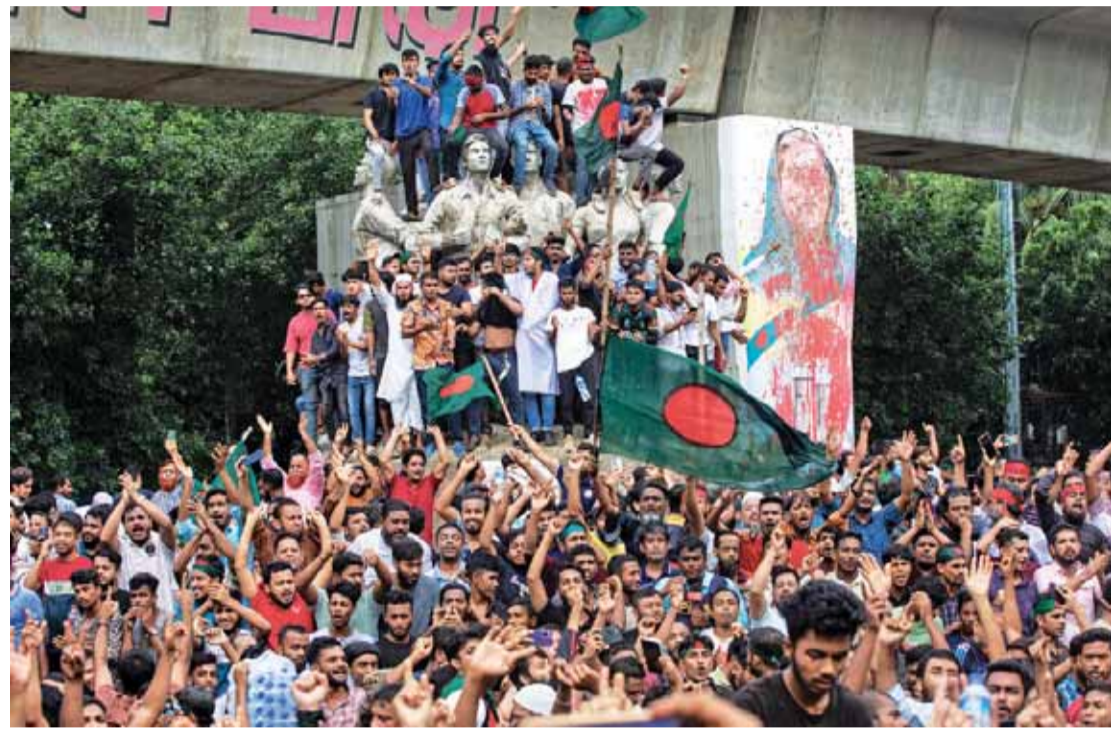
Protesters climb a public monument as they celebrate after getting the news of Prime Minister Sheikh Hasina's resignation, in Dhaka, Bangladesh. (Right top) Sheikh Hasina