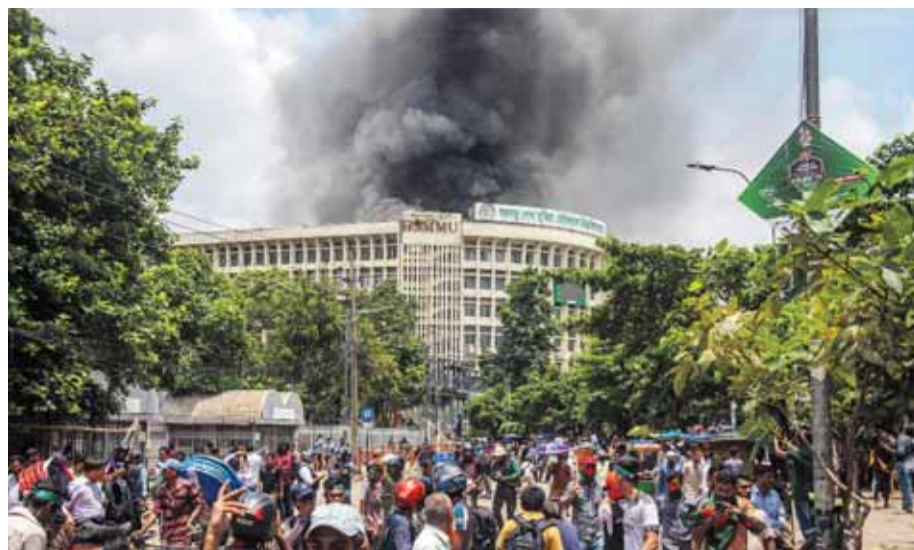
Black smoke rises from the Bangabandhu Sheikh Mujib Medical University during clashes between protesters and Awami League members, on the first day of the non-cooperation movement in Dhaka, on Sunday, August 4

became prime minister. Five years later, Hasina was elected prime minister in the 1996 general elections. Hasina was voted out of office in the 2001 elections but returned to power with a thumping victory in 2008 polls. Khaleda Zia-led BNP has been left in the lurch since then. Hasina escaped an assassination bid in 2004 when a grenade exploded at her rally. Soon after coming to power in 2009, Hasina set up a tribunal to try 1971 war crimes cases. The tribunal convicted some high-profile members of the opposition, sparking violent protests. Jamaat-e-Islami, an Islamist party and a key ally of BNP, was banned from participating in elections in 2013. BNP chief Khaleda Zia was sentenced to 17 years in prison on corruption charges. The BNP boycotted the 2014 elections but joined the one in 2018, which party leaders later said was a mistake, alleging that the voting was marred with widespread rigging and intimidation. In the 2024 elections,