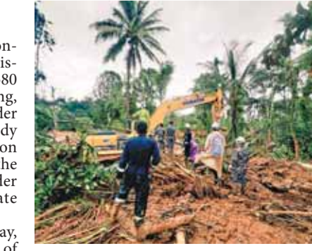
A rescue operation underway after a landslide in Wayanad

As search and rescue operations continue in landslide-hit Wayanad district in Kerala which has claimed over 380 lives and left more than 100 missing, Union Environment Minister Bhupendra Yadav on Monday attributed the tragedy to the "illegal human habitat expansion and protection for illegal mining in the fragile region by local politicians" under the tutelage of the Southern State Government.