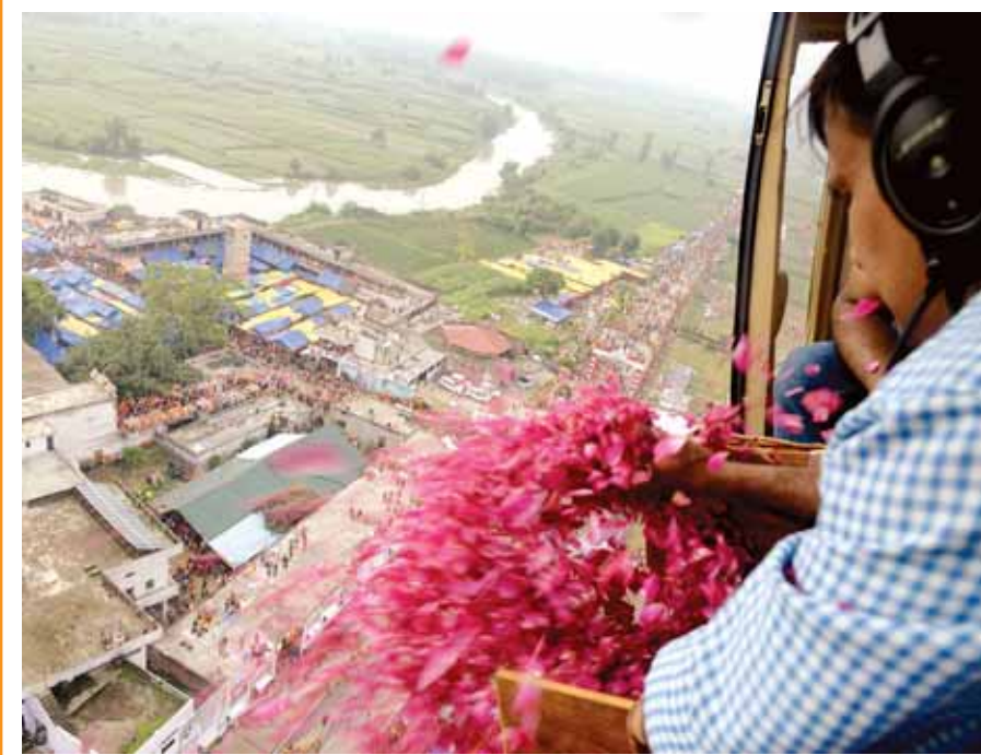
A helicopter showers flower petals on 'Kanwariyas', at Pura Mahadev Temple in Baghpatt