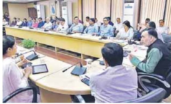
addressing various pollution sources, the Delhi government will be able to take necessary steps to mitigate pollution effectively," Rai said.

The conference aims to create a robust action plan by incorporating expert suggestions, the minister said during the meeting. "By identifying and