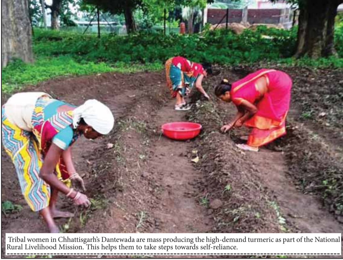
Tribal women in Chhattisgarh's Dantewada are mass producing the high-demand turmeric as part of the National Rural Livelihood Mission. This helps them to take steps towards self-reliance.