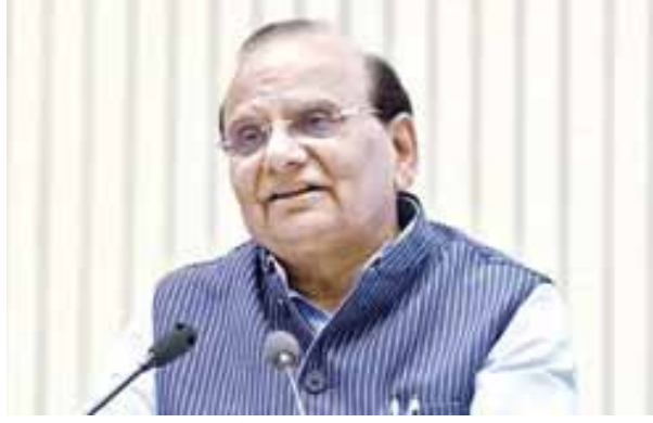
under the control of AAP" said the LG office.

"While this is undoubtedly another example of abuse and scoot typical of the AAP and its leadership, the fact of the matter is that the drain in which the unfortunate incident of drowning happened at Khoda colony belonged to the MCD