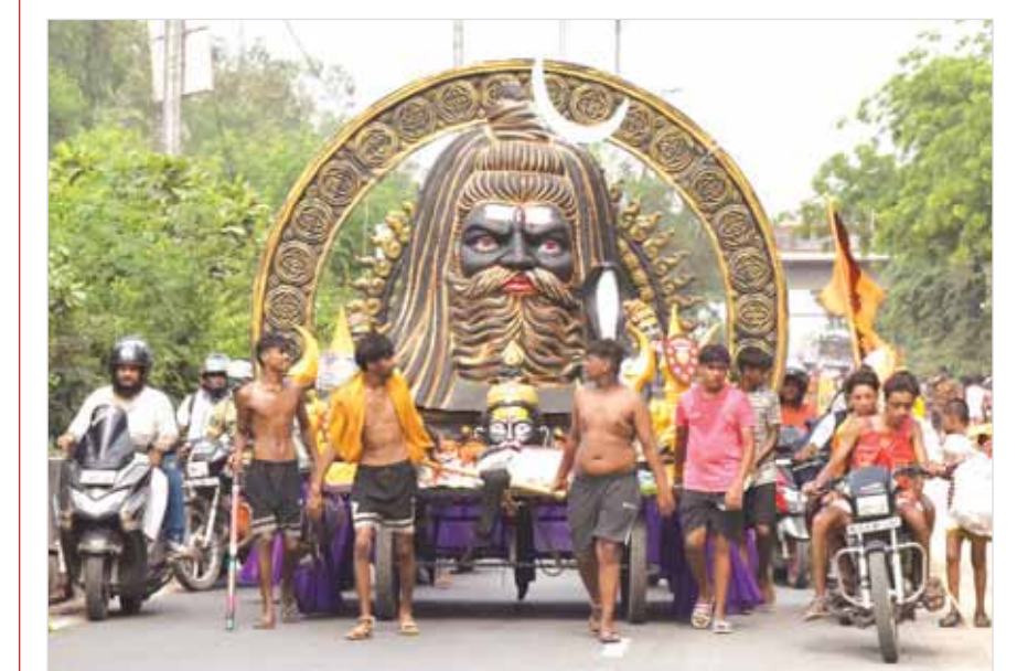
Kanwariyas or Lord Shiva devotees carry holy water during the 'Kanwar Yatra' in the month of 'Shravan', in New Delhi, on Wednesday