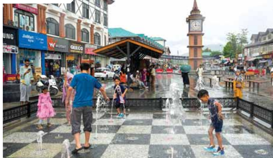
Children play at fountains near Lal Chowk on a rainy day in Srinagar