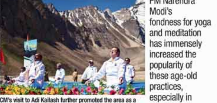
CM's visit to Adi Kailash further promoted the area as a notable pilgrimage destination

The AYUSH Policy of Uttarakhand summarises enterprising strategies to incorporate conventional healthcare procedures with contemporary methods, striving for holistic wellness and financial development. The policy strives to capitalise on this legacy by encouraging the cultivation of over 1,000 rare medicinal plants native to the area. Endeavours such as the Chief Minister Medicinal Plant Development Programme are set to involve 50,000 farmers in growing these plants, promoting sustainable farming approaches, and augmenting regional revenues. In the domain of AYUSH production, Uttarakhand already has a strong drive, backed by ample raw materials and promising business necessities. The state hosts multiple GMP-certified manufacturing departments making a vast array of AYUSH medicines and consumer items. Under the new policy, more incentives and assistance will be