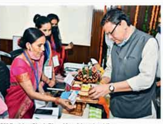
CM Pushkar Singh Dhami inquiring about the products made by local artisans

Uttarakhand's 'One District Two Products' (ODTP) Scheme is an innovative initiative launched by Chief Minister Pushkar Singh Dhami in October 2021. The scheme aims to promote local products and create self-employment opportunities across all 13 districts of the state.