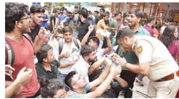
A police personnel interacts with students during a protest over the deaths of three civil services aspirants due to drowning at a coaching centre in Old Rajinder Nagar area, in New Delhi, on Wednesday

Interacting with the protesting students at UPSC coaching hub in old Rajinder Nagar, the senior civic body official said there can be no