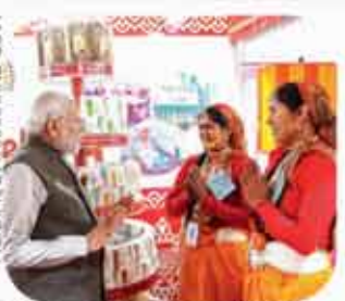
PM Narendra Modi interacting with women entrepreneurs (SHG) during Uttarakhand Investor Summit 2023

Local products find national & global platforms