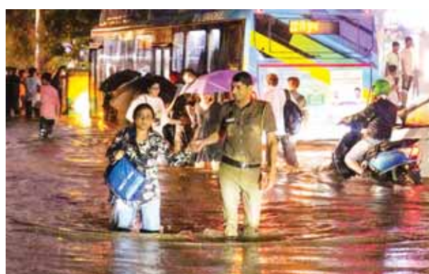
A woman being assisted by a police official while wading through a waterlogged road during rain near Pusa Road area, in New Delhi, on Wednesday

Sudden rain brought the National Capital and adjoining regions, including Noida and Ghaziabad, to a standstill on Wednesday evening with water woes, traffic congestion and major power cuts albeit there was respite for the residents who had been reeling for days from the muggy and sweltering weather due to high humid levels in the city. While several areas suffered power cuts, loadshedding, at least 10 flights were diverted from the Indira Gandhi International (IGI) airport between 7.30 pm and 8 pm. The city has been put on a red alert and the National Flash Flood Guidance Bulletin has included Delhi in its list of 'areas of concern'.