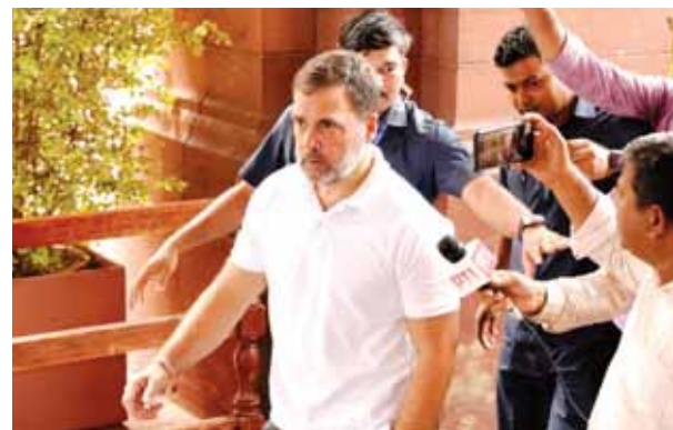
Leader of Opposition in Lok Sabha and Congress MP Rahul Gandhi arrives for the Congress Parliamentary Party meeting, at the Parliament House in New Delhi, on Wednesday

As the row erupted in Parliament, the Congress said the Gandhi family's caste is martyrdom but the BJP-RSS will never understand that. Upon protests from the Opposition benches, the Chair, Jagadambika Pal, assured MPs that the comments will be expunged, he said. The BJP flayed the Congress for escalating the caste row and said what's wrong in asking the