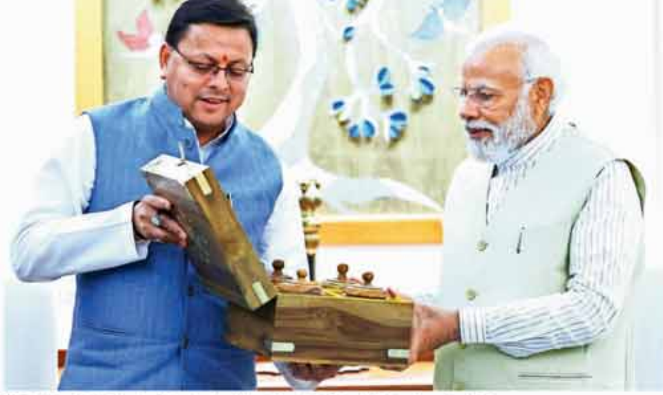
CM Pushkar Singh Dhami gifting 'Grain of Uttarakhand' to Prime Minister Narendra Modi

Uttarakhand has set a standard by leading in essential domains including healthcare, clean energy, reduction in poverty, urban sustainability, and environmental protection