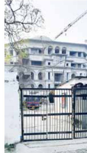
the BJP-PDP alliance government in office. The alliance government raised certain specific queries related to the administrative and financial approval before giving their formal nod to the revised estimates. After the fall of the BJP-PDP alliance government, the pro-

crores. After the Abrogation of Articles 370 and 35-A in August 2019, developmental projects worth several hundred crores were launched in the Union Territory of Jammu and Kashmir. Ironically, this ambitious project once again missed the bus. Currently, the project executing agency is awaiting a nod to receive Rs 134 crores as per the revised estimates. So far the project executing agency has failed to receive adequate funds to ensure its timely completion. The foundation stone of the ambitious project was laid on July 1, 2011, by the then Chief Minister Omar Abdullah. On ground zero, the construction work was started in August 2011. Initially, the project was estimated to be built at a cost of around 113 crores in a stipulated period. According to the project engineers, who remained in charge from time to time the work on the project was going on smoothly till 2015 but the same hit the roadblock during