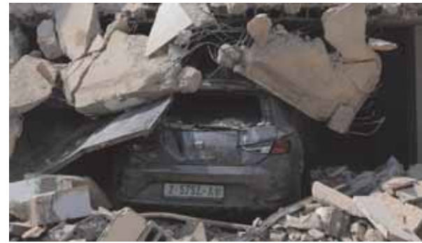
A damaged house following an Israeli military operation in the West Bank refugee camp of Nur Shams, Tulkarem on Friday.