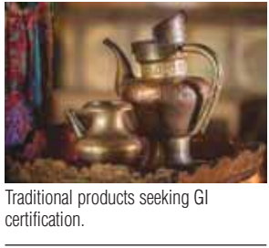
Traditional products seeking GI certification.