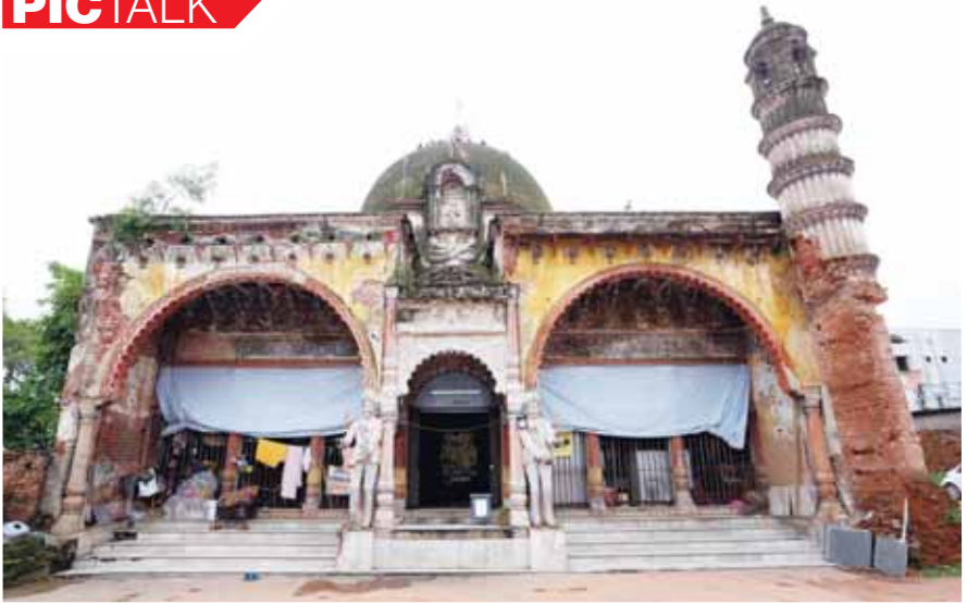
Aukhara Nimbarika Peeth Mahanta Asthal, a 250-year-old Mutt in East Bardhaman