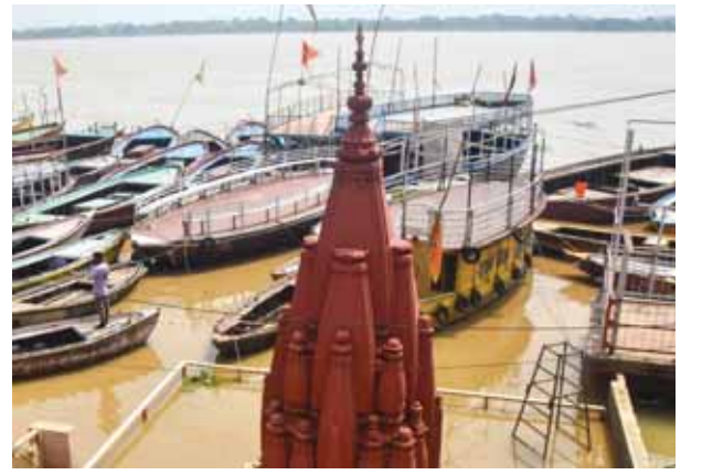
A submerged temple following the rise of Ganga's water level after rains at Dashashwamedh Ghat in Varanasi on Friday

The flood situation in downstream UP-Bihar border district of Purvanchal (eastern UP) Ballia has turned grim again. The Ganga was flowing in Ballia at 58.02 metres at 8 am on Friday against the danger mark of 57.615 metres and is expected to reach 58.65 metres by Saturday morning. However, the rising trend is likely to be checked soon as the river was recorded steady at upstream Phaphamau, Prayagraj and Mirzapur but it continued to rise in Varanasi on Friday. As per the report of Middle Ganga Division-III of Central Water Commission (CWC), at 8 am the Ganga was recorded at 68.23 metres and it continued to rise at a speed of 10 mm