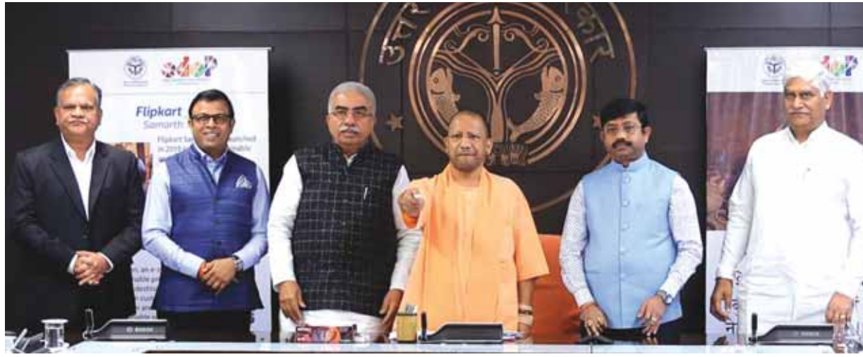
Chief Minister Yogi Adityanath on Friday virtually inaugurating Flipkart's warehouses in Unnao and Varanasi

Virtually inaugurates Flipkart's warehouses in Unnao, Varanasi