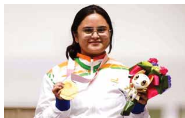
Avani Lekhara during the national camp at the Karni Singh ranges, where she worked hard on regaining her strength and mentally steeling herself for Paris.

including shot-put, powerlifting and wheelchair volleyball before settling on shooting, notched up 228.7 for the third-place finish. This is the first time in India's Paralympic history that two shooters have pulled off medals in a single event. Avani, who hails from Jaipur, endured a tough buildup to the Paralympics. She grappled with a host of health issues, including a gallbladder surgery, which forced her to take a recovery break of one and half months. But the committed shooter, who is an assistant conservator of forest with the Rajasthan Government, did not let health concerns distract her from her aim of