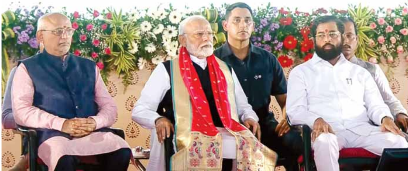
Prime Minister Narendra Modi with Maharashtra Governor CP Radhakrishnan and Chief Minister Eknath Shinde during laying of the foundation stone of Vadhvan Port and launching of development works, in Palghar district, on Friday