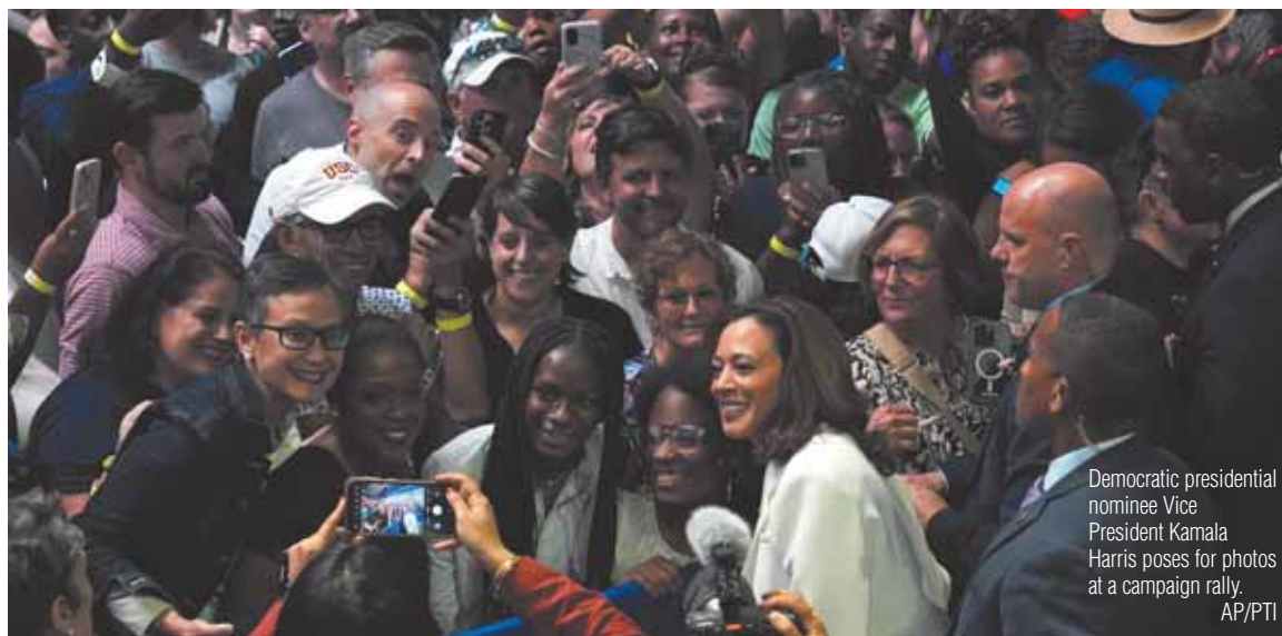
Democratic presidential nominee Vice President Kamala Harris poses for photos at a campaign rally.

The American people are ready to "turn the page" on Donald Trump, Kamala Harris has said, asserting that her Republican challenger is pushing an agenda which "divides" the country and "diminishes the character" of its people. In her first major television interview of her presidential campaign, the 59-year-old US Vice President, who will face Trump in the November 5 elections, said the American people are ready for a "new way forward". "I think sadly in the last decade, we have had in the former president someone who has really been pushing an agenda and an environment that is about diminishing the character and the strength of who we are as Americans — really dividing our nation," Harris, in a joint interview with her running mate Minnesota Governor Tim Walz, told CNN. "And I think people are ready to turn the page on that," Harris, the Democratic Party's candidate, said. "The American people are ready for a new way forward. Our former president has pushed an agenda that diminishes the character and strength of who we are as Americans, and divides our nation. People are ready to turn the page," she said in a post on X, linking an interview snippet. Harris, who is of Indian and African heritage, also refused to engage in Trump's identity politics during the interview. She eluded questions about Trump's claims over her racial identity, calling those a part of the "same old tired playbook".