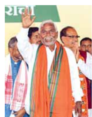
Former Jharkhand chief minister Champai Soren with Union Minister Shivraj Singh Chouhan waves to supporters after joining BJP during a ceremony, in Ranchi, Friday

On a day when Ghatshila OMLA Ramdas Soren replaced him in the Jharkhand Cabinet taking oath as a Minister, former Chief Minister Champai Soren, popularly known as the 'Kolhan Tiger', joined the BJP on Friday, marking a significant change in the State's political landscape just ahead of the Assembly elections. Champai along with a large number of his supporters crossed over to the saffron camp in the presence of Union Minister Shivraj Singh Chouhan and Assam Chief Minister Himanta Biswa