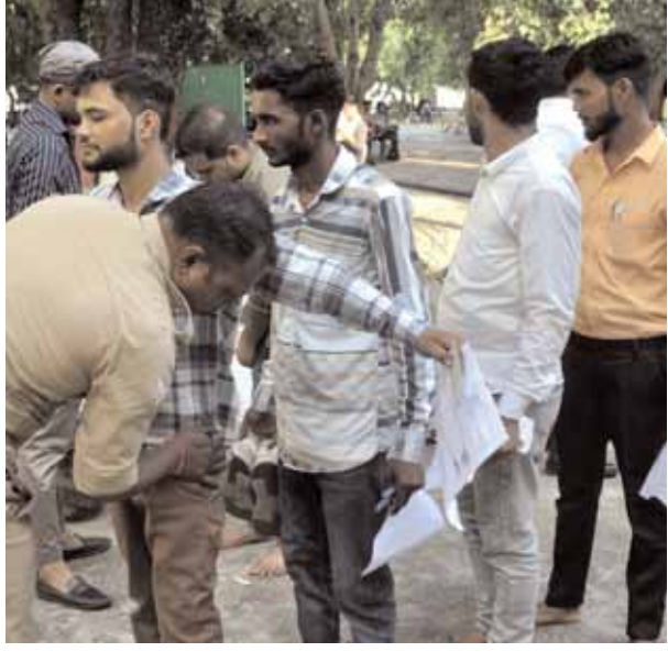
Candidates being frisked at an exam centre in Jankipuram on Friday

The Uttar Pradesh Police recruitment exam was successfully conducted across all 67 districts of the state on Friday with foolproof security in place.