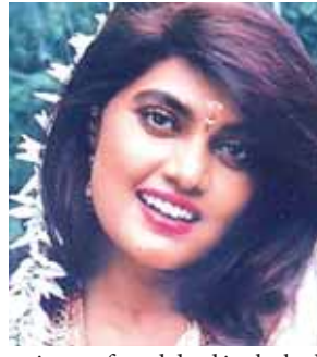
artist was found dead in the bedroom of her rented house. Balanathan Benjamin Mahendra (known by the screen name Balu Mahendra), a Sri Lankan movie maker who was 25 years senior to her was cited as the cause for Sobha's 'suicide'. Mahendra had married Sobha

Though it was claimed that she committed suicide, nobody could give any reason for her decision. Though names of producers Kunchako, Azim Bhai and actor Prem Nazir were linked with her death, investigators stood their ground that it was a suicide. The death of Shoba, who became the youngest star in the history of Indian cinema at 18 to win the national award for best actress (1979) for her realistic depiction of a wayside worker which demolished the age-old concept of female artists as decorative pieces in films is another tragedy of movies. The Urvashi Award turned out to be Shoba's swan song. Within days of the honour being bestowed on her, the