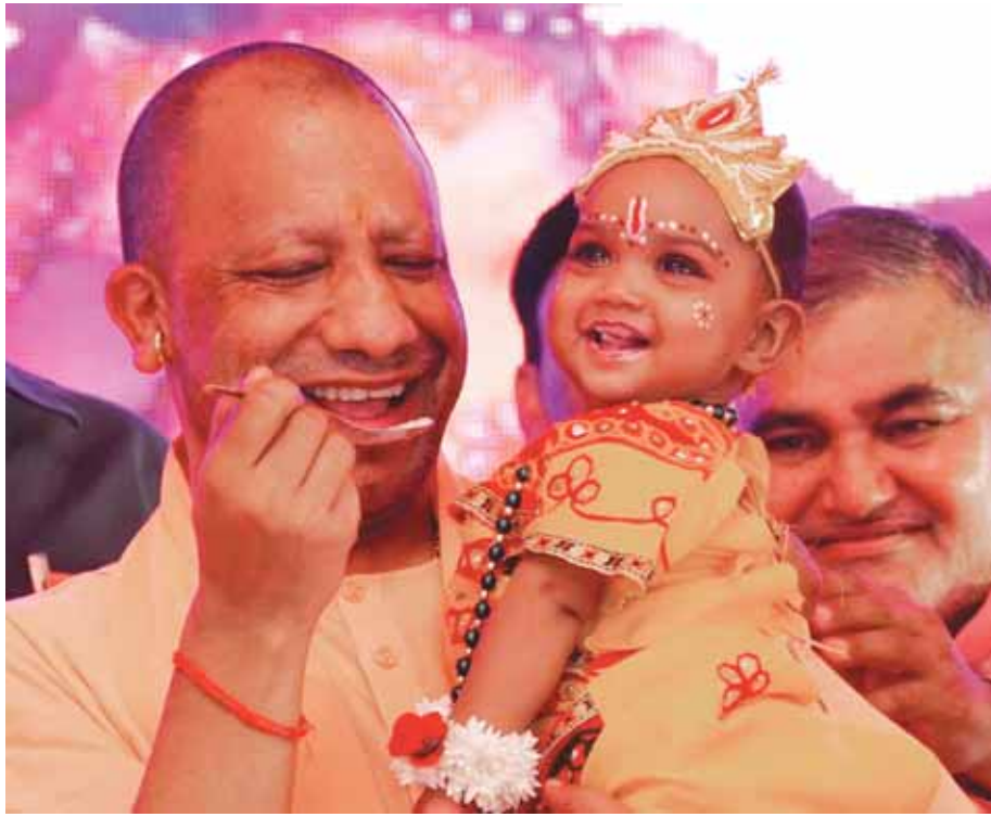
UP Chief Minister Yogi Adityanath conducts 'Annaprashan' of a child during a programme in Aligarh on Wednesday.

Emphasising that under Prime Minister Modi's leadership, India is on track to become the world's largest economy, Yogi