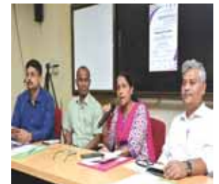
IMS-BHU's Surgery department faculty members addressing a press conference in Varanasi

investigative procedure and management. On the second day, they informed that the surgical lecture on the important surgical topics will be delivered by the eminent surgeons. On the same day, various orations will be delivered by the eminent surgeons from various part of the country.