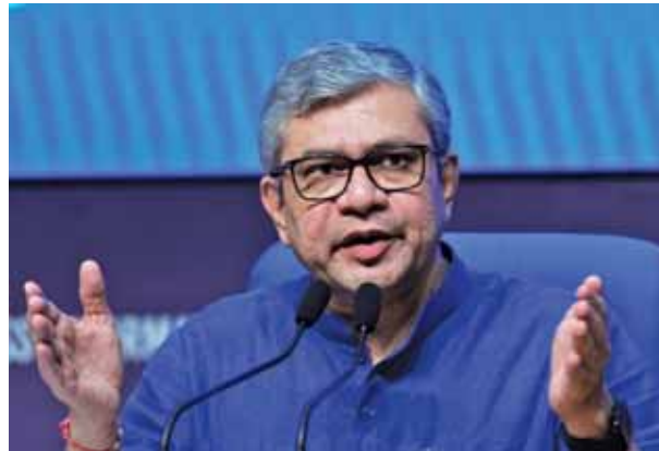
Union Minister Ashwini Vaishnaw briefs the media over Cabinet decisions in New Delhi on Wednesday

In a determined effort to boost domestic industry and create jobs, the Union Cabinet on Wednesday approved establishment of 12 new industrial cities in 10 States with an estimated investment of ₹28,602 crore. More than one million direct jobs will be created in these projects. Spanning 10 States and strategically located along six major corridors, these projects represent a significant leap forward in India's quest for enhanced manufacturing capabilities and rapid economic growth. These industrial areas will be located at Khurpia in Uttarakhand, Rajpura-Patiala in Punjab, Dighi in Maharashtra, Palakkad in Kerala, Agra and Prayagraj in UP, Gaya in Bihar, Zaheerabad in Telangana, Orvakal and Kopparthi in AP, and Jodhpur-Pali in Rajasthan. The Union Cabinet has approved 12 new project proposals under the National Industrial Corridor Development Programme (NICDP) with an estimated