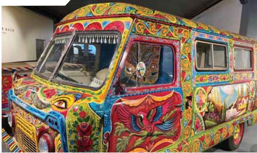
A beautifully painted bus at display in the Heritage Transport Museum, in Gurugram