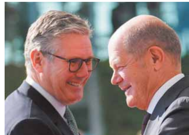
German Chancellor Olaf Scholz (right) welcomes Britain's Prime Minister Keir Starmer in Berlin on Wednesday.

The leaders of Germany and the United Kingdom announced plans on Wednesday to draw up a treaty meant to deepen the two nations' trade, defence and other ties. The move comes as new UK Prime Minister Keir Starmer moves ahead with plans for a "reset" of relations with the European Union. German Chancellor Olaf Scholz said that he welcomes fellow centre-left leader Starmer's desire for a new beginning in relations with the EU, and "we want to take this outstretched hand". Starmer took office in early July after the previous Conservative government was trounced in an election. Four years after the UK left the EU, he says he wants to rebuild ties strained by years of ill-tempered wrangling over Brexit terms. He said that he hopes to conclude the bilateral agreement with Germany, which has Europe's biggest economy, by the end of this year. "That will be ambitious, it will