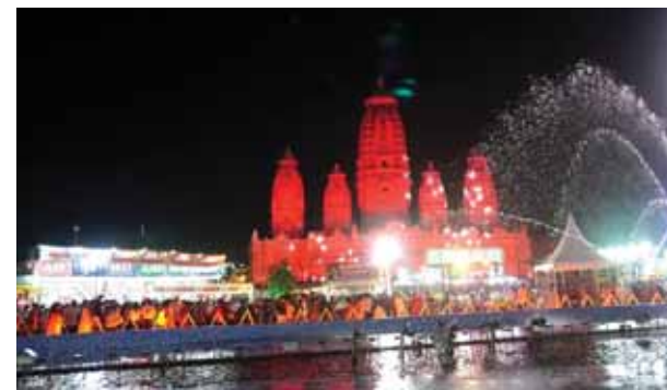
Beautifully decorated Shri Radha Krishna temple (JK Temple).

The Janmashtami festival was inaugurated at the Shri Radha Krishna Temple (JK Temple). The spiritual evening commenced at 4:30 pm with a Vedic chanting presentation by the students of JK Temple's Gurukul. Following this the artistes of Kalakunj Group gave a captivating performance of Krishna Leela, beautifully blending music, drama and dance. At 7 pm the Rhythm Group artistes staged a wonderful dramatisation of the marriage of Devaki-Vasudev and the prophecy. It was followed by a mesmerising Krishna Leela performance by the artistes of Swaranjali Group at 8:00 pm, which was thoroughly enjoyed by the devotees. Thousands of devo-