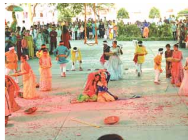
Students presenting a programme on Shri Krishna Janmashtami at BHU in Varanasi on Monday night.