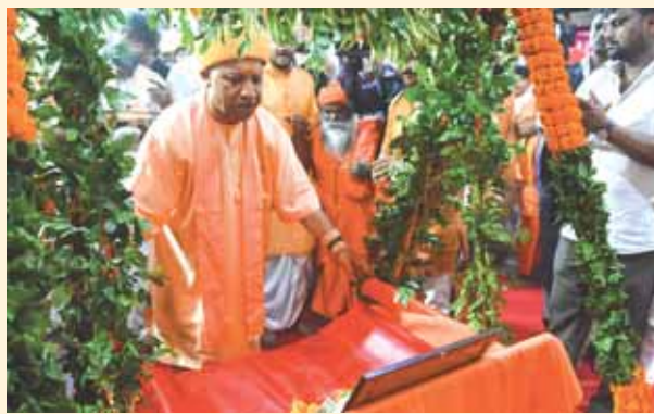
Uttar Pradesh Chief Minister Yogi Adityanath participates in Janmashtami celebrations at Gorakhnath temple in Gorakhpur on Tuesday.

The chief minister also called for enhancing the Integrated Traffic Management System with the installation of additional CCTV cameras and ensuring continuous police presence in sensitive and crowded areas. Stressing the need to enhance civic amenities in the Braj region, the chief minister directed the officials to ensure that the roads were unbroken and free of potholes. He called for special attention to this issue, ensuring that the damaged roads are promptly repaired. Additionally, he directed that roads affected by ongoing works under the Jal Jeevan Mission or Amrit Yojana be repaired as quickly as possible. Furthermore, the CM instructed the officials to maintain cleanliness on the 'Parikrama Marg' and repair roads connected to it. Yogi instructed that door-to-door garbage collection be made more effective, highlighting the importance of public participation through mohalla committees for maintaining cleanliness. He also directed the deployment of additional manpower for cleanliness in the Mathura-Vrindavan area and urged that garbage management efforts be enhanced, drawing inspiration from the Prayagraj Kumbh model. The chief minister instructed that street lighting and decorations in Mathura be improved. He recommended installing solar-powered street lights on major routes and key areas.