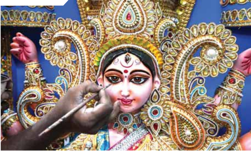
A painter gives final touches to the Goddess Durga's idol ahead of Durga pooja, in Kolkata