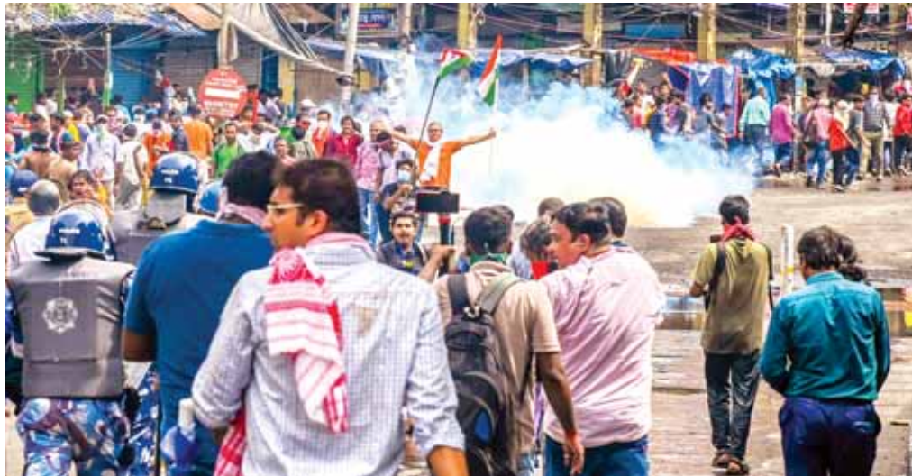
Tear gas shells being used by security personnel to disperse students during their protest march towards West Bengal Secretariat over the alleged sexual assault and murder of a trainee doctor, in Kolkata, on Tuesday

Initial jostling turned into skirmishes with the police repeatedly bursting tear gas, charging water jets and resorting to lathicharge as the charged up agitators that included many women refused to relent and turned aggressive. The pitched battles continued for more than five hours giving the police a harrowing time, sources in the administration said, adding additional combat forces and RAF had to be called in from the neighbouring districts. At various places people profusely bleeding from head were seen being carried away by their co-agitators to the hospitals. Similarly the policemen who often got isolated were also attacked. At Babu Ghat a crowd of agitators badly beat up two policemen with lathis, rods, bricks and even shoes. Some even spit on them while