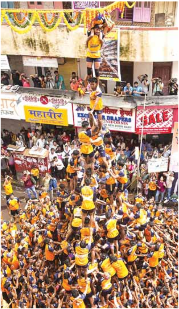
Devotees form a human pyramid to break the 'dahi handi', an earthen pot filled with curd, as part of Janmashtami celebrations, at Dadar, Mumbai, on Tuesday.