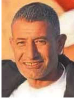
Gallant said the rescue operation was part of the army's "daring and courageous activities conducted deep inside the Gaza Strip," adding that Israel is "committed to taking advantage of every opportunity to return the hostages." Hamas-led militants abducted some 250 people in the October 7 attack, in which some 1,200 people, mostly civilians, were killed. Israel's retaliatory offensive has