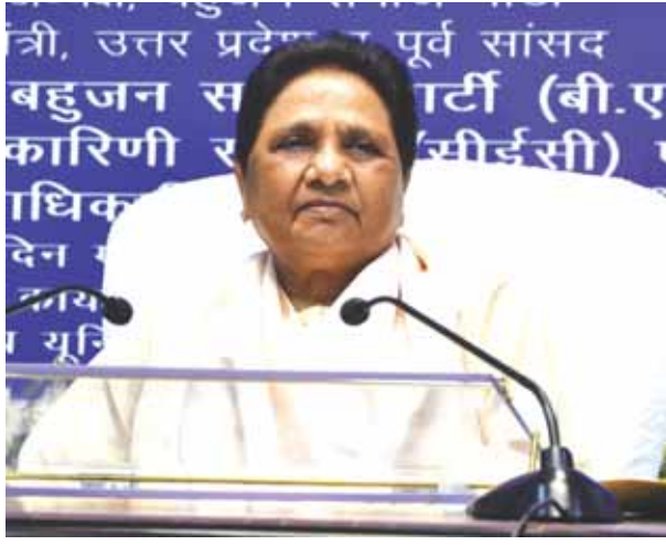
BSP supremo Mayawati addressing a meeting in Lucknow on Tuesday.

She was elected again to the top post unanimously at a special meeting of the BSP Central Executive Committee (CEC) and office bearers from all over the country, a statement said. The party had failed to win a single seat in Uttar Pradesh in the Lok Sabha elections. "Despite electoral reverses, the BSP is not disappointed. It is stoutly pursuing the goal and welfare principle of 'Bahujan Hitay and Bahujan Sukhaye' (progress and prosperity of bahujans) on the strength of the bahujan samaj," she said. She also hit out at the Congress and the BJP, claiming the two national parties are not "true well-wishers of minorities and backward communities in the country. Like anti-Congressism in the past, the politics of the country has now become entangled in anti-BJPism whereas both these parties and their alliances are neither true well-wishers of bahujans, Dalits, adivasis, OBCs, Muslims and other religious minorities nor can they ever be so because their thinking about bahujans... is narrow, casteist, and communal," she alleged. "This is the main reason why