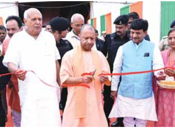
Uttar Pradesh Chief Minister Yogi Adityanath during a programme in Kumarganj, Ayodhya on Sunday