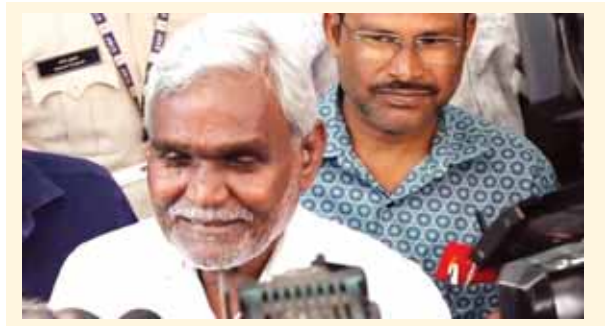
Former Jharkhand Chief Minister Champai Soren speaks with the media upon his arrival at Delhi airport on Sunday.