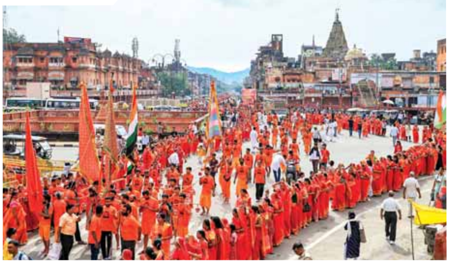
Women devotees carry holy water in the 'Kalash Yatra' in Jaipur