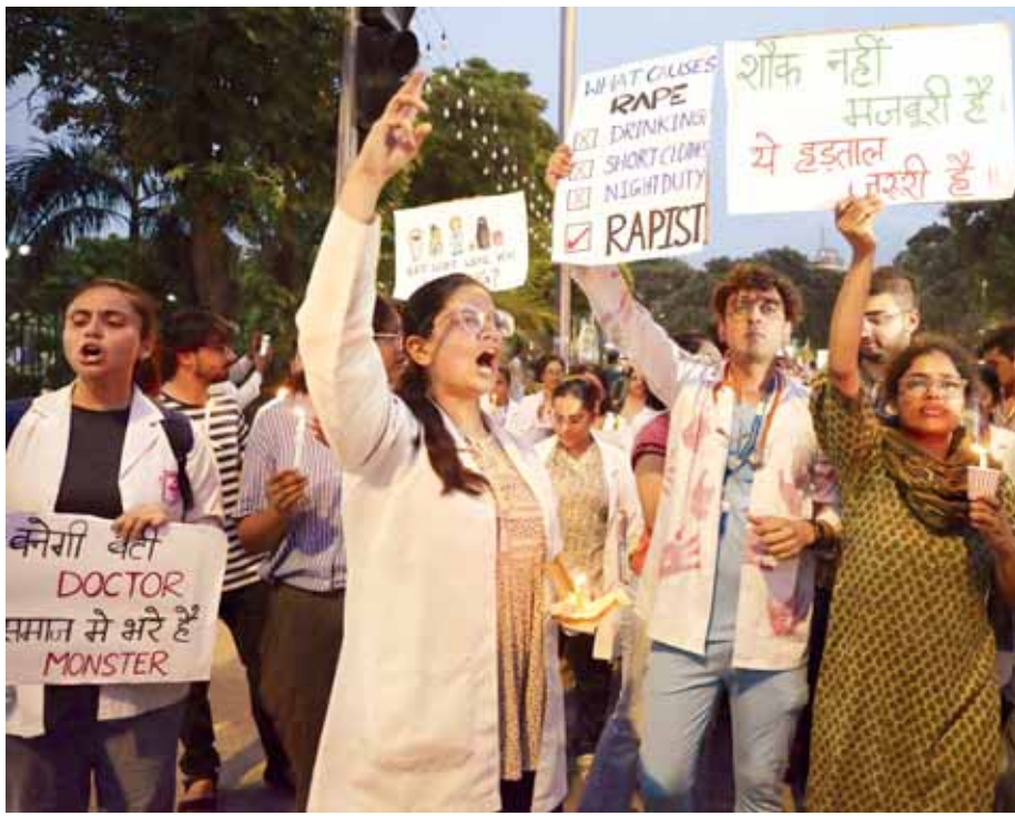
Members of various Resident Doctors' Associations protest during a candle march against the alleged rape and murder of a trainee doctor at Kolkata's RG Kar Medical College and Hospital, at Connaught Place, in New Delhi, on Sunday.