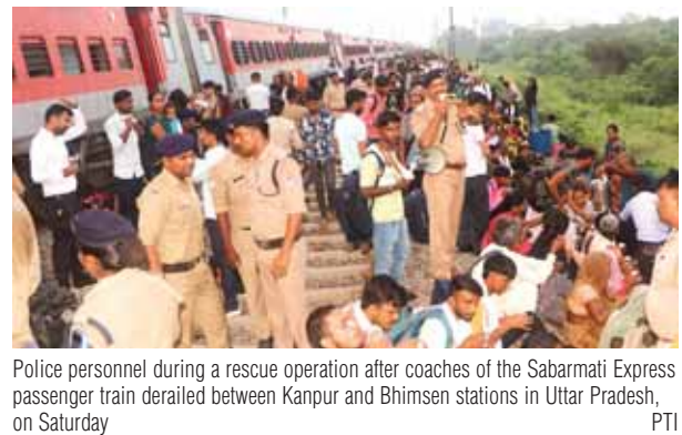
Police personnel during a rescue operation after coaches of the Sabarmati Express passenger train derailed between Kanpur and Bhimsen stations in Uttar Pradesh, on Saturday