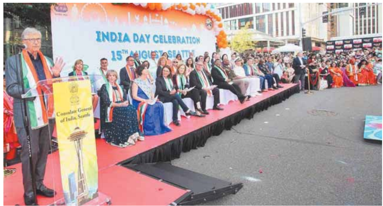
American businessman and Microsoft founder Bill Gates during flagging off the First India Day celebrations, in Greater Seattle area, USA.