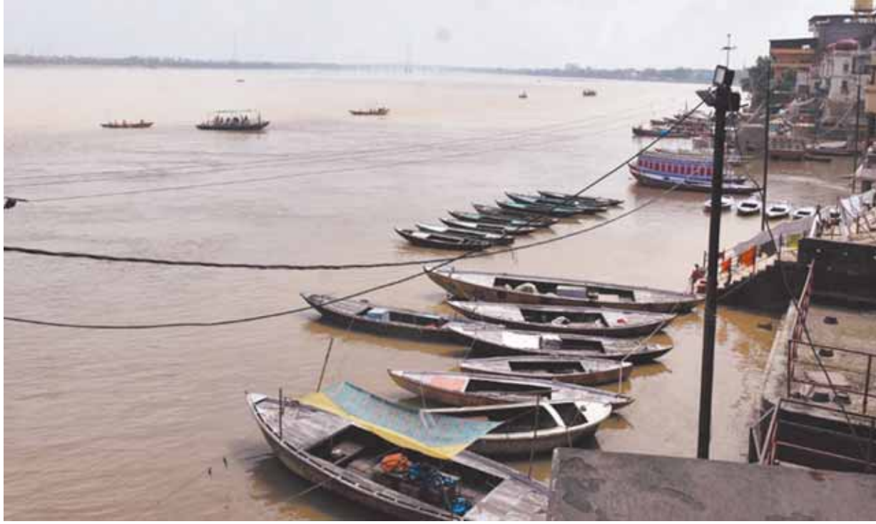
Water level of the Ganga river rising again in Varanasi on Saturday

The heartbeats of the people living in the low-lying area, especially on both sides of river Varuna, increased once again as the water level of river Ganga continued to rise for the second day here on Saturday. It is the fourth time in this rainy season when the Ganga has registered a rising trend. A few back when the Ganga was close to the warning level of 70.262 metres, many localities in Varuna river sides like Saraiya and Salarpur faced flood, forcing the residents to shift to relief camps. As the river Ganga crosses the 69 metre mark, reverse flow starts in the river Varuna from its confluence point near Adi Keshav Ghat in the northern part of the city. As per the report of the Middle Ganga Division-III of the Central Water Commission, at 8 am the water level of the river Ganga was recorded at 67.16 metres and it continued to rise right from upstream Prayagraj and Mirzapur. Wit the Ganga receding at Phaphamaui, it indicates that the water is mainly coming from Yamuna side. In the city, the Ganga water has already entered the famous Sheela Mata Mandir at Old Dashashwamedh Ghat, forcing the devotees to reach the temple through the water. Most of the 'chowkis' of pandas have been submerged in the water. Dozens of low-lying temples at internationally famous 84-odd