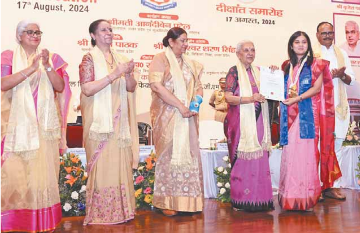
Governor Anandiben Patel doing the honours at the KGMU convocation on Saturday

PNS ■ LUCKNOW Addressing the 20th convocation of King George's Medical University (KGMU) at the Atal Bihari Convention Centre on Saturday, Governor Anandiben Patel emphasised the importance of compassion and sensitivity in medical practice.