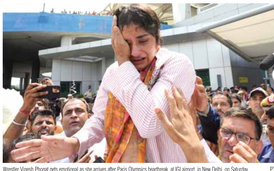
Wrestler Vinesh Phogat gets emotional as she arrives after Paris Olympics heartbreak, at IGI airport, in New Delhi, on Saturday