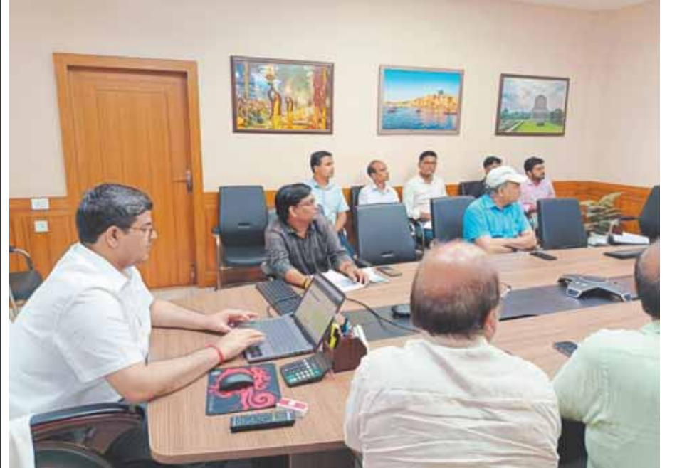
PuVVNL MD launching e-office system in Discom headquarters in Varanasi on Saturday