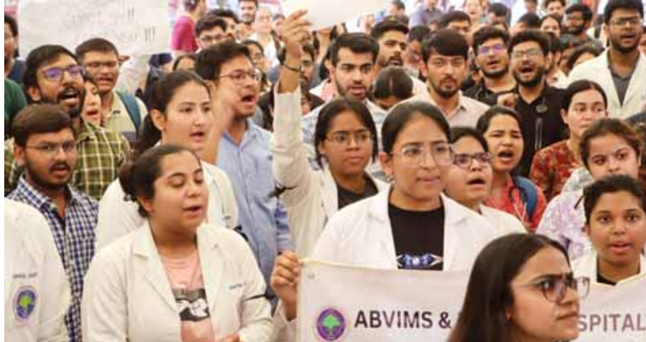
Doctors and staff of RML Hospital stage a protest demanding justice for the woman doctor who was allegedly raped and murdered at Kolkata's R G Kar Medical College and Hospital, in New Delhi, on Saturday