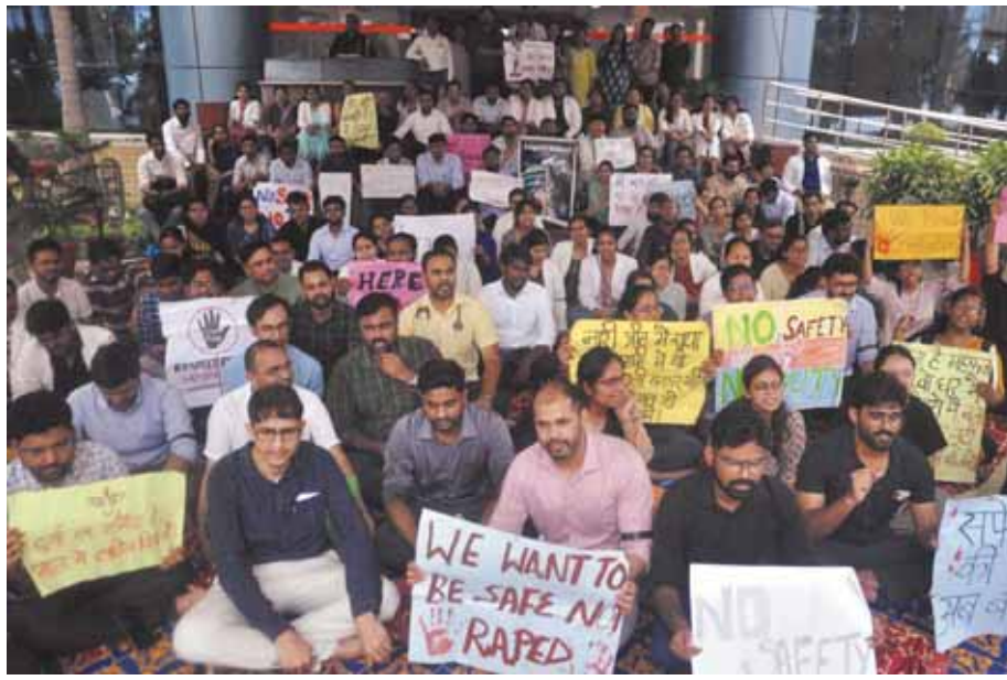
Doctors staging a sit-in at RML hospital on Saturday