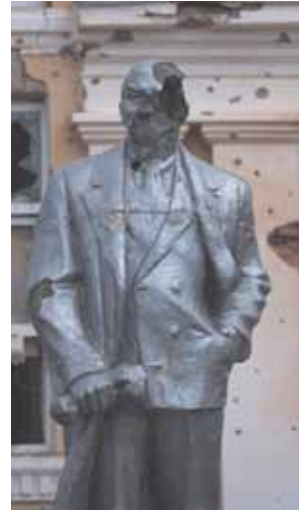
A damaged monument to Soviet founder Vladimir Lenin stands in a central square in Sudzha, Kursk region.