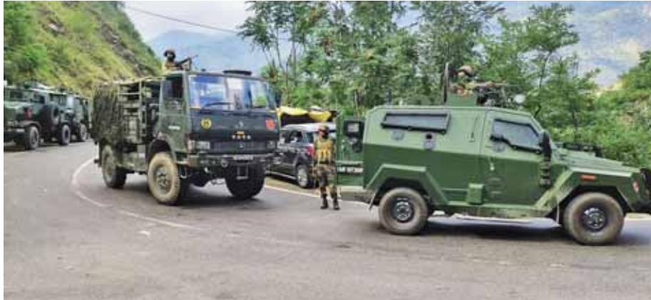
Army personnel keep vigil near the site of an encounter between security forces and terrorists, in Doda district of Jammu and Kashmir, on Wednesday