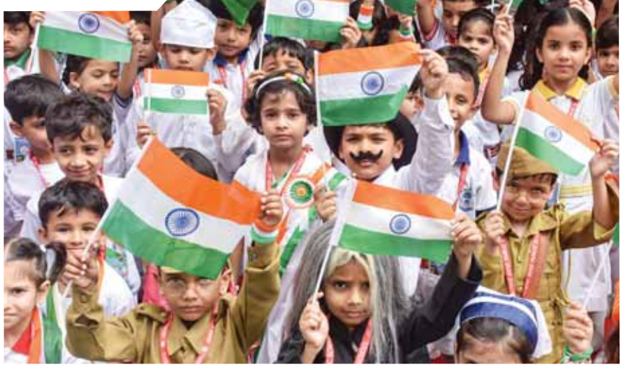
Young students participate in a programme on the eve of Independence Day at a school, in Moradabad, PTI