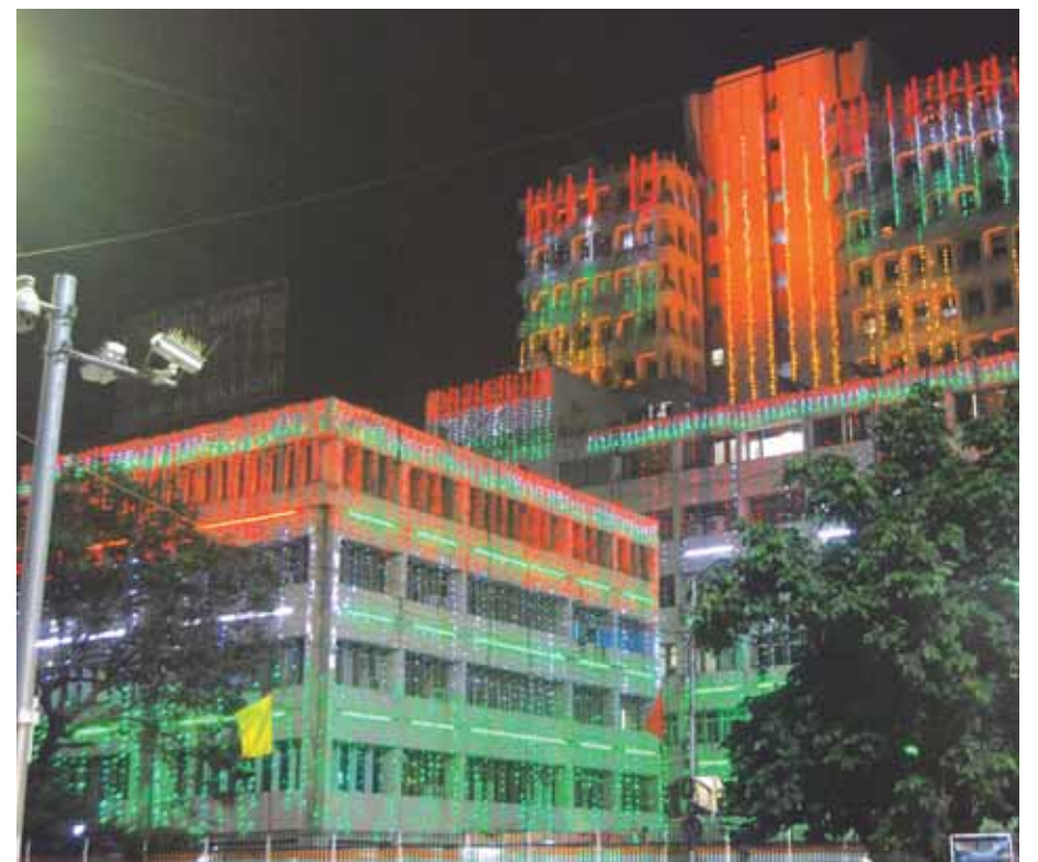
Illuminated buildings in Lucknow on the eve of Independence Day