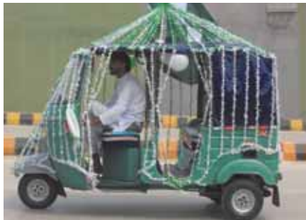
A driver decorates his ricksha with national flag colors to celebrate the country's 78th Independence Day from British rule in Peshawar on Wednesday.

Prime Minister Shehbaz Sharif Wednesday announced that he would soon unveil a new five-year plan to bring cash-strapped Pakistan out of the economic crisis and asked countrymen to undertake self-inspection to correct mistakes of the past. Sharif's remarks came as the nation commemorated the 78th Independence Day of Pakistan. The Prime Minister said a "fresh journey with new zeal should be started to steer the country out of existing crises" and a five-year economic programme will soon be launched. He said that there is a need for self-inspection to correct mistakes of the past. The nation would hear good news regarding the reduction in electricity prices in the next few days, Radio Pakistan quoted him as saying at the main ceremony held in Islamabad. Turning to issues being faced by the country, Sharif pledged to work hard till the last drop of his blood to reduce inflation and electricity prices and revamp Pakistan's battered economy. He said the reduction in inflation and electricity bills is vital for the development of agriculture and industry, enhancing exports and providing solace to domestic power consumers. Sharif also urged the youth to focus on their studies, training, and skills and avoid becoming prey to the forces of chaos, anarchy and