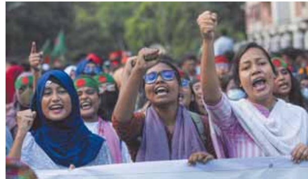
Students shout slogans during a protest demanding the trial of former Prime Minister Sheikh Hasina in Dhaka on Tuesday.