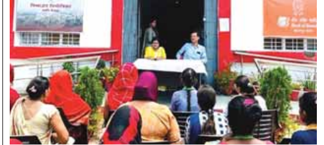
Baroda Swarajgar Vikas Sansthan organised a three-day exhibition at its Mariyami, Chhaubepur, centre on Tuesday