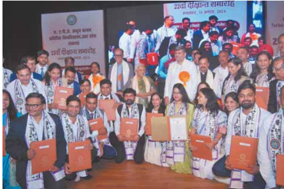
Governor Anandiben Patel and others with the students who were awarded degrees and medals at the 22nd convocation of AKTU in Lucknow on Tuesday

She urged AKTU to contribute significantly to AI and machine learning, fields that have immense potential but are still in their early stages in India. "Artificial intelligence, cloud computing, and robotics offer vast possibilities. AI has advanced globally but remains in its nascent phase in India. The Indian AI Mission, launched in March 2024, aims to build a robust AI ecosystem in the country," Patel explained. She also pointed out that cybersecurity and robotics are areas needing significant development. The Indian government has allocated Rs 1,550 crore in the Union budget to bolster AI and cybersecurity, reflecting the critical need for progress in