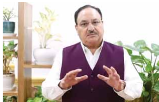
Union Health Minister JP Nadda speaks on the RG Medical College rape and murder incident, in New Delhi, on Tuesday

on or around the hospital campus stating it was in violation of High Court directions and amounts to contempt of court. The administration issued an office memorandum drawing the attention of all resident doctors to the "Code of Conduct" as laid down by the High Court. It further stated that the violation of the High Court orders by the individual/students/employees/group of employees, students/Resident Doctors/Associations/Unions etc will be in contravention of the directions of High Court and make them liable for disciplinary actions and also for contempt of court. Continued on Page 8