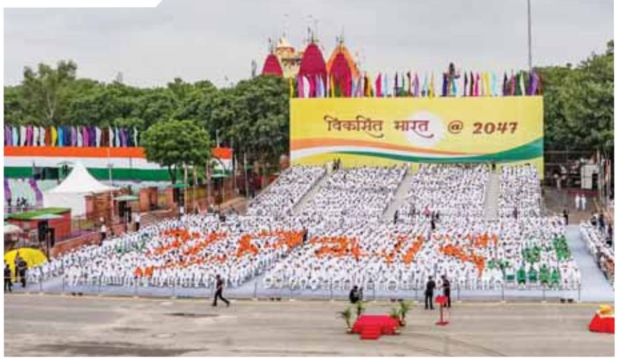
NCC cadets during full dress rehearsal for the 78th Independence Day celebrations at Red Fort, in New Delhi