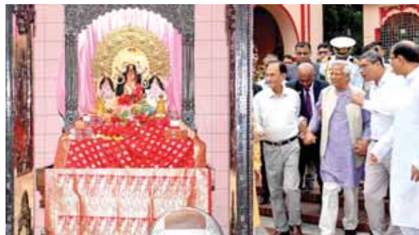
Bangladesh's Chief Adviser Muhammad Yunus with Hindu community members at the famous Dhakeshwari Temple in Dhaka, on Tuesday

Reaching out to the distressed Hindu community members at the famous Dhakeshwari Temple here, Bangladesh's Chief Adviser Muhammad Yunus on Tuesday urged the people to "exercise patience" before judging his Government's role. Yunus, who took charge as the Chief Advisor of the interim Government on August 8 amid ongoing violence and vandalism, including against the minorities, also said each one's rights should be ensured and blamed "institutional decay" for the predicament that his country