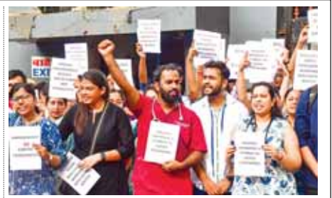
Doctors and medical students protest against the sexual assault and killing of a Kolkata based post-graduate trainee doctor, at Nair Hospital in Mumbai, on Tuesday