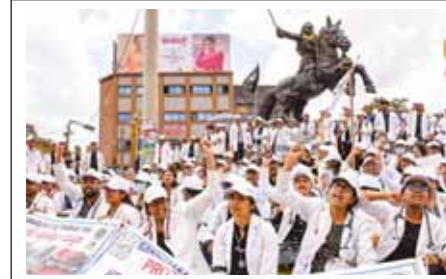
Junior doctors take part in protest at the Rani Chennamma Circle against the rape and murder of a trainee doctor in Kolkata, in Hubballi, on Tuesday