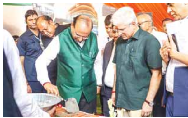
Delhi LG VK Saxena with Transport Minister Kailash Gahlot during foundation stone laying of multi-level electric bus depot, in New Delhi, on Tuesday

Uncertainty over who will hoist the national flag in the absence of Chief Minister Arvind Kejriwal, ended on Tuesday after Lieutenant Governor Vinai Kumar Saxena nominated Delhi Home Minister Kailash Gahlot to hoist the national flag at State Government function on Independence Day at Chhatrasaal Stadium. A controversy erupted with the jailed Chief Minister Arvind Kejriwal directing Cabinet member Atishi to do the same. "Lieutenant Governor is pleased to nominate Minister (Home), GNCTD,