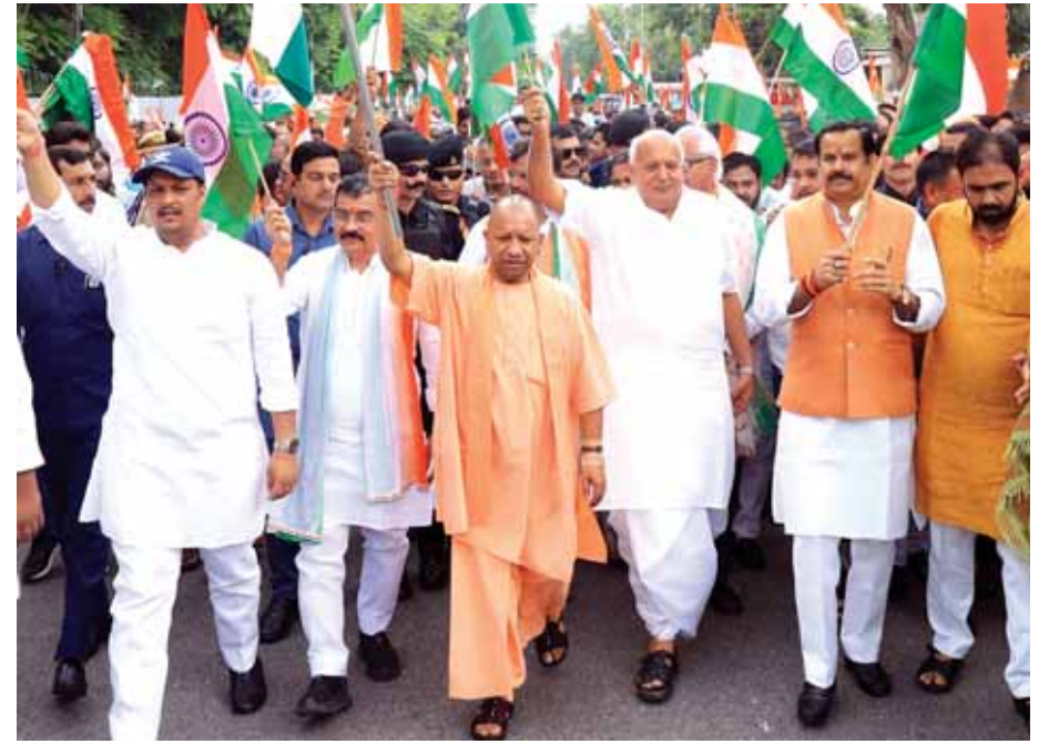
Chief Minister Yogi Adityanath at his official residence in Lucknow on Tuesday on the occasion of 'Tiranga Yatra Bike Rally'

"Two years ago, during the Amrit Mahotsav celebrating India's Independence, we had taken the 'Panch Pran'. In the Amrit Mahotsav year, through the 'Har Ghar Tiranga' campaign, we proudly displayed the tricolour, a symbol of India's pride and glory, in every home," Yogi said. He highlighted that in 2022-23, Uttar Pradesh made history by hoisting the tricolour at more than five