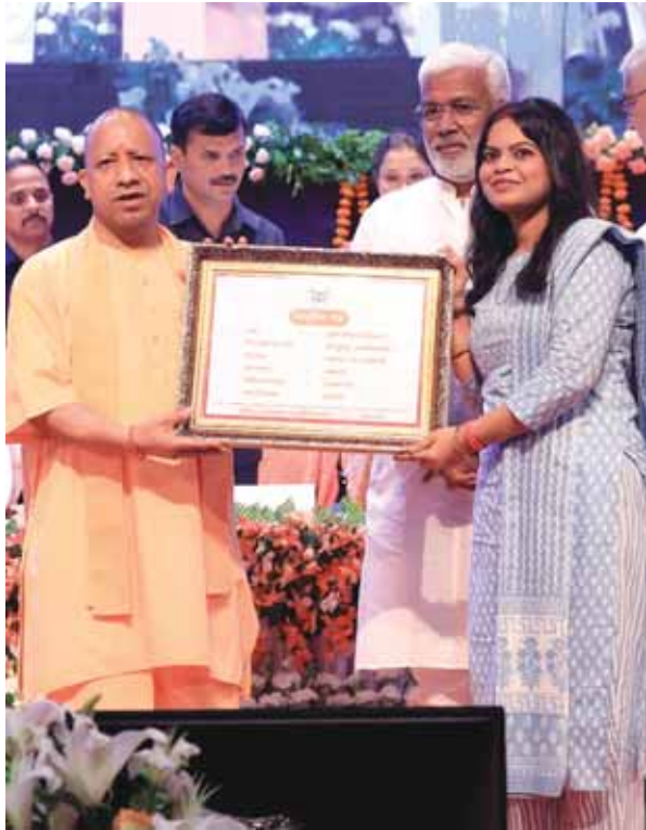
Uttar Pradesh Chief Minister Yogi Adityanath handing over appointment letter to a newly-selected candidate at Lok Bhavan in Lucknow on Tuesday

Highlighting the differences in recruitment statistics between previous and current administrations, the CM noted that between 2012 and 2017, the Uttar Pradesh Public Service Selection Commission completed appointments to 26,394 posts, with 13,469 positions filled by general candidates, 6,966 by OBC candidates, 5,634 by SC candidates,