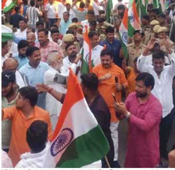
UP Minister Ravindra Jaiswal leading the 'Har Ghar Tiranga' procession before hoisting 100-feet-high national flag at Ashapur in Varanasi on Tuesday.

Uttar Pradesh Minister of State (Independent Charge) for Stamp and Court Fee, Registration Ravindra Jaiswal inaugurated the National Flag Sthal, a symbol of the pride of the country at Ashapur crossing and hoisted the 100-feet-high national flag here on Tuesday. On the occasion the tune of patriotic songs was played by the personnel of the Army, PAC, NDRF and Police Band Party. A large number of people carried the huge national flag in their hands with respect in the procession due to which the entire atmosphere was filled with the message of the freedom struggle. On the occasion, District Magistrate S Rajalingam, Additional Commissioner of Police S Chinnappa, NDRF officials etc were prominently present. Speaking on the occasion, the Minister said that on Wednesday, a 100-feet-high national flag will be hoisted near the Traffic Police Lines and on the occasion of Independence Day on August 15 near Kachhari Ambedkar Park and Sampurnanand Sanskrit University. Apart from this, 100-feet-high national flags will be installed at Maldahiya and Lahurabir crossings, near Swami Vivekananda's statue in Cantonment, Uday Pratap College etc. For this, he has also approved about Rs 34 lakh from his MLA fund. According to him, local digni-