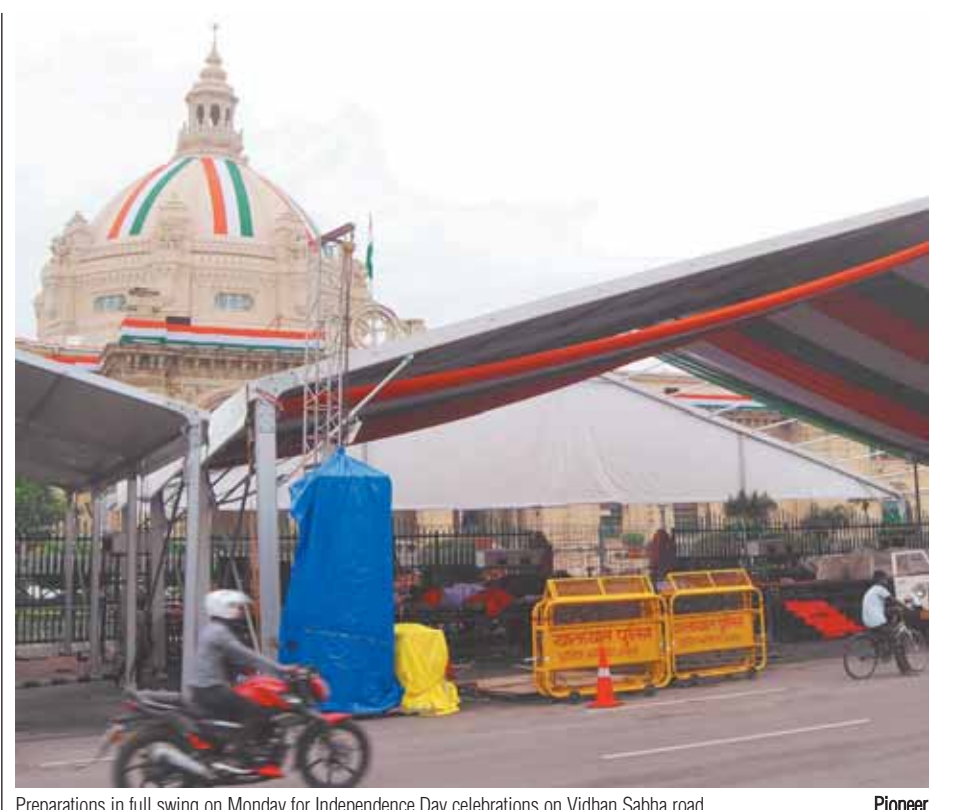
Preparations in full swing on Monday for Independence Day celebrations on Vidhan Sabha road