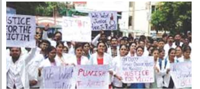
A group of people protesting, holding signs.