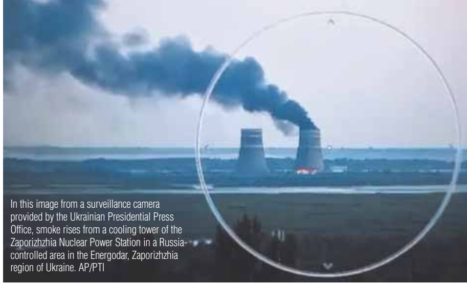
In this image from a surveillance camera provided by the Ukrainian Presidential Press Office, smoke rises from a cooling tower of the Zaporizhzhia Nuclear Power Station in a Russia-controlled area in the Enerhodar, Zaporizhzhia region of Ukraine.