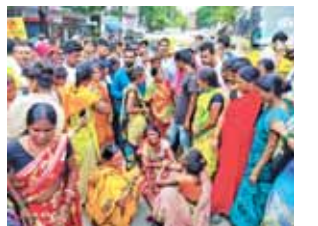
Family members of the victims mourn after a stampede at Baba Siddhanath temple, in Jehanabad district, Monday morning, Aug. 12, 2024. At least seven people were killed and 16 others suffered injuries in the stampede

initiative opens new avenues for experiencing the natural beauty of Sikkim and ensures accessibility to breathtaking locations regardless of adverse weather conditions or natural calamities. Users can virtually trek through the dense forests of the track, encountering zig zag trails in a realistic setting. An official from the Union Tourism Ministry praised the State's initiative stating the project aims to contribute to the long-term growth and sustainability of the tourism sector in the region. Continued on Page 8