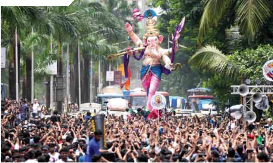
Devotees carry a Lord Ganesh idol for the Ganesh Chaturthi festival, in Mumbai