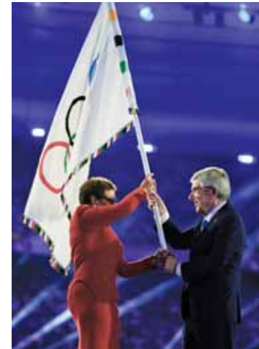
IOC President Thomas Bach hands the Olympic flag to Los Angeles Mayor Karen Bass during the 2024 Summer Olympics closing ceremony at the Stade de France