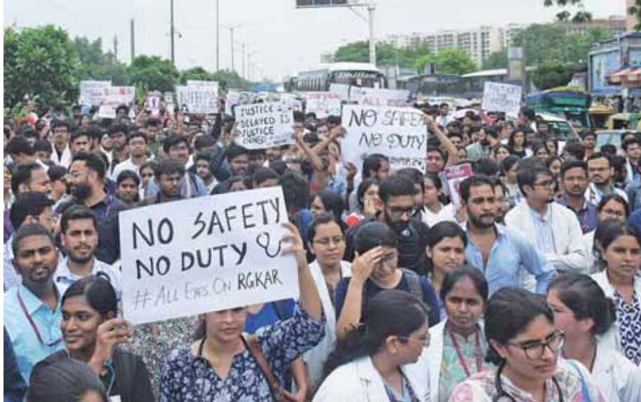
Doctors protest against the sexual assault and killing of a postgraduate trainee doctor in Kolkata, in New Delhi, on Monday

The nationwide indefinite strike is being led by the Federation of Resident Doctors' Associations (FORDA) with the Delhi Medical Association (DMA) also coming out in support of the doctors on strike. The brutal nature of the crime has intensified calls for justice and has led to the nationwide strike as a mean of expressing solidarity with the victim and demanding systemic changes to ensure the safety of healthcare