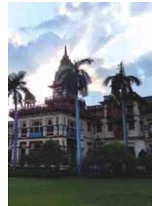
A building of Banaras Hindu University.