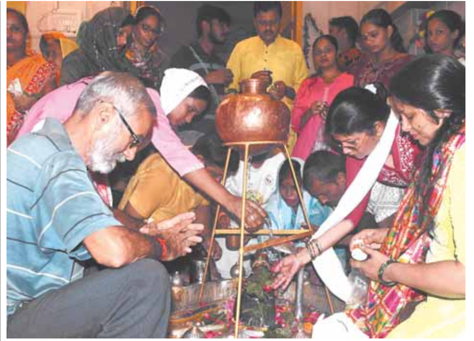
Devotees offering prayers at Koneshwar temple in Lucknow on the fourth Monday of Shravan

Hamirpur district in the project's benefits and instructed officials to expedite dam desilting. He also emphasised the need for a rubber dam near the Taj in Agra. Noting the increased silt and current state of the Saryu river in Ayodhya, he proposed construction of a dam to mitigate future risks and recommended consulting the Indian Institute of Technology for expertise. He directed the officials to channel the Terai rivers and ensure coordinated efforts for river desilting.