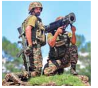
Indian soldiers patrol near the LoC ahead of Independence Day, in Rajouri district, on Monday