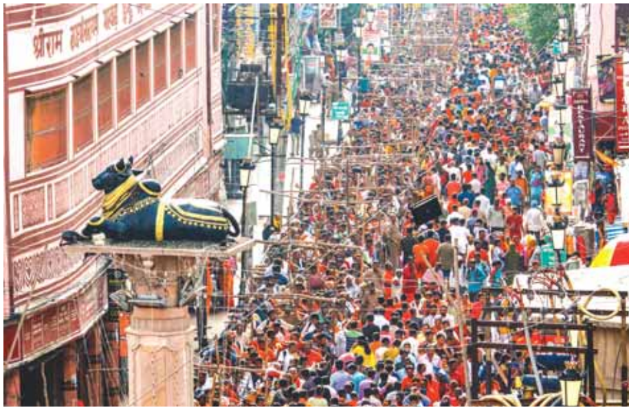
Devotees gather near the Kashi Vishwanath Temple on the fourth Monday of Shravan month in Varanasi.

In view of the heavy rush of devotees, elaborate security arrangements were made and no vehicles were allowed to move between Godowlia and Maidagin throughout the day. To maintain law and order, the devotees were checked at many places through metal detectors. Senior administrative and police officers were present there to keep a watch on the stock of situation in the KVC premises. All the activities were also watched through various CCTV cameras. To avoid congregation the devotees were