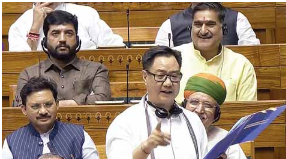
Union Minister Kiren Rijiju speaks in the Lok Sabha during the Monsoon Session of Parliament, in New Delhi, on Thursday.