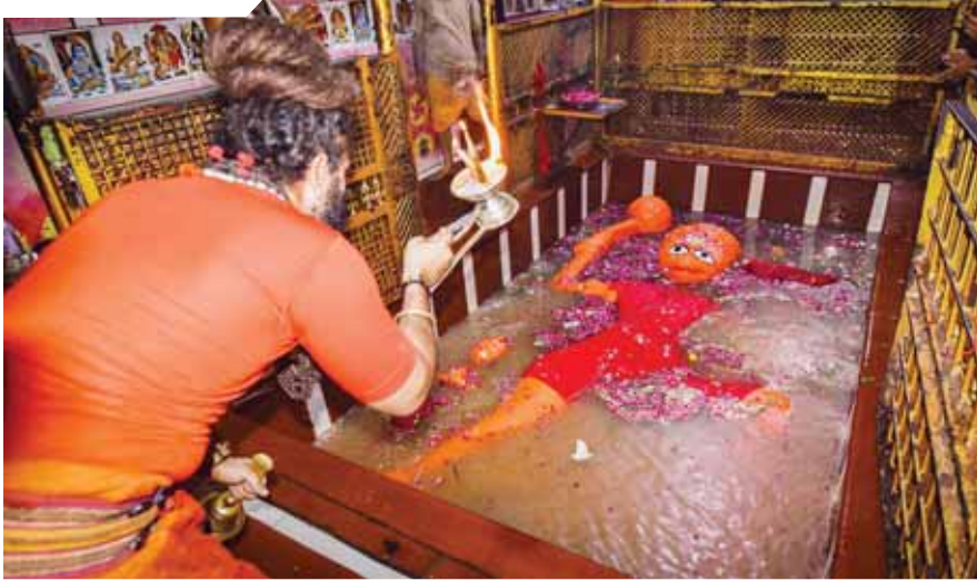
A priest performs 'aarti' at Bade Hanumanji temple which was flooded after heavy rains in Prayagraj