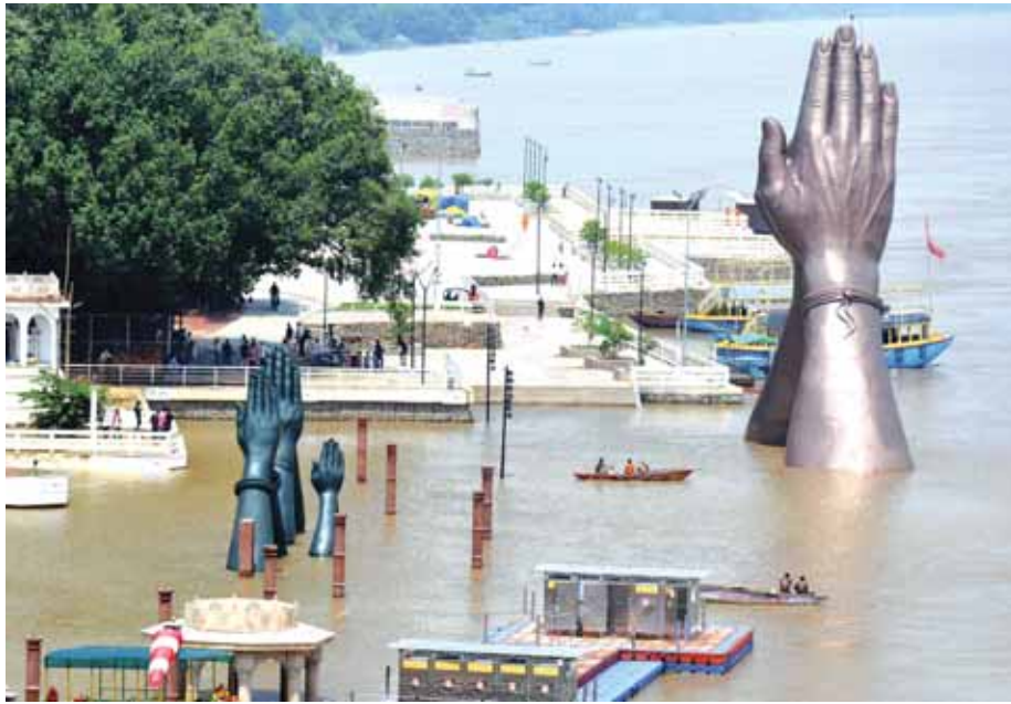
Namu Ghat gets submerged following rains in Varanasi on Thursday.

The continuous rise in water level of Ganga river has increased the worries of thousands of residents living in dozens of colonies in low-lying areas on both sides of Varuna river in the northern part of the city apart from many localities close to Samne Ghat in the southern part as on Thursday, the Ganga crossed 69 metres mark and it is expected that anytime the Varuna will start reverse flowing, allowing huge amount of Ganga water to reach there. The Varuna merges into the Ganga near Sarai Mohana village which is very close to the newly-built Namu Ghat (Khirkhiya Ghat), one of the dream projects of Prime Minister Narendra Modi.