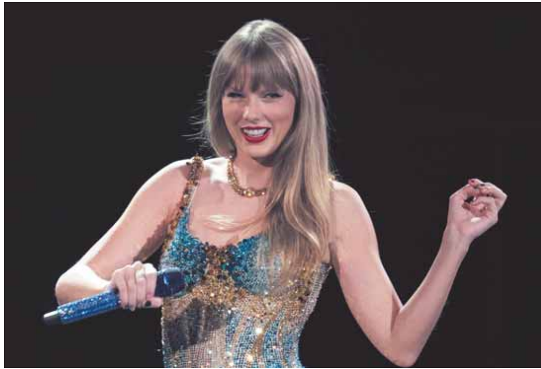
Thursday, Friday and Saturday at the Ernst Happel Stadium, which sat empty Thursday morning aside from media filming outside.