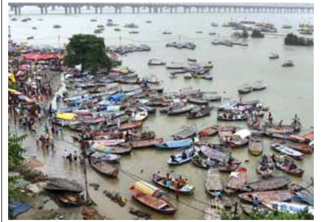
The flooded banks of Ganga river following rains in Prayagraj on Thursday