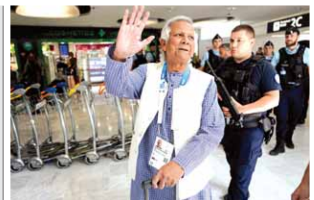
Nobel laureate Muhammad Yunus returns to Bangladesh from Paris to take charge of interim Government.