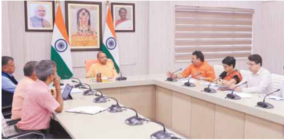
Chief Minister Yogi Adityanath at meeting in Lucknow on Tuesday.

In a meeting on Tuesday, the chief minister stated, "High expenses often lead to disputes and court cases during family property divisions. By implementing minimal stamp duty, settlements among family members will become much easier." Emphasising that the state government, under the guidance of the Prime Minister, has undertaken numerous efforts to improve the ease of