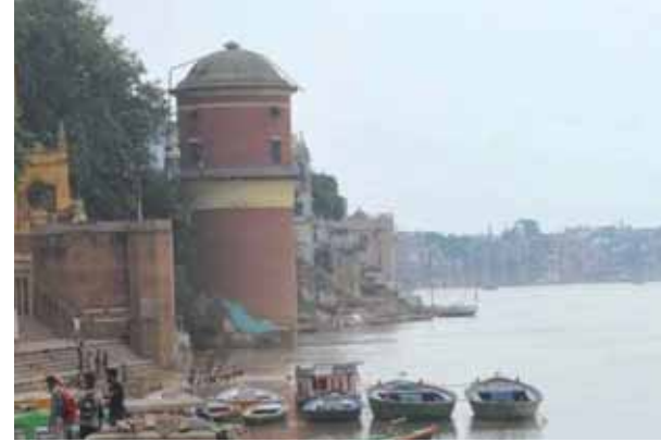
The water level of Ganga continued to rise in Varanasi on Tuesday.

Rain with high intensity paralysed normal life for hours late on Tuesday afternoon, causing the water level of Ganga river to rise further in this holy city. The water level of the river here is rising by four cm per hour but may increase further as it was recorded rising at 12 and four cm per hour at upstream Prayagraj and Mirzapur respectively at 8 am on Tuesday as per the report of Middle Ganga Division-III of Central Water Commission (CWC). During 24 hours the water level has increased by 1.12 metres, rising to 66.46 metres from 65.34 metres a day ago. It continued rising right from Prayagraj to Ballia, including Mirzapur, Varanasi and Ghazipur. Though it was steady