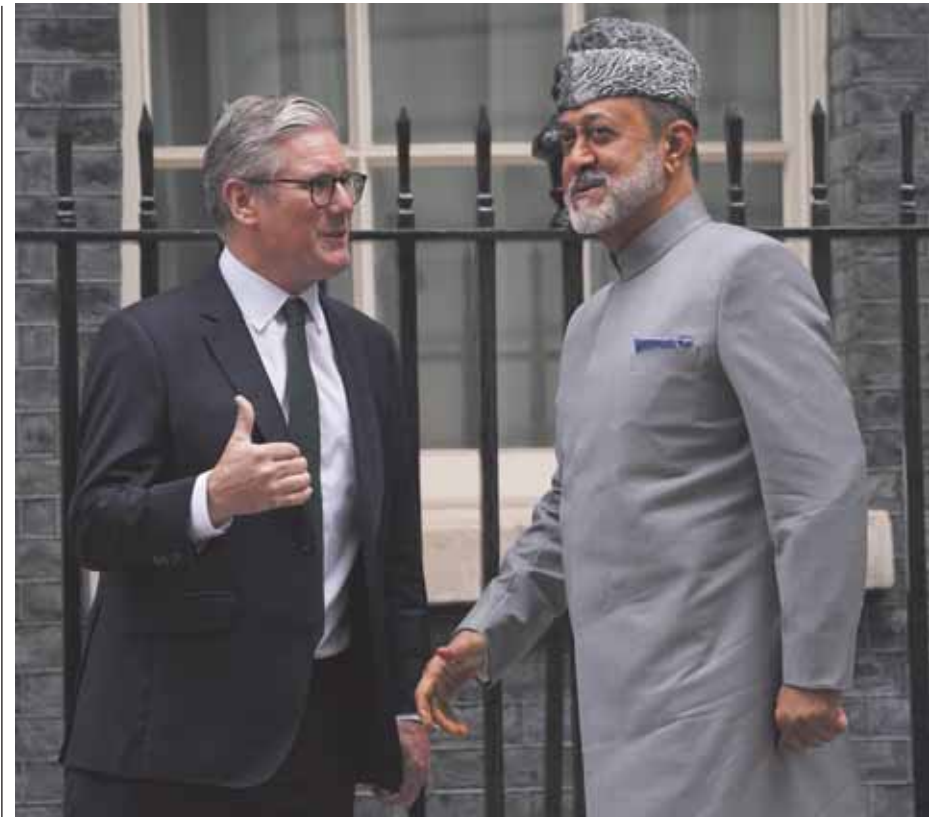
Britain's Prime Minister Keir Starmer welcomes Sultan Haitham bin Tariq Al Said, the Sultan of Oman to 10 Downing Street in London on Tuesday.

The United States on Tuesday recommended its citizens not to travel to Bangladesh, witnessing civil unrest, crime, and terrorism following the resignation and fleeing of former prime minister Sheikh Hasina . Elevating its travel advisory to the highest 'Level 4: Do Not Travel' category, the US State Department has also recommended the departure of non-emergency US government employees and family members. Over 100 people have been killed in the violence across Bangladesh as chaos reigned supreme hours after Hasina resigned as prime minister and fled the country on Monday, amid signs of a return to normalcy. "On August 5, 2024, the Department ordered the departure of non-emergency US government employees and family members. Travellers should not travel to Bangladesh due to ongoing civil unrest in Dhaka," the State Department said in its advisory.