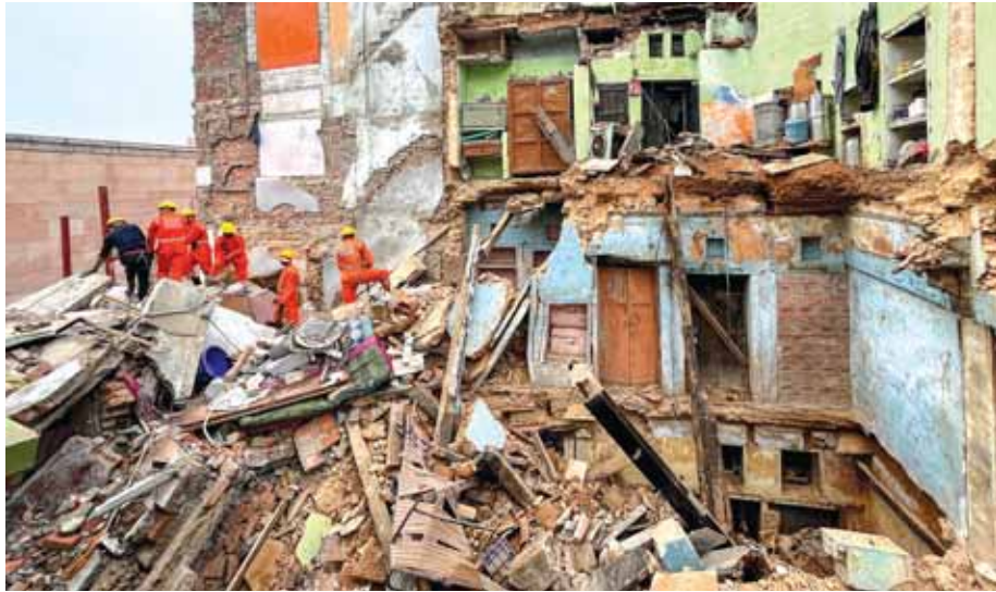
NDRF personnel carry out rescue work after two houses collapsed near the Kashi Vishwanath Temple in Varanasi on Tuesday. A woman died in the mishap.