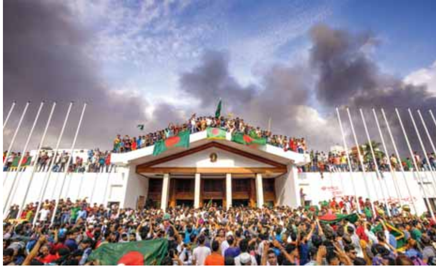
External Affairs Minister S Jaishankar speaks in the Lok Sabha on Tuesday (l); people gather around the residence of Bangladeshi Prime Minister in Dhaka, Bangladesh