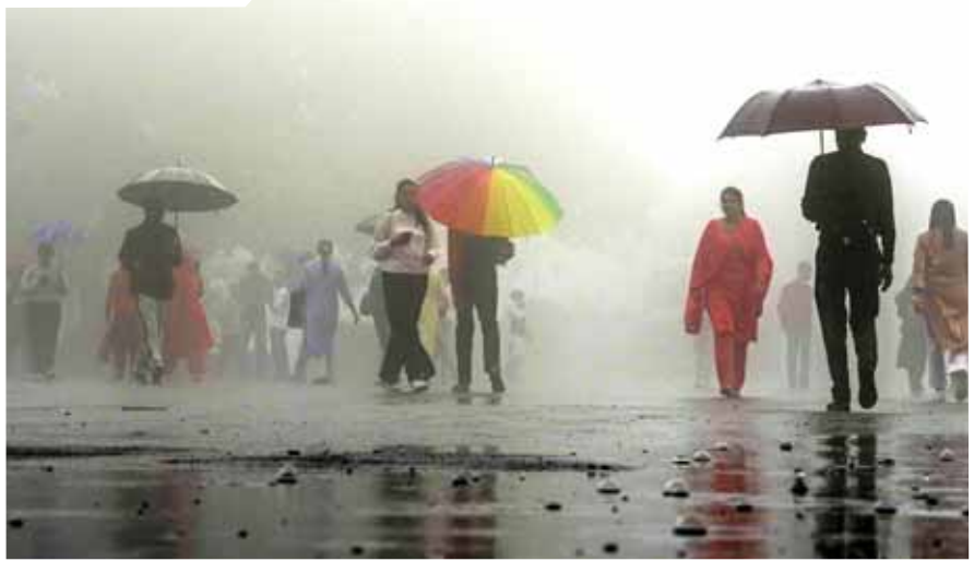
People walk to their work as torrential rains lash Shimla