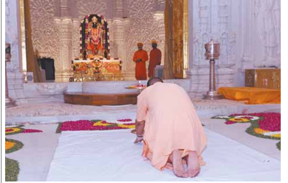
Chief Minister Yogi Adityanath offers prayers at the Shri Ram Janmabhoomi Temple in Ayodhya on Tuesday

Earlier, the chief minister was accorded a warm reception by the mayor, public representatives, BJP leaders and local officials. This visit follows an earlier trip to Ayodhya during the Lok Sabha elections, where the chief minister visited Shri Ram and Sankatmochan Hanuman temples.