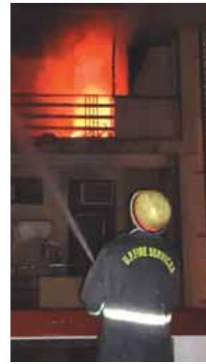
A flat in Ratanlal Nagar caught fire on Friday early morning