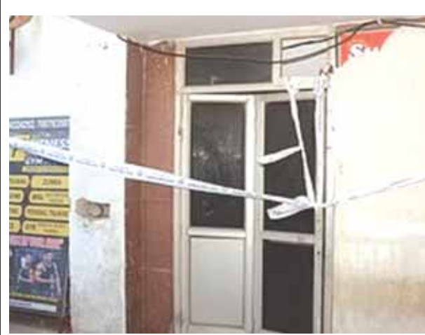
KDA seals illegally run establishment in basement in Arya Nagar.