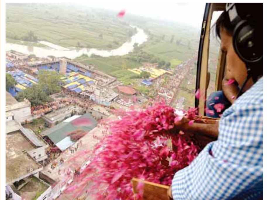
A helicopter showers flower petals on 'Kanwariyas', at Pura Mahadev Temple in Baghat