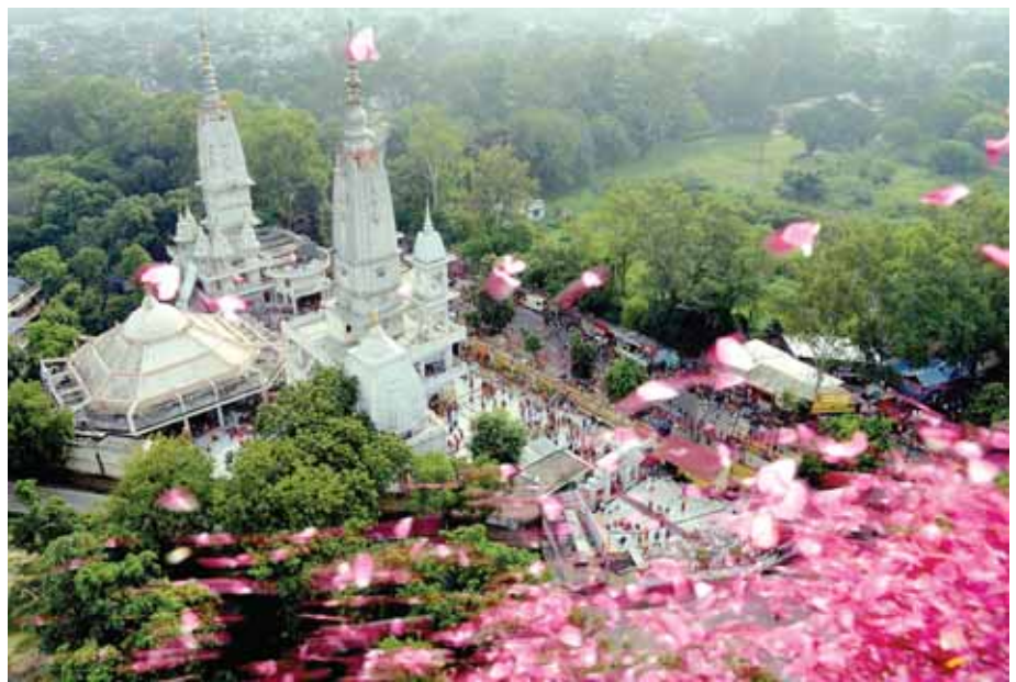
Flower petals being showered from a helicopter on Kanwariyas at Augharnath Temple in Meerut.