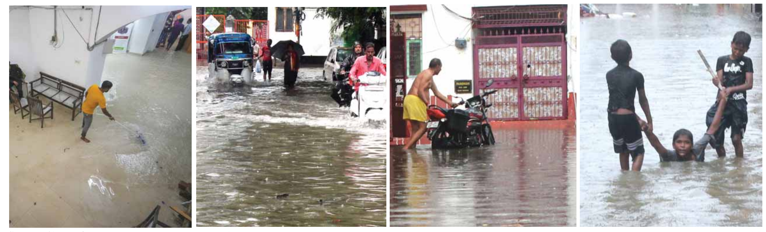
(From Left to right) A UP Vidhan Sabha staffer clears rainwater from the flooded premises of the UP Assembly and waterlogged areas after downpour in Lucknow on Wednesday