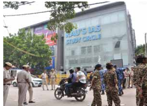
Police personnel guard IAS coaching institute in Old Rajinder Nagar, where three students died due to drowning, in New Delhi on Wednesday

"You are permitting multistorey buildings but there is no proper drain. Your civic authorities are bankrupt. If you don't have money to pay salaries, how will you upgrade infrastructure? You want freebie culture. You're not collecting any money, so you're not spending any money," the ACJ orally