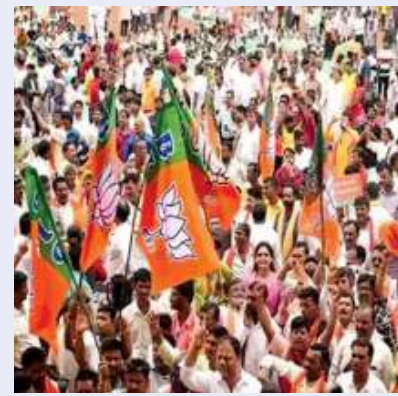
Haryana BJP's State Election Management Committee has logically put forward the view that there is a weekend holiday before the assembly election date on October 1 and there are some holidays after that. INLD has also agreed to postpone the assembly elections. Opposition parties are hell-bent on condemning every aspect of the ruling party. Chief Election Commissioner Rajiv Kumar has expressed concern over low voting percentage where people use long weekend holidays on the day of polling. Shifting the election dates will definitely help in increasing the voting percentage. Earlier also, the dates of elections were changed in Rajasthan, Mizoram and Arunachal Pradesh. Therefore, the change of date is not important but the change of mind of voters will be more meaningful. The election Commission is a statutory independent body and should remain firm on its stand rather than bowing to the political pressure which often times is self serving than for the public good.