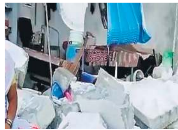
A partly demolished house