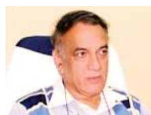
V K BAHUGUNA

The prosperity and progress of a nation hinge on the efficiency of its governance, particularly in upholding the rule of law by those in top constitutional, administrative, and judicial positions. This also involves the transparency and accountability of regulatory regimes across various sectors of law and economy. In our modern era, characterized by freedom, equality, and democracy, many developing countries have emerged from the shadows of colonialism. Despite independence, the remnants of colonialism persist in governance and social structures, and former colonial powers often carry a lingering sense of superiority. This is evident in their interventions in other countries, where they create