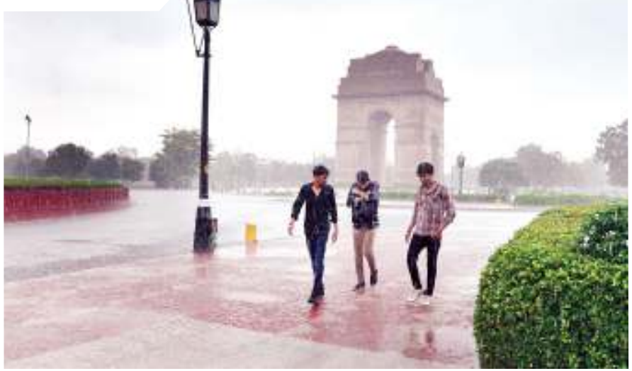
Visitors at India Gate enjoy the rains in New Delhi