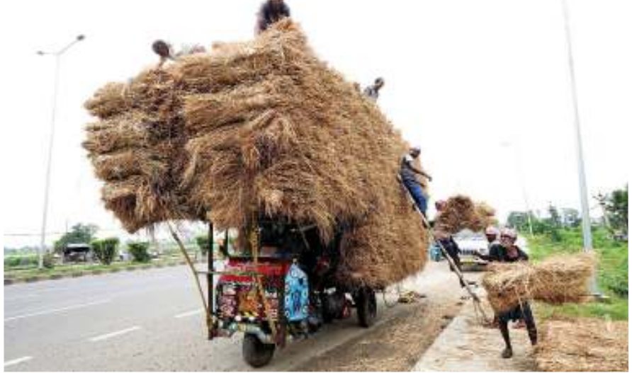
Workers load heaps of straw on an autorickshaw, in Bardhaman