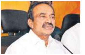
HYDERABAD

The BJP's Malkajgiri MP, Eatala Rajender, said that former Chief Minister K. Chandrasekhar Rao posed for photos after demolishing buildings in Ayyappa Society and now Chief Minister Revanth Reddy is posing for photos in the same manner.