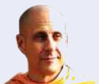
RADHANATH SWAMI MAHARAJ

Understanding and managing stress effectively is essential for a healthier life