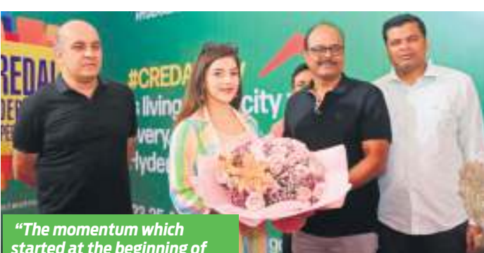
"The momentum which started at the beginning of the month with Chief Minister Revanth Reddy meeting CREDAI members and unveiling his Vision 2050 for the state assured everyone of a great time ahead."