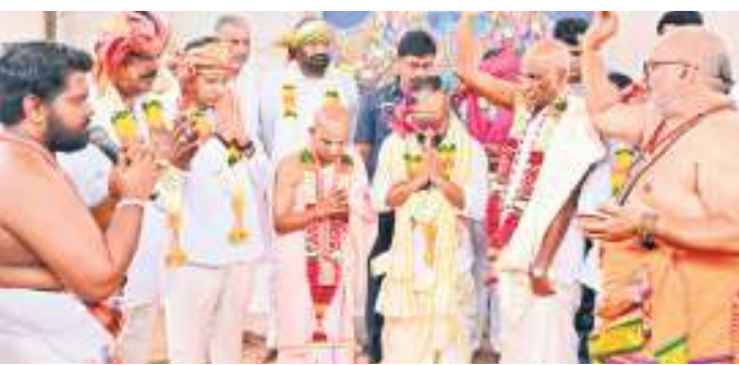
CM Revanth Reddy and IT Minister D Sridhar Babu at foundation stone laying for Hare Krishna Heritage Tower in Hyderabad on Sunday

Chief Minister Revanth Reddy said the Congress government will fight against the encroachment of lakes inspired by Lord Krishna's message to Arjuna delivered during the Kurukshetra battle. This is not a political programme, the CM clarified.