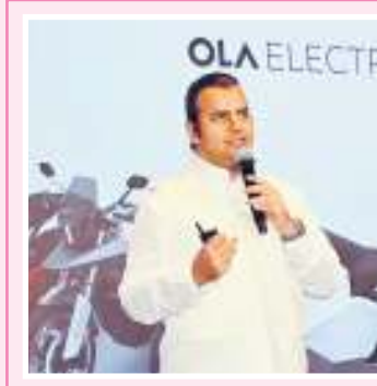
5,500 crore from its initial public offering...