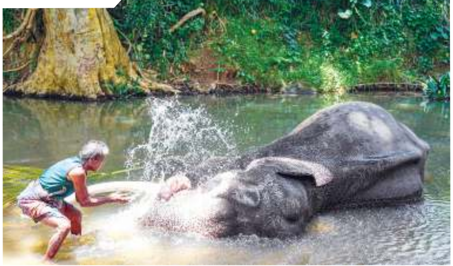
A mahout bathes an elephant at Elephanti Orphanage in Pinnawala