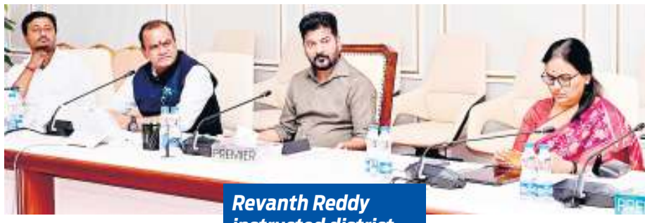
Revanth Reddy instructed district collectors representing areas covered by the RRR to report daily to the Chief Secretary on land acquisition progress and other related issues.