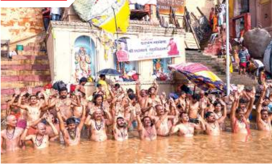
People perform Shrivani Purnima rituals while taking bath in the Ganga river, in Varanasi