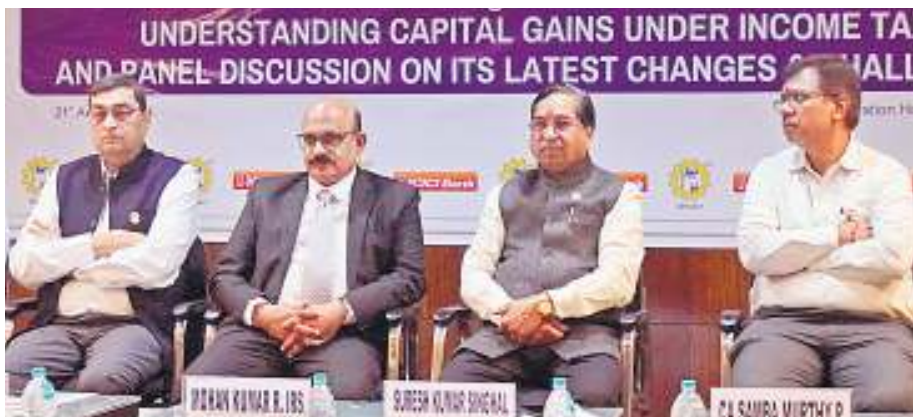
FTCCI members seen in a panel discussion at FTCCI headquarters in Hyderabad on Wednesday