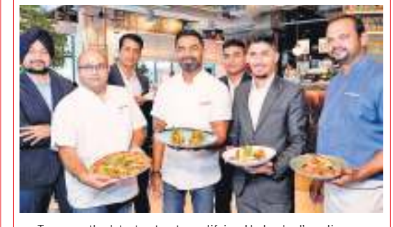
Toscano, the latest entrant amplifying Hyderabad's culinary fanfare, will enhance your tastebuds with Italian flavours. Known for its award-winning legacy, the restaurant is right on track to grow across major cities nationwide.