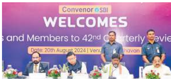
Deputy CM Bhatti Vikramarka Mallu and Minister Tummala Nageswara Rao at the State Level Bankers' Committee meeting in Hyderabad on Tuesday

Tummala Nageswara Rao, Minister for Agriculture, emphasised the need to focus more on exceeding the stipu-