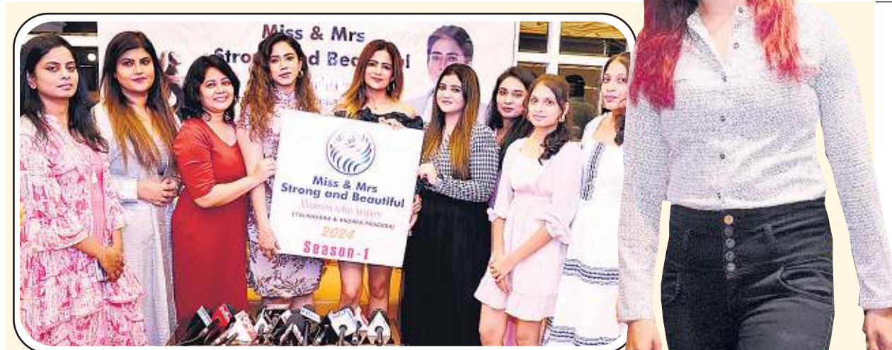
The beauty pageant, Miss and Mrs Strong and Beautiful 2024 - Season 1 , is all set to begin in October. The auditions for the pageant, which is open to participants from Telangana and Andhra Pradesh, will take place in October.