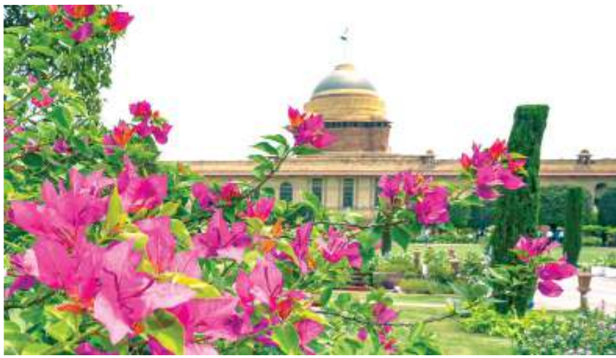
Flowers in full bloom in Amrit Udyan at Rashtrapati Bhawan, New Delhi