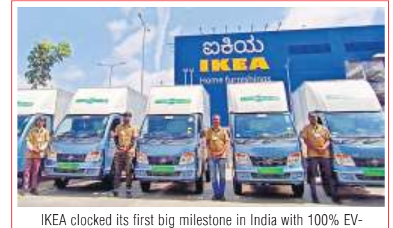
IKEA clocked its first big milestone in India with 100% EV-powered deliveries across Bangalore, Hyderabad and Pune. Its Mumbai operations will soon join this wagon and the company will enter all new markets with an EV-first approach. IKEA is also piloting same day delivery in its birth city of Hyderabad!