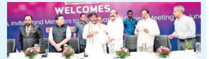
DCM Bhatti Vikramarka and Agriculture Minister Tummala Nageshwara Rao participated in SLBC meeting on Tuesday at Praja Bhavan

Bankers should function with more concern for the public and not confine themselves to statistics, Deputy Chief Minister Bhatti Vikramarka Mallu said. Although the government has released Rs 18,000 crore to banks for waiving the loans taken by farmers so far only Rs 7,500 crore has been released to farmers, he said. Even a one-week delay in loan