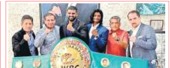
The World Boxing Council (WBC) has officially endorsed the Indian Professional Boxing League (IPBL) and 12R's Fantasy Boxing App. The WBC's backing of the IPBL and 12R's Fantasy Boxing App is a significant step towards strengthening the professional boxing ecosystem in India. The league aims to offer a genuine pathway for Indian boxers to excel on the global stage, while the Fantasy Boxing App seeks to enhance fan engagement through a sophisticated digital platform.