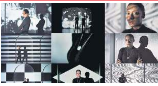
NP Digital India has unveiled its latest campaign for ResQ Jewelry, "#ReclaimTheMidnight," in celebration of Independence Day. This campaign addresses the ongoing issue of women's safety and lack of independence with a compelling narrative and impactful visuals.