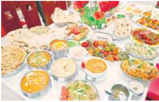
Food safety officials conduct inspections in Hoy Punjab at Gachibowli on Sunday

A few food articles stored in the refrigerator were not covered and not labelled. In all, 5 kgs of packaged chicken was found to be stored beyond best before dates.