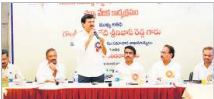
Revenue Minister Ponguleti Srinivas Reddy participating in a discussion conducted on new ROR Act on Monday.