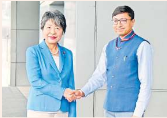
FM Kamikawa Yoko of Japan arrives in New Delhi for India-Japan 2+2 Foreign & Defence Ministers' meeting