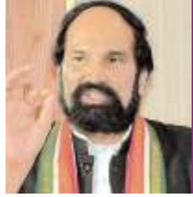
Uttam emphasised the need to adopt the EPC (Engineering, Procurement and Construction) method to ensure the timely completion of desilting.

He also suggested inviting international contractors through global tenders to