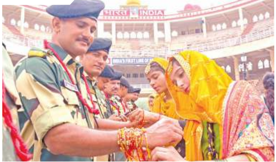
Women tie 'rakhi' on wrists of BSF personnel on the occasion of Rakshabandhan at Attari-Wagah Border, Amritsar