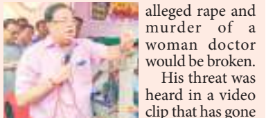
alleged rape and murder of a woman doctor would be broken. His threat was heard in a video clip that has gone viral. how