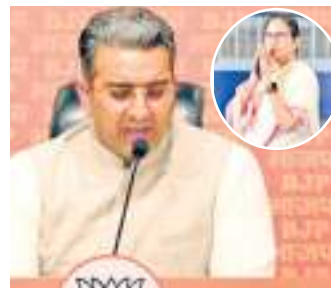
BJP headquarters here.

"Mamata Banerjee has become Mamata, the destroyer. By her misdeeds she destroyed the dignity of a woman, a doctor who was serving the society. Mamata Banerjee is the destroyer of the rule of law and the Constitution," BJP national spokesperson Gaurav Bhatia said at a press conference at the