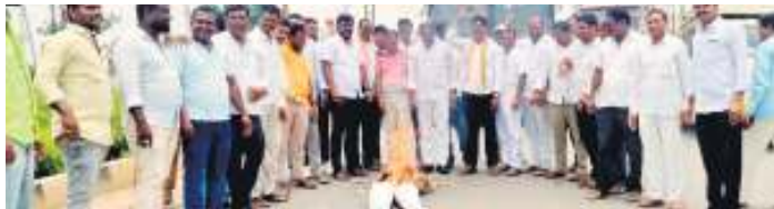
Congress leaders and activists burning BRS working president KR Rama Rao's effigy at Nandigam in Rangareddy district on Friday

The effigy burning was a reaction to comments made by KTR at a recent event at Navbharat. The Congress leaders described KTR's remarks on women inappropriate and