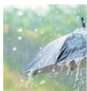
Peddapalli, Mahabubnagar, Nagarkurnool, Wanaparthy, Narayanpet and Jogulamba Gadwal districts. There is also a chance of thunderstorms

IMD has issued a yellow alert until August 18 for heavy rain, which is likely to occur at isolated places in Karimnagar, Rajanna Sircilla, Medak, Kamareddy, Siddipet, Jayashankar-Bhupalpally, Mulugu, Adilabad, Komaram Bheem Asifabad, Mancherial, Nirmal, Nizamabad, Jagital,