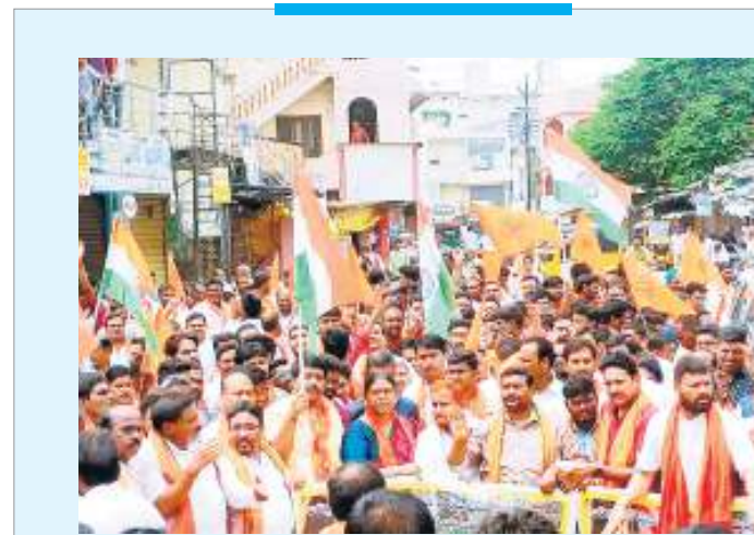
Hindu organisations taking out a procession in Komram Bheem Asifabad district on Friday

Later, he visited the Danavagudem and visited door to door there. He asked the people to follow personal hygiene and maintain hygienic surroundings. He wanted the people to give no scope for breeding of mosquitoes. The local bodies should take steps to prevent seasonal diseases. The collector said that Fridays are being observed as dry days strictly. He suggested arranging special medical camps in slums and implementing special sanitation drives there.