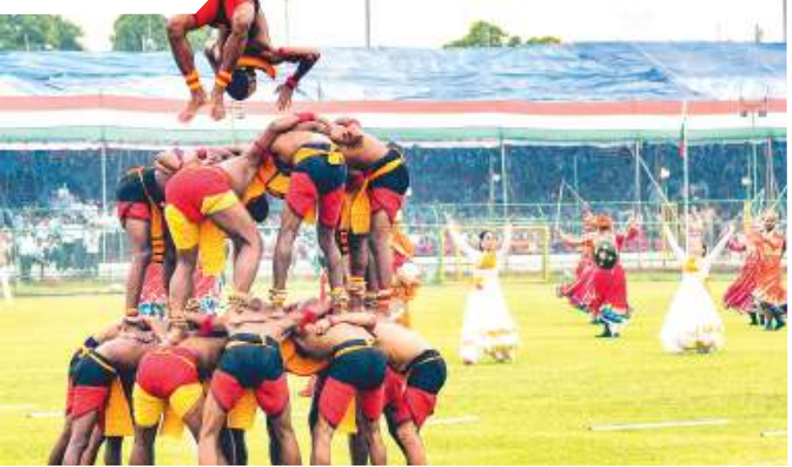
Artists perform at Sawai Mansingh Stadium on Independence Day in Jaipur