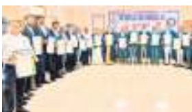
Advocates belonging to Backward Classes assembling at the Bar Association in Hanamkonda

After the caste census done during the British rule, so far the caste-based census did not take place in the country. Rahul Gandhi has been demanding the conduct of caste-based census in parliament but the caste census in