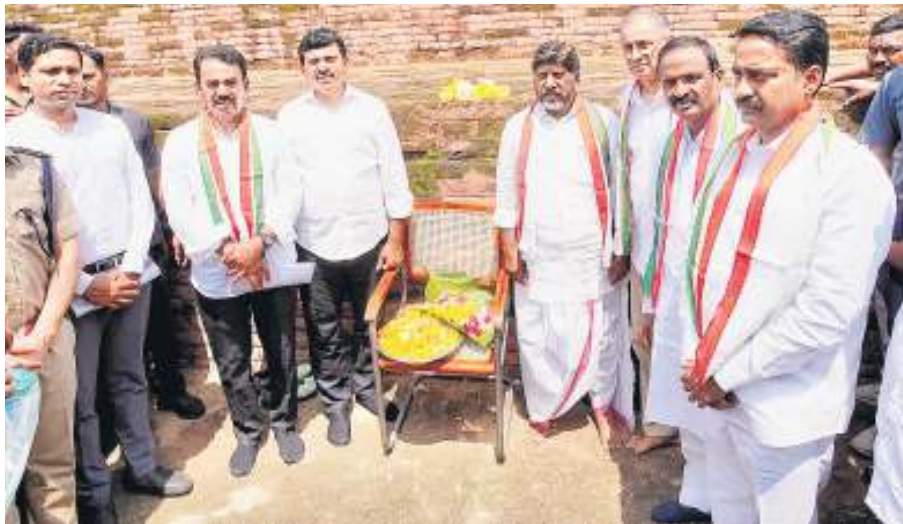
Deputy Chief Minister Bhatti Vikramarka, along with Ministers Jupally Krishna Rao, Ponguleti Srinivasa Reddy and others, visiting a tourist centre in Khammam district on Monday

He also suggested organising Buddhist festivals in Nelakondapalli inviting the Buddhist pracharaks world-