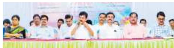
Minister for Revenue Ponguleti Srinivasa Reddy speaking at a meeting in Khammam on Monday

He said that he received many complaints against Panchayat Secretaries, but no action would be taken for now. If they failed to mend their ways, the Minister warned