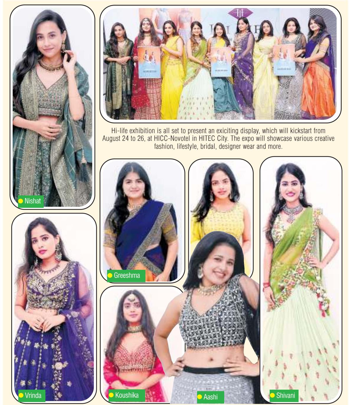
Hi-life exhibition is all set to present an exciting display, which will kickstart from August 24 to 26, at HICC-Novotel inHITEC City. The expo will showcase various creative fashion, lifestyle, bridal, designer wear and more.