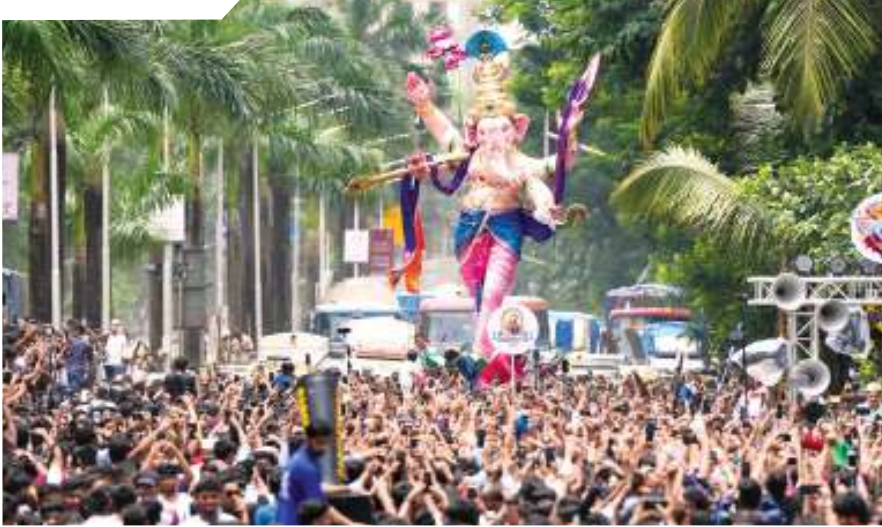
Devotees carry a Lord Ganesha idol for the Ganesh Chaturthi festival, in Mumbai