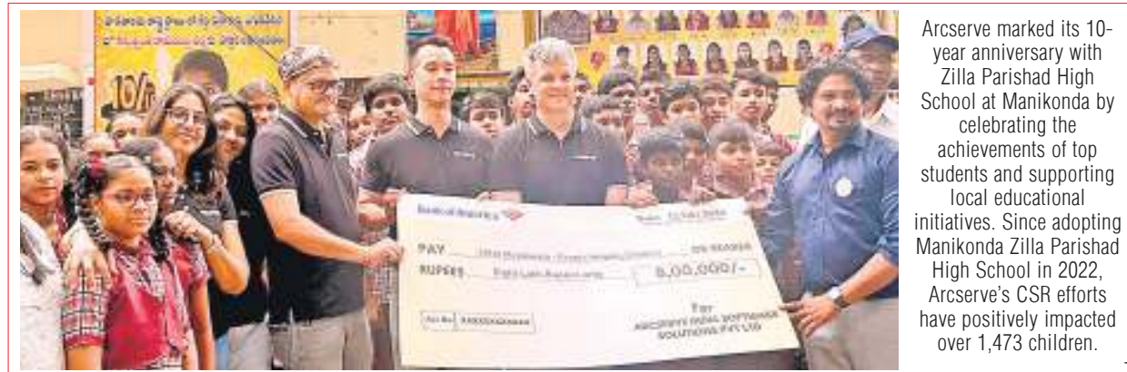
Arcserve marked its 10-year anniversary with Zilla Parishad High School at Manikonda by celebrating the achievements of top students and supporting local educational initiatives. Since adopting Manikonda Zilla Parishad High School in 2022, Arcserve's CSR efforts have positively impacted over 1,473 children.