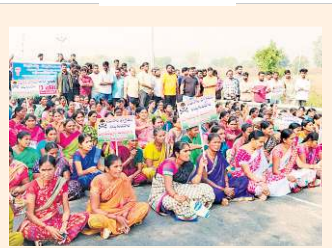
Women staging protest against ethanol factory in Nirmal district