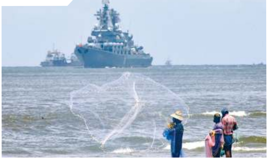
Fishermen cast their nets in the Arabian sea, at the Kochi coast