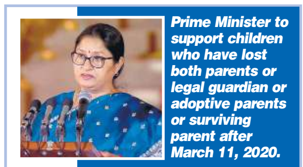
Prime Minister to support children who have lost both parents or legal guardian or adoptive parents or surviving parent after March 11, 2020.