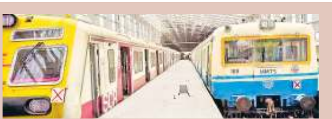
The suburban sections of Hyderabad and Secunderabad divisions of South Central Railway (SCR) network reached a saturation point and need expansion with available sources in the capital city

It will be better for Railways department and Telangana government to conduct a survey and plan to improve rail network to lay additional line in phased manner from Secunderabad to Kacheguda/Lingampally/Cavalry Barracks via Malkajgiri so that there will be no hitch to local trains in city limits and passengers will prefer to travel by it.