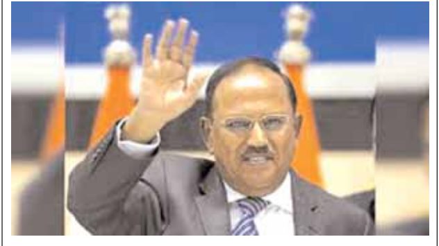
National Security Advisor Ajit Doval (file pic) and the representatives of the Maldives, Mauritius and Sri Lanka signed the Charter and an MoU for the establishment of the Colombo Security Conclave Secretariat

PTI ■ COLOMBO National Security Advisor Ajit Doval and the representatives of the Maldives, Mauritius and Sri Lanka on Friday signed the Charter and an MoU for the establishment of the Colombo Security Conclave Secretariat here to promote regional security by addressing transnational threats and challenges of common concern to the member states. The Colombo Colombo Security Conclave (CSC) brings together National Security Advisors (NSA) and Deputy NSAs from India, Sri Lanka, Maldives and Mauritius. It deals with maritime security, counter-terrorism and cyber security with India bringing to the fore its own strategic concerns in the Indian Ocean and promotes regional security by addressing transnational threats and challenges of common concern to the Member States. "NSA Ajit Doval KC joined reps from Maldives, Mauritius & Sri Lanka in signing the Charter & MoU for the establishment of Colombo Security Conclave (CSC) Secretariat today. A key platform to enhance regional security cooperation, the signing marks a milestone in the CSC roadmap," the Indian High Commission here said in a post on X along with photos from