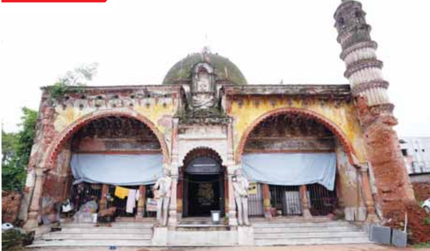
Aukhra Nimbarka Peeth Mahanta Asthal, a 250-year-old Mutt in East Bardhaman