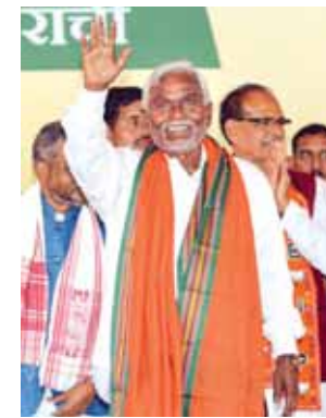
Former Jharkhand chief minister Champai Soren with Union Minister Shivraj Singh Chouhan waves to supporters after joining BJP during a ceremony, in Ranchi, Friday

On a day when Ghatshila OMLA Ramdas Soren replaced him in the Jharkhand Cabinet taking oath as a Minister, former Chief Minister Champai Soren, popularly known as the "Kolhan Tiger", joined the BJP on Friday, marking a significant change in the State's political landscape just ahead of the Assembly elections. Champai along with a large number of his supporters crossed over to the saffron camp in the presence of Union Minister Shivraj Singh Chouhan and Assam Chief Minister Himanta Biswa