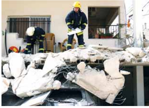
Palestinian civil defense workers clear the rubble from a damaged house following an Israeli military operation in the West Bank refugee camp of Nur Shams, Tulkarem, Friday.

"The convoy, which was coordinated by Anera and approved by Israeli authorities, included an Anera employee who was fortunately unharmed,"