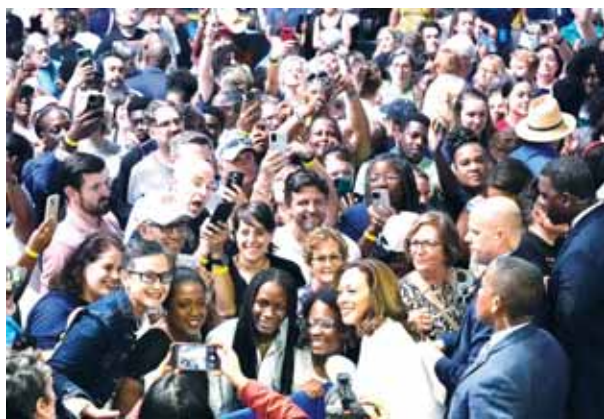
Democratic presidential nominee Vice President Kamala Harris poses for photos at a campaign rally in Savannah on Thursday.

Democratic presidential nominee Kamala Harris has said President Joe Biden called her personally on a Sunday to inform her about his decision to not seek reelection, asserting that he was "very clear" about endorsing her instead. In the first major television interview of her presidential campaign on Thursday, the 59-year-old Vice President said she was with her family when she got the call from Biden, 81. Harris said that she was having bacon with her baby nieces when her phone rang. "And it was Joe Biden. And — and he told me what he had decided to do. And I asked him, 'Are you sure?' And he said, 'Yes.' And that's how I learned about it," she told CNN in a joint interview with her running mate Minnesota