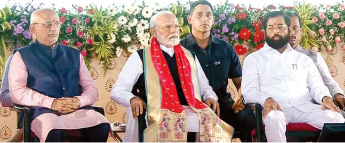
Prime Minister Narendra Modi with Maharashtra Governor CP Radhakrishnan and Chief Minister Eknath Shinde during laying of the foundation stone of Vadhvan Port and launching of development works, in Palghar district, on Friday