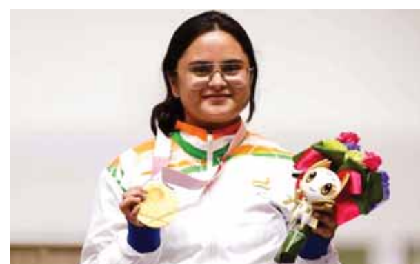
Avani Lekhara

including shot-put, powerlifting and wheelchair volleyball before settling on shooting, notched up 228.7 for the third-place finish. This is the first time in India's Paralympic history that two shooters have pulled off medals in a single event. Avani, who hails from Jaipur, endured a tough buildup to the Paralympics. She grappled with a host of health issues, including a gallbladder surgery, which forced her to take a recovery break of one and half months. But the committed shooter, who is an assistant conservator of forest with the Rajasthan Government, did not let health concerns distract her from her aim of