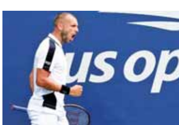
minutes, when Stefan Edberg beat Michael Chang in a five-setter in the 1992 semifinals. "I was hurting all over, really," said the

longest match at the U.S. Open since tiebreakers were introduced in 1970, beating Karen Khachanov 6-7 (6), 7-6 (2), 7-6 (4), 4-6, 6-4 on Tuesday in 5 hours, 35 minutes. Evans trailed 4-0 in the fifth set before running off the final six games. The final point, fittingly, was a marathon 22-shot rally, with Evans on the defensive for much of the point before hitting a hard shot to the corner that set No. 23-seeded Khachanov couldn't get back over the net with his backhand. The previous record was 5 hours, 26