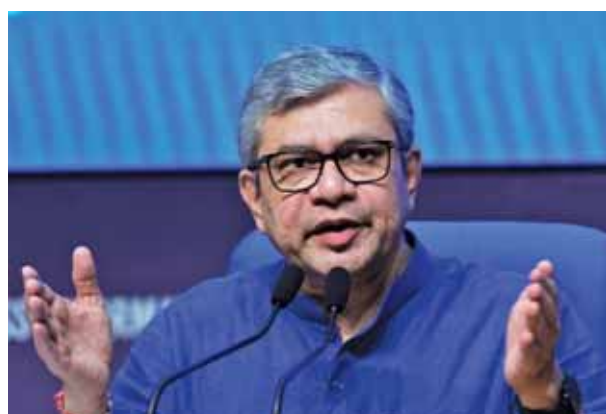
Union Minister Ashwini Vaishnaw briefs the media over Cabinet decisions in New Delhi on Wednesday

In a determined effort to boost domestic industry and create jobs, the Union Cabinet on Wednesday approved establishment of 12 new industrial cities in 10 States with an estimated investment of ₹28,602 crore. More than one million direct jobs will be created in these projects. Spanning 10 States and strategically located along six major corridors, these projects represent a significant leap forward in India's quest for enhanced manufacturing capabilities and rapid economic growth. These industrial areas will be located at Khurpia in Uttarakhand, Rajpura-Patala in Punjab, Dighi in Maharashtra, Palakkad in Kerala, Agra and Prayagraj in UP, Gaya in Bihar, Zaaheerabad in Telangana, Orvakal and Kopparthi in AP, and Jodhpur-Pali in Rajasthan. The Union Cabinet has approved 12 new project proposals under the National Industrial Corridor Development Programme (NICDP) with an estimated