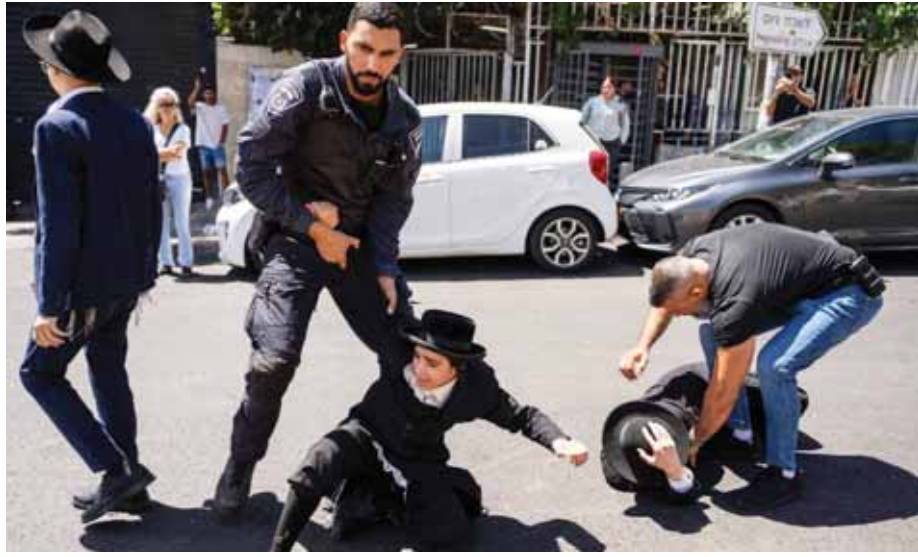
Israeli police officers scuffle with ultra-Orthodox Jewish men during a protest against a potential new draft law which could end their exemptions from military service in Jerusalem, Wednesday.