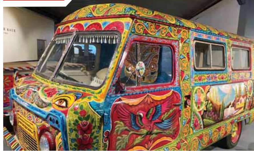
A beautifully painted bus at display in the Heritage Transport Museum, in Gurugram