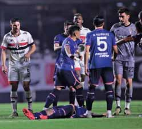
Uruguayan national team players were among those expressing their condolences. "Pain, sadness, it is hard to explain," Inter Miami striker Luis Suárez said. "May he rest