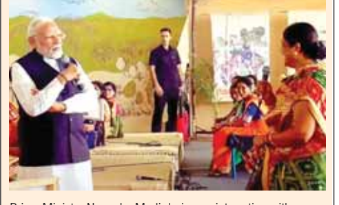
Prime Minister Narendra Modi during an interaction with Lakhpati Didis, in Jalgaon, on Sunday