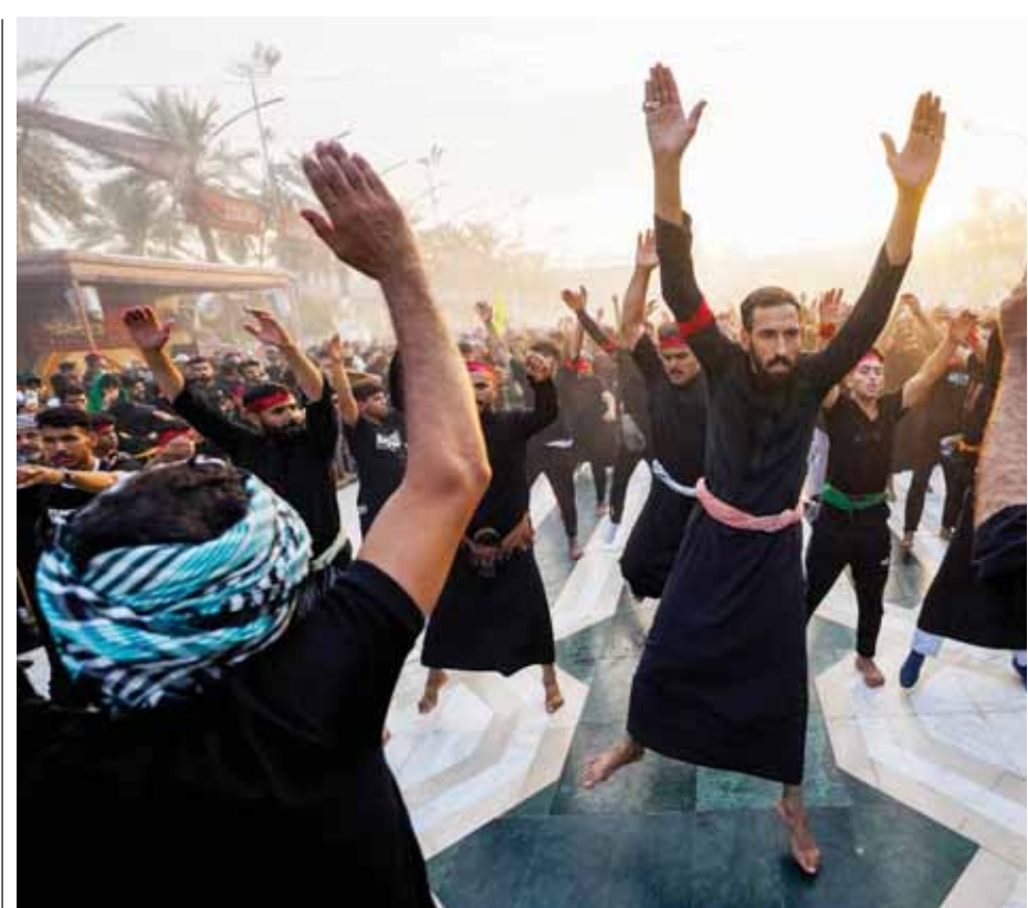
Shiite pilgrims mark Arb'een on Saturday in Karbala, Iraq. The event marks the end of the forty-day mourning period after the anniversary of the martyrdom of Imam Hussein, the Prophet Muhammad's grandson, in the 7th century

Ternate Island (AP): Torrential rains caused a flash flood on Indonesia's eastern Ternate Island, sweeping away residential areas and leaving 13 people dead on Sunday, officials said. The deluges cut off the main road and access to the village of Rua in North Maluku province, the most hard-hit area, and buried dozens of houses and buildings under the mud. Search and rescue teams worked with locals to recover the bodies and look for those still missing. The Meteorology, Climatology, and Geophysics Agency says high-intensity rain is still possible in the Ternate City area and its surroundings in the coming days. Local authorities advised residents to remain vigilant and heed instructions in case of further flooding. Heavy rains cause frequent landslides and flash floods in Indonesia where millions live in mountainous areas and near floodplains.