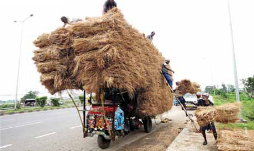
Workers load heaps of straw on an autorickshaw, in Bardhaman.