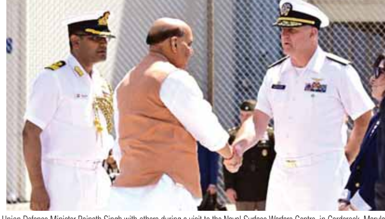
Union Defence Minister Rajnath Singh with others during a visit to the Naval Surface Warfare Centre, in Carderock, Maryland, USA