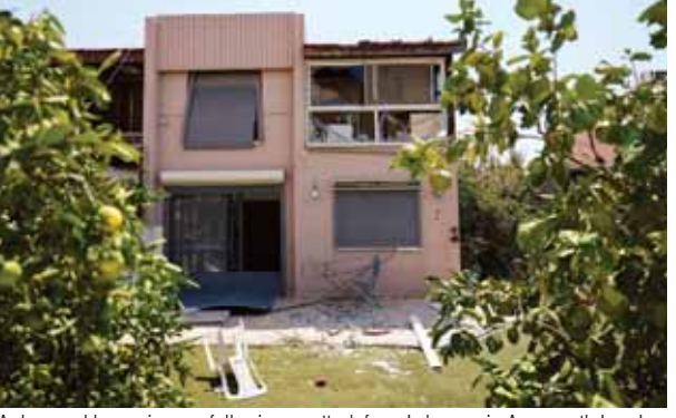
A damaged house is seen following an attack from Lebanon, in Acre, north Israel, on Sunday