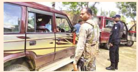
Security personnel outside the residence of a man allegedly linked to Al Qaeda, in Lohardaga, on Thursday. Seven people allegedly linked to Al Qaeda were detained by Jharkhand Anti-Terrorist Squad in raids in different parts of the State on Thursday