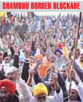
SHAMBHU BORDER BLOCKADE

The bench allowed the representatives of both Punjab and Haryana to continue engaging with the farmers and directed