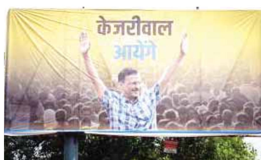
Arvind Kejriwal as the centre and under his leadership, once again the people of Delhi will form the AAP government by giving a huge majority?"

AAP on Thursday launched a campaign called 'Kejriwal Aayenge' in the run up to the assembly polls in Delhi next year and said that the party will fight the upcoming assembly elections keeping incarcerated Chief Minister Arvind Kejriwal at the centre. Delhi Chief Minister Arvind Kejriwal is lodged in Tihar jail in connection with a corruption case linked to the alleged excise policy scam being probed by the Central Bureau of Investigation (CBI). AAP's General Secretary (Organization) and Rajya Sabha MP Dr Sandeep Pathak said, "By launching the slogan 'Kejriwal Aayenge', AAP wants to give a message that the upcoming Delhi Assembly elections will be fought with