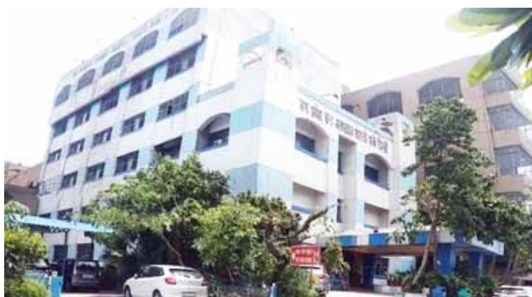
As the accused threatened the doctors and abused them, hospital staffers recorded it on their mobile phones. According to the FIR, the accused's wife was given medication by the doctor on duty based on her complaints but her husband refused those and instead suggested his own mode of treatment, a police official said. "A Person came to the casualty around 9:00 pm on Wednesday and the patient was given medication according to the