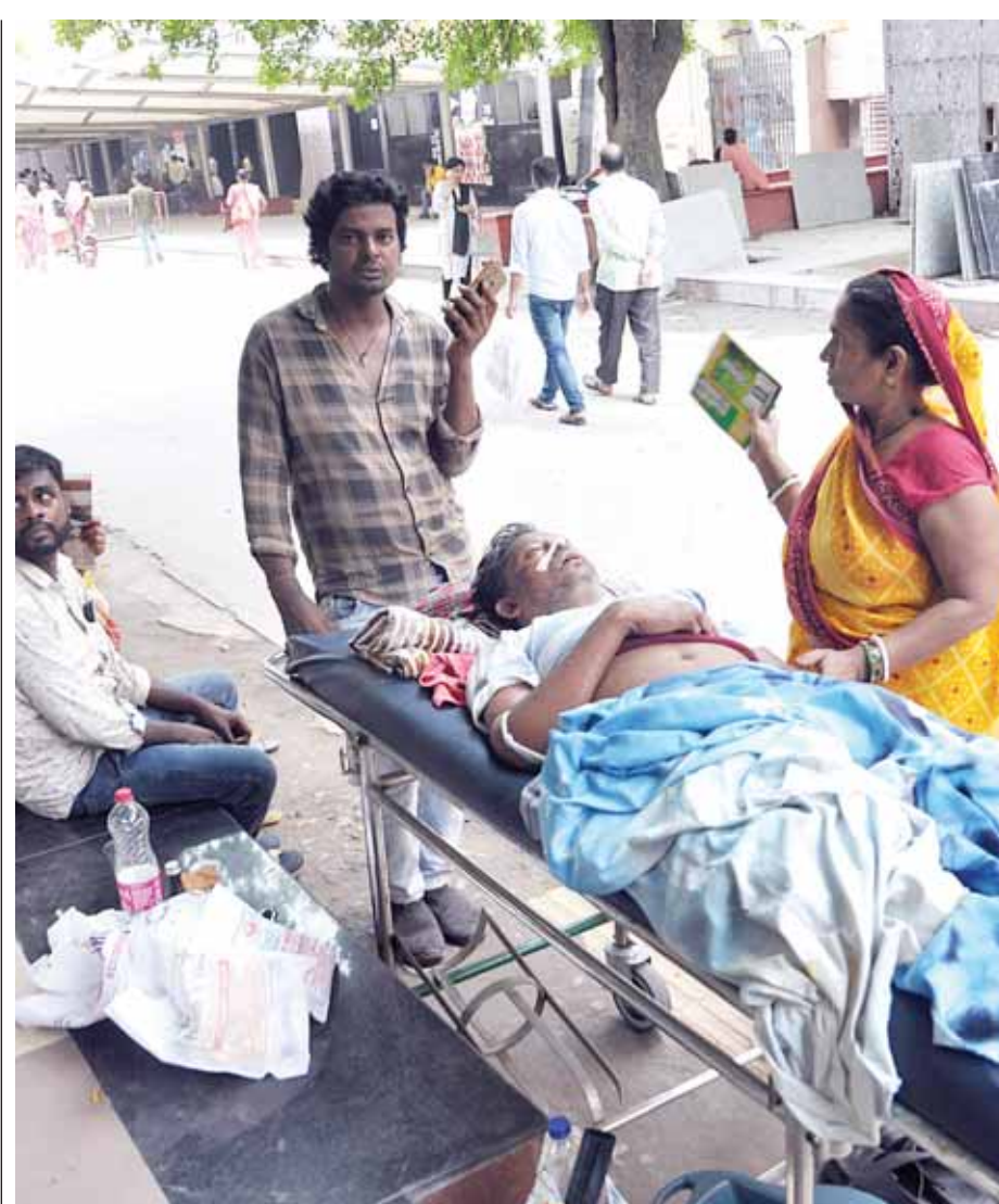
Patients arriving at the RML Hospital being denied treatment and referred to other hospitals