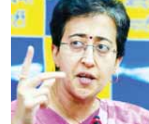
state of sewer overflow was absolutely shocking. These localities have been turned into a living hell. This kind of sewage overflow is a breeding ground for several diseases and can cause a serious public health crisis," she added. The senior AAP leader said that the residents informed them that the DJB officials, upon receiving the complaints, claimed that they do not have machines and manpower due to lack of funds. "The national capital could come to a standstill if DJB fails to do its work properly. A budget of Rs.7195.00 crore has been passed by the Delhi assembly which is 9.5 per cent of the total budget of Government of NCT of Delhi. This budget has been approved by the Council of Ministers, the LG, MHA and the Delhi Assembly.