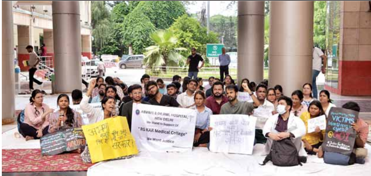
Doctor sitting on protest against the death of a doctor of RG Kar Hospital, at RML hospital on Thursday