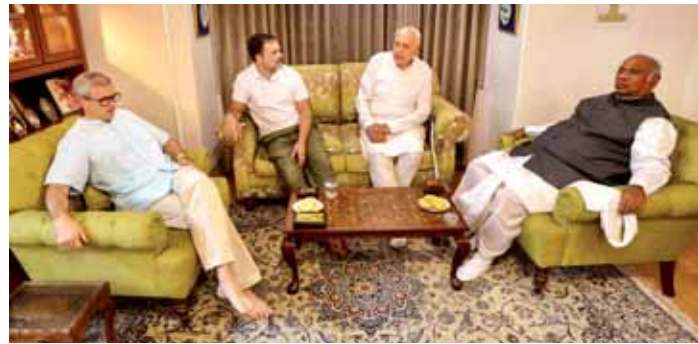
Congress president Mallikarjun Kharge with party leader Rahul Gandhi meets J&K National Conference president Farooq Abdullah and vice president Omar Abdullah, in Srinagar, on Thursday

Soon after the meeting, the National Conference president Dr Farooq formally announced that the pre-poll alliance with Congress is final, and will be approved by this evening.