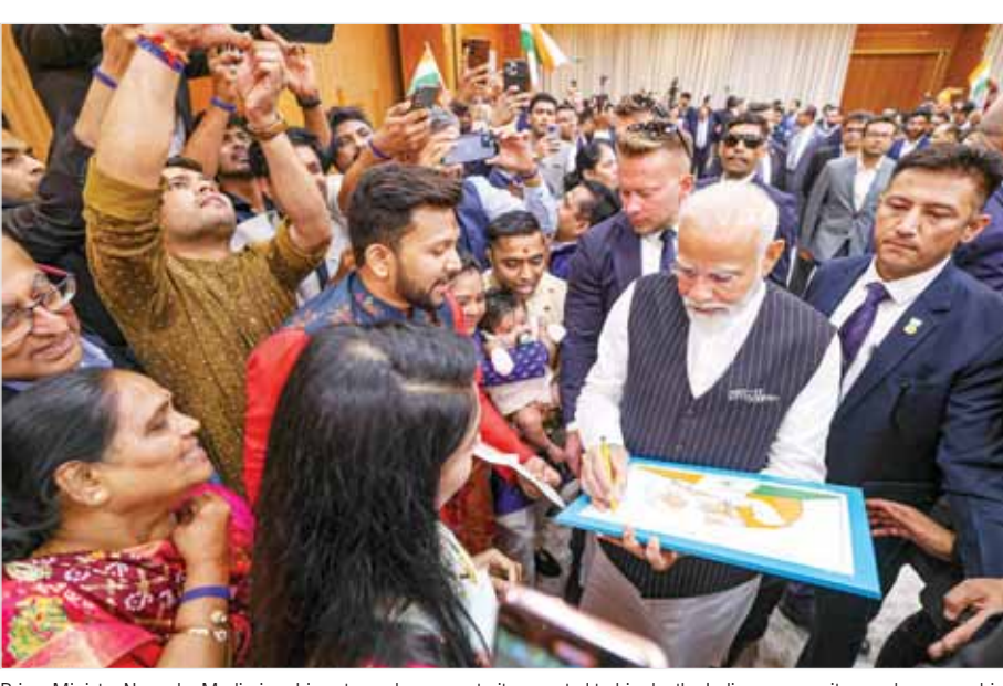
Prime Minister Narendra Modi gives his autograph on a portrait presented to him by the Indian community members upon his arrival at a hotel, in Warsaw, Poland, on Wednesday

On the first leg_of the visit, Modi is visiting Polish capital city of Warsaw on August 21