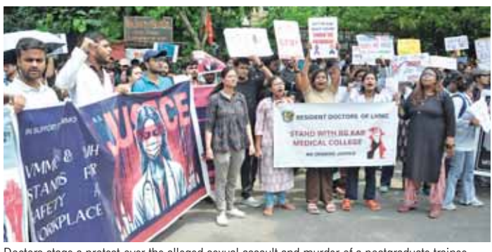
Doctors stage a protest over the alleged sexual assault and murder of a postgraduate trainee doctor, at Jantar Mantar, in New Delhi on Wednesday

"I travelled from Patna to get treatment here for my son and have been trying to show him to a doctor here. I have been coming for four