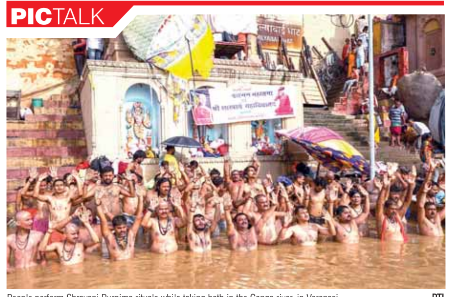
People perform Shravani Purnima rituals while taking bath in the Ganga river, in Varanasi

with the public office which has to be more sympathetic to people's aspirations even if the cost is high. Another major concern, and that is more pronounced in the Indian context, was that lateral entry could become a tool for political patronage. It was feared that the process could be manipulated to favour individuals with political connections, thus compromising the meritocratic nature of the civil services. Surely, it could lead to the politicisation of the bureaucracy, further eroding public trust in the system. Besides, bypassing the traditional recruitment process could create resentment among career bureaucrats. The decision to withdraw the lateral entry initiative reflects a pragmatic recognition of the political realities at play. While the government may have been convinced of the merits of the policy, the need to maintain a cohesive and supportive alliance outweighed the potential benefits of pushing forward with a contested reform. For now, the Government's retreat on lateral entry is a reminder of the delicate interplay between policy and politics. While the idea of bringing in fresh talent from outside the civil services is laudable, the concerns raised by political allies cannot be ignored. Moving forward, any attempt to reform the bureaucracy will need to address these concerns head-on, ensuring that innovation does not come at the cost of values.