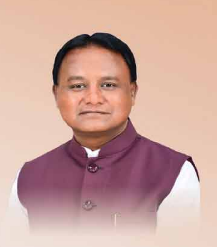
Sri. Mohan Charan Majhi Hon'ble Chief Minister, Odisha

Odisha is proud to support the Indian National Hockey Team