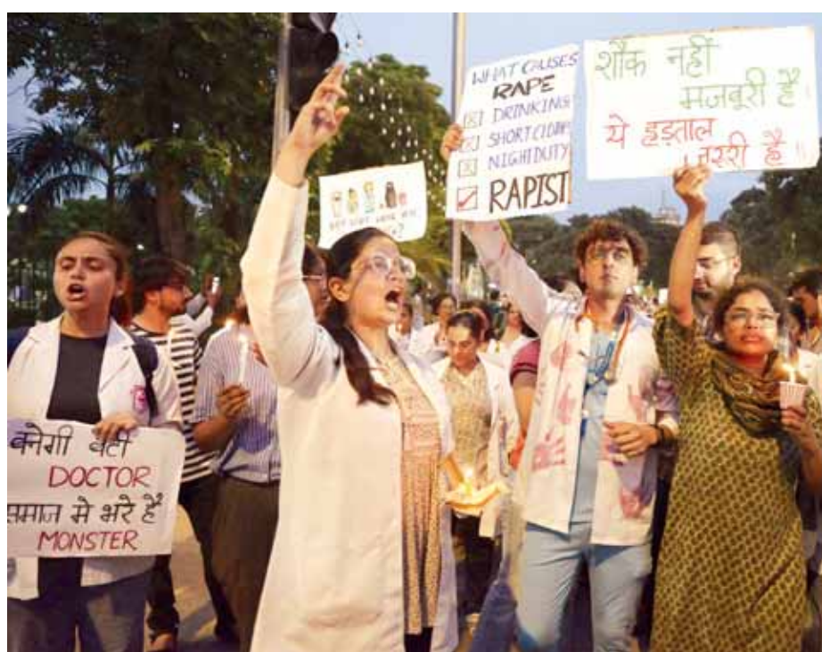
Members of various Resident Doctors' Associations protest during a candle march against the alleged rape and murder of a trainee doctor at Kolkata's RG Kar Medical College and Hospital, at Connaught Place, in New Delhi, on Sunday