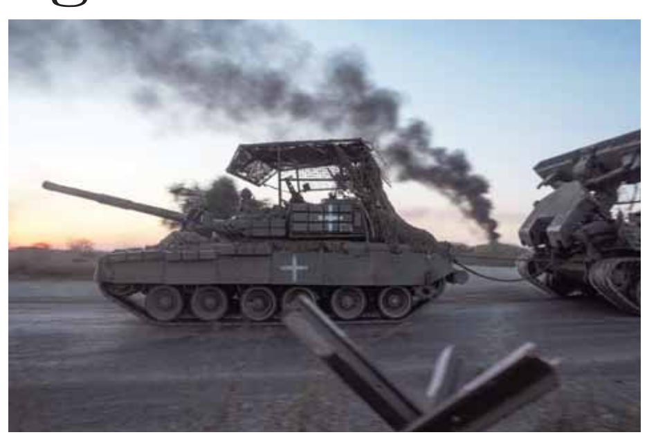
Ukrainian servicemen ride atop on a tank after returning from Russia near the Russian-Ukrainian border in Sumy region, Ukraine, on Saturday, August 17, 2024

country since World War II, sapped by a failed counteroffensive last summer and months of grinding Russian gains in the eastern Donbas region, and proven its ability to seize initiative. It has resembled Ukraine's lightning operation from September 2022, led by Syrskiy, in which its forces reclaimed control of the northeastern Kharkiv region after taking advantage of Russian manpower shortages and a lack of field fortifications. Zelenskyy seeks permission to strike deeper into Russia. Ukrainian President Volodymyr Zelenskyy late on Saturday urged Kyiv's allies to lift the remaining restrictions on using Western weapons to strike targets deeper in Russia, including in Kursk, saying that his troops could deprive Moscow "of any ability to advance and cause destruction" if granted sufficient long-range capabilities. "It is crucial that our partners remove barriers that hinder us from weakening Russian positions in the way this war demands. ... The bravery of our soldiers and the resilience of our