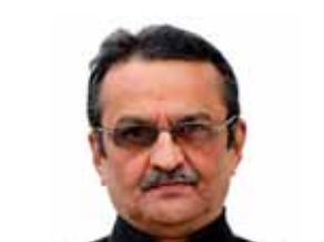
B K JHA

The recent barbaric act of violence, rape, and murder against a resident lady doctor in Kolkata has sent shockwaves across the nation. This incident, coupled with the growing number of attacks on medical professionals, calls for an urgent need for a safe operating environment for those who dedicate their lives to saving others.