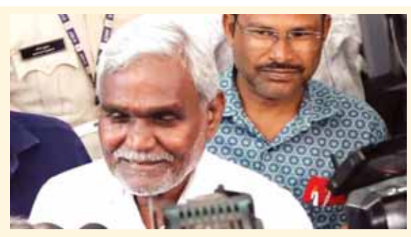
Former Jharkhand Chief Minister Champai Soren speaks with the media upon his arrival at Delhi airport on Sunday

reluctance to perform night shifts at the hospital. "Clearly, she was under pressure for some reason or was privy to something she should not have known," one family member speculated, questioning why the victim would tear out 4-5 pages from her personal diary. On Sunday, the CBI summoned several security staff members and a subaltern police officer for questioning. However, investigators have yet to determine why hospital authorities delayed informing the police by two hours after discovering the body or why students and staff were instructed not to go to the third floor, where the seminar room — and the victim's body — was found early on the morning of August 9. The officials also have asked the former principal of the college as to why the common wall between the bathroom and the seminar hall was pulled down after the incident and why the washbasins and such other things were replaced in a hurry. Continued on Page 2