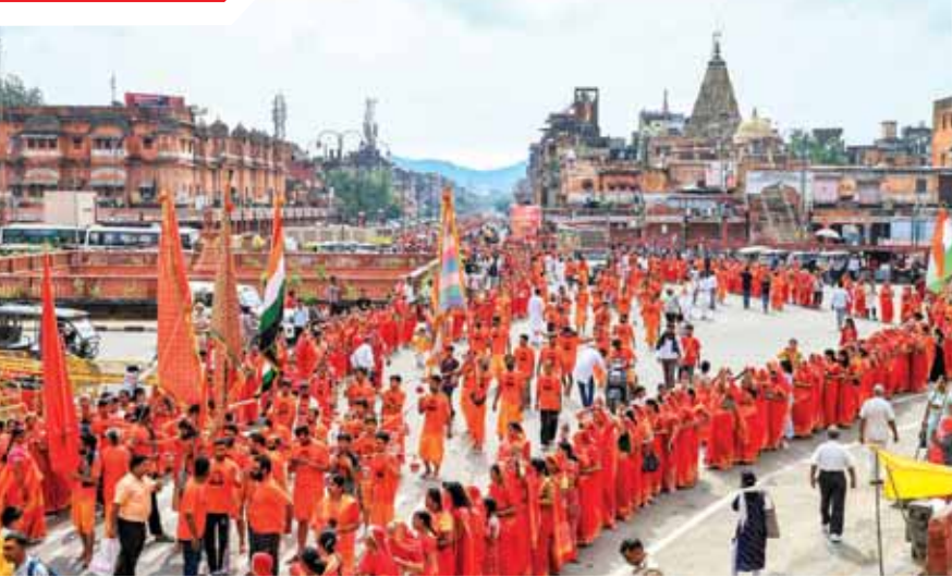
Women devotees carry holy water in the 'Kalash Yatra' in Jaipur