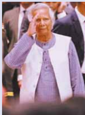
Majumdar was appointed as special assistant to this interim government's chief adviser on August 12; while Chowdhury is former director general of Border Guard,

Dhaka (PTI): The interim government in Bangladesh led by Chief Adviser Prof Muhammad Yunus was expanded on Friday with four more advisers joining his team of civil society figures, academics, NGOs and rights group leaders. The new advisers are Wahiduddin Mahmud, an economist, Ali Imam Majumdar, former cabinet secretary, Muhammad Fouzul Kabir Khan, former power secretary, and Lt Gen Jahangir Alam Chowdhury. With these four, the strength of the members — all equivalent to ministers — in the interim government's advisory council rose to 21. Nobel Laureate Yunus and 13 other advisers were sworn in