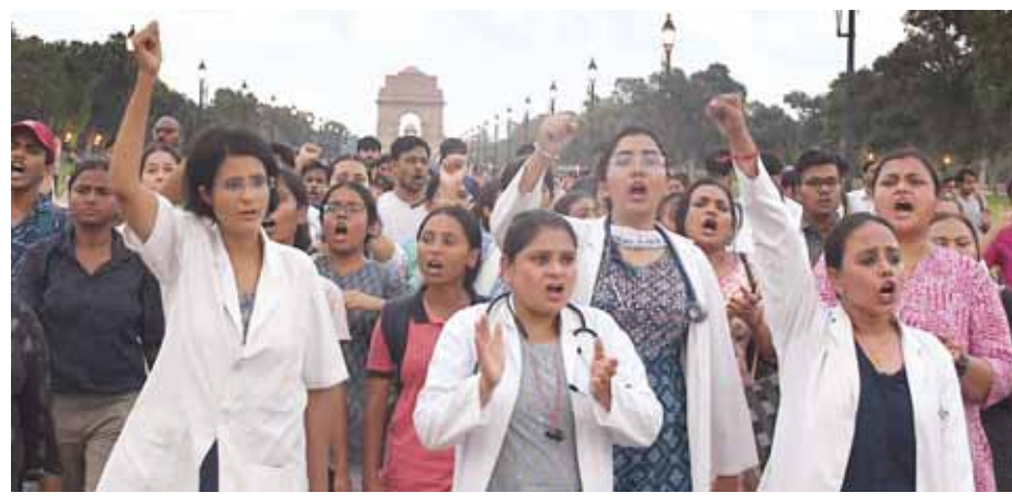
Doctors medical professionals and students stage a protest march demanding justice for a woman doctor who was allegedly raped and murdered at Kolkata's R G Kar Medical College and Hospital at Kartavya Path, New Delhi, on Friday.