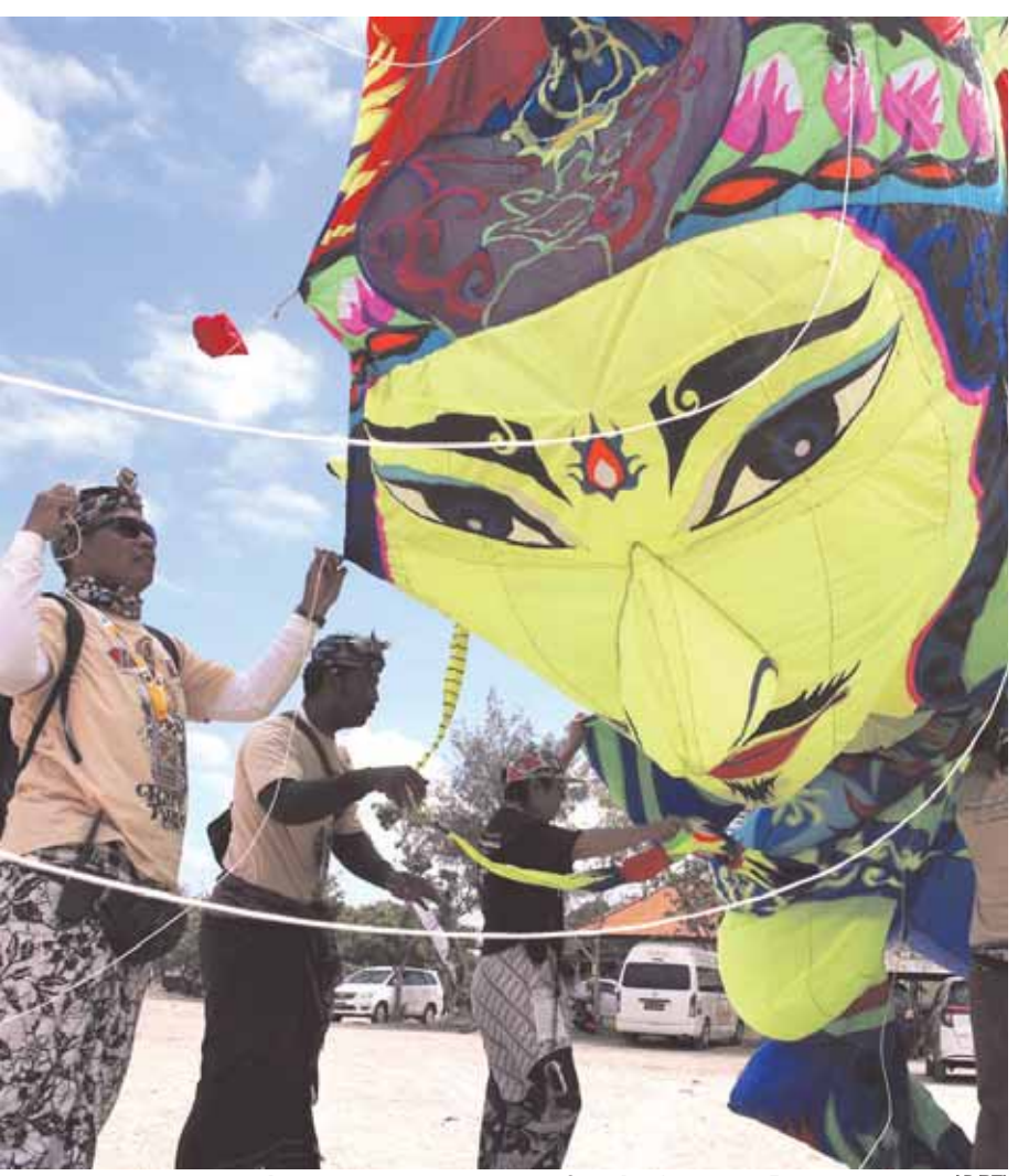
Participants prepare a kite during Denpasar international kite festival in Sanur, Bali, Indonesia on Friday.

proposals for ensuring their safety, including enacting laws, establishing monitoring cells, forming a Minority Commission and providing continuous state security for temples. The adviser assured his full support for these matters. The Bangladesh National Hindu Grand Alliance said that the minority community faced attacks and threats in 278 locations across 48 districts since the fall of the Sheikh Hasina-led government on August 5 and termed it as an "assault on the Hindu religion." Bangladesh's Chief Adviser Muhammad Yunus who is heading the interim government on Tuesday reached out to the distressed Hindu commu-