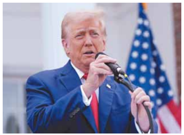
Republican presidential nominee former President Donald Trump speaks at a news conference at Trump National Golf Club, Thursday in Bedminster, N.J.

PTI ■ WASHINGTON Republican presidential candidate Donald Trump has said he is "entitled" to personally attack his Democratic rival Kamala Harris because he doesn't "have a lot of respect for her", as he dismissed calls from allies to refocus his campaign on policy issues in his bid to reclaim the White House. Trump, 78, said he is "angry" at Vice President Harris, 59, over the Biden administration's handling of issues ranging from inflation to immigration. "I don't have a lot of respect for her. I don't have a lot of respect for her intelligence. I think she'll be a terrible president. I think it's very important that we win. And whether the personal attacks are good or bad she certainly attacks me personally," the former president told reporters at his golf club in Bedminster, New Jersey on Thursday. Trump was responding to questions from his party members urging him not to