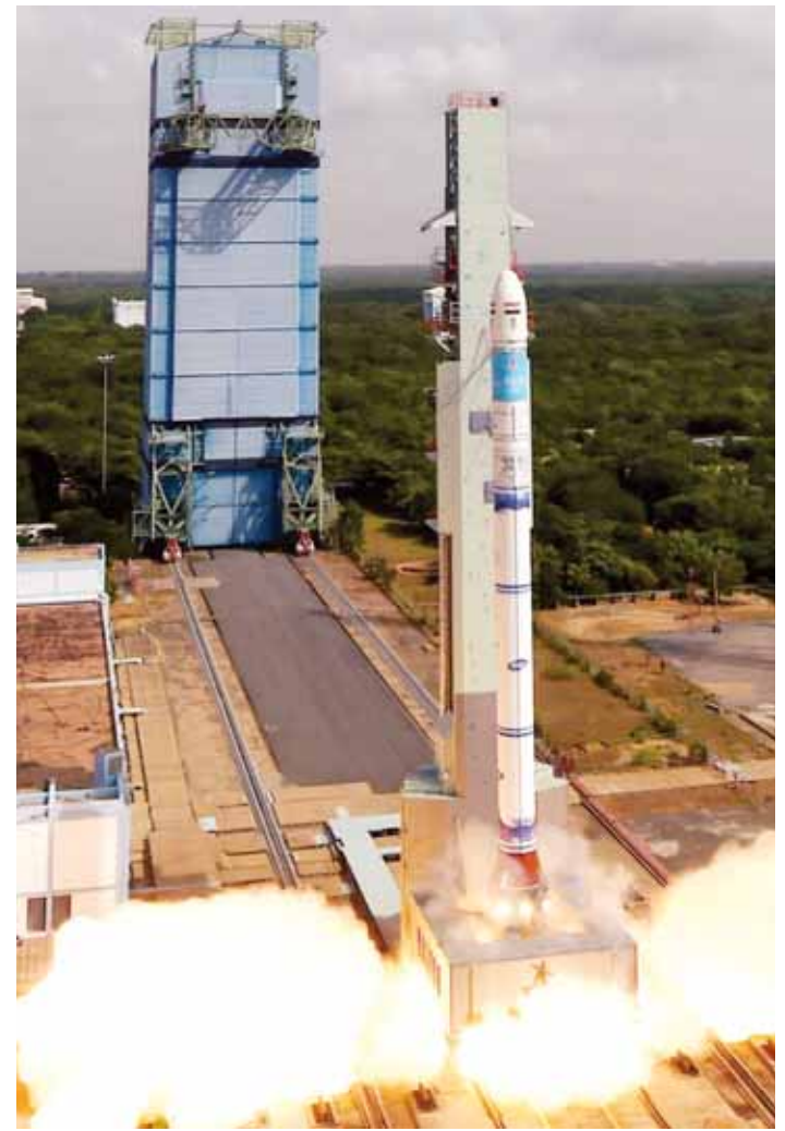
ISRO's Small Satellite Launch Vehicle-03 (SSLV-D3) carrying Earth Observation Satellite (EOS-08) leaves a trail of smoke after it lifted off from the Satish Dhawan Space Centre, in Sriharikota, Andhra Pradesh, on Friday.