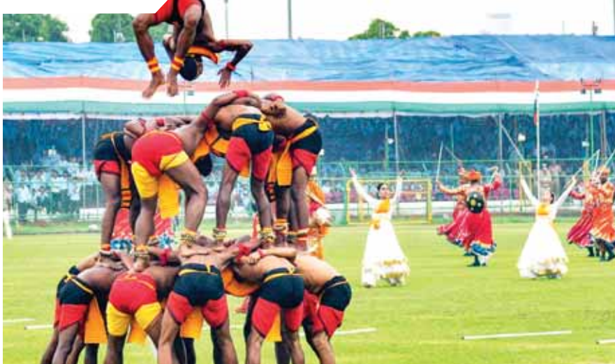
Artists perform at Sawai Mansingh Stadium on Independence Day in Jaipur