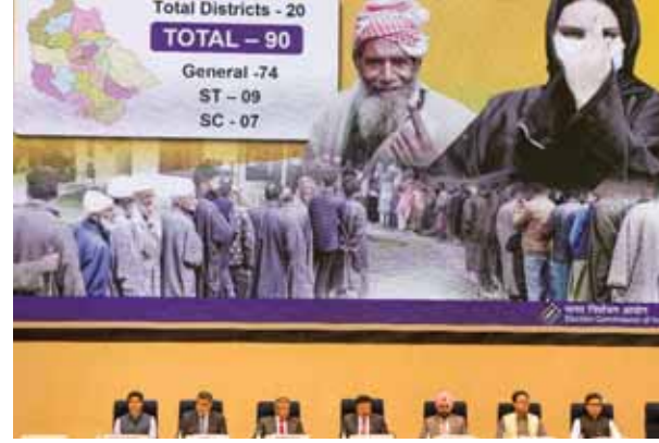
Chief Election Commissioner Rajiv Kumar with election commissioners Gyanesh Kumar and Sukhbir Singh Sandhu during a press conference to announce the schedule for "General Election to Legislative Assemblies 2024", in New Delhi, on Friday.

For the first time since the scrapping of Article 370 in 2019, the Election Commission (EC) on Friday announced Assembly elections to Jammu and Kashmir in three phases with the first phase to be held on September 18, second on September 25 and third phase on October 1. Results will be announced on October 4. This will be the shortest elections in at least the last two decades in the region. The phase of the J&K election is significant, given that over the last two decades, due to the region's security concerns, polls have consistently been held in at least four phases or more. J&K has been without an elected House for five years now. The last election was held in undivided J&K in 2014. This marks a big step forward in efforts to meet a Supreme Court order — that democracy return to Jammu and the Kashmir Valley by September 30. Union Home Minister Amit Shah welcomed the announcement of Assembly elections there and said the polls will further strengthen the roots of democracy and open the doors to a new period of development for the region. Shah also appealed to the people of J&K to actively