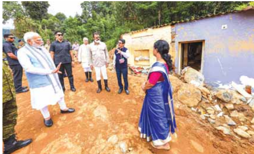
Prime Minister Narendra Modi interacts with officials during inspection of the landslide-affected areas, in Wayanad, on Saturday. MoS Suresh Gopi is also seen; the PM (R) interacts with a child survivor at AWS Hospital in Wayanad