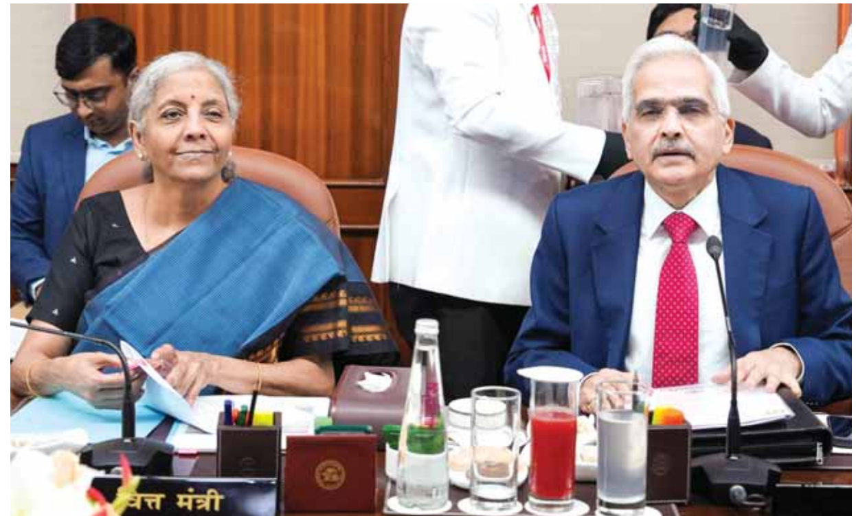
Union Finance Minister Nirmala Sitharaman with RBI Governor Shaktikanta Das during the Central Board of Directors of the Reserve Bank of India in the customary post-Budget meeting, at Reserve Bank of India in New Delhi, on Saturday

PTI ■ CHENNAI Water treatment player VA Tech WABAG Ltd has secured a repeat order of Rs 415 crore from the Chennai Metropolitan Water Supply and Sewerage Board, the company said on Saturday. The order is towards the Operation and Maintenance of 110 million litres per day Sea Water Reverse Osmosis (SWRO) Desalination Plant at Nemmeli in Chennai for a period of 7 years, city-based VA Tech WABAG Ltd said. VA Tech WABAG had bagged an Operation and Maintenance contract from the Chennai Metropolitan Water Supply and Sewerage Board (CMWSSB) and it was completed in 2021. In a BSE filing today, the company said, "CMWSSB floated a public tender for the Operation and Maintenance of the plant and WABAG secured this repeat order for Operating and Maintaining the plant for another 7 years."