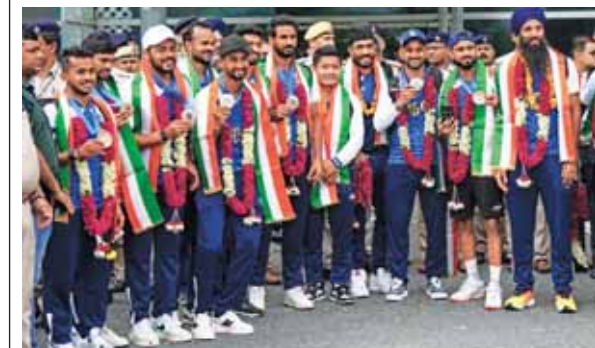
Paris Olympic Bronze medallist Indian Hockey players pose for photos on their arrival at the Indra Gandhi International Airport, in New Delhi, on Saturday