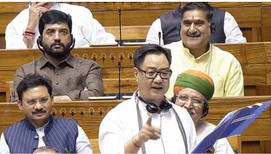
Union Minister Kiren Rijiju speaks in the Lok Sabha during the Monsoon Session of Parliament, in New Delhi, on Thursday