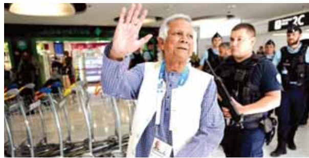
Nobel laureate Muhammad Yunus returns to Bangladesh from Paris to take charge of interim Government

Suchetan. He was the State's Chief Minister from 2000 to 2011. Bhattacharjee had been in poor health for several years, and was confined to his small two-room apartment on Palm Avenue for the past 8 years mostly reading and writing books. Continued on Page 2