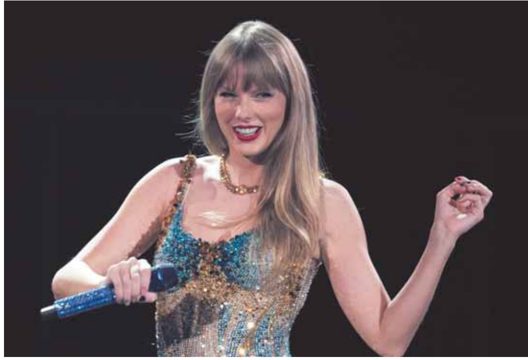
Thursday, Friday and Saturday at the Ernst Happel Stadium, which sat empty Thursday morning aside from media filming outside.