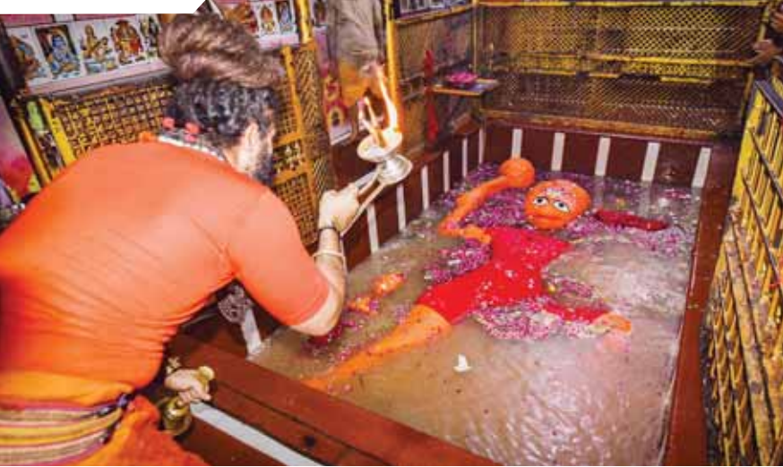
A priest performs 'aarti' at Bade Hanumanji temple which was flooded after heavy rains in Prayagraj