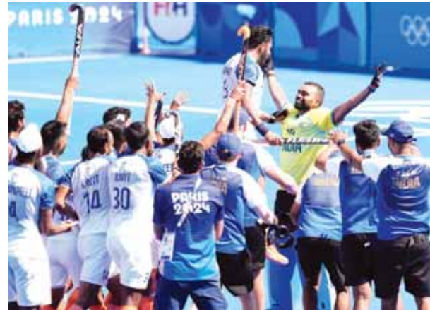
India's goalkeeper Parattu Reveendran Sreejesh, in yellow jersey, reacts as India's players celebrate after winning the men's bronze medal field hockey match against Spain at the Yves-du-Manoir Stadium during the 2024 Olympics, on Thursday

The Indian men's hockey team clinched a second successive bronze medal at the Olympic Games for the first time in 52 years with a come-from-behind 2-1 win over Spain, giving veteran goalkeeper PR Sreejesh a fitting farewell here on Thursday. It was tense last few minutes for the Indians as they faced two short corners within the last minute but the defence stood tall and soaked in the pressure. India, who claimed the bronze in Tokyo Games after a hiatus of 41 years, lived up to the expectations despite not having a perfect build-up to the Games. The last time India won back-to-back Olympic medals was in 1968 (bronze) and 1972 editions (bronze). The bronze medal was also a desperate wait for the Indian