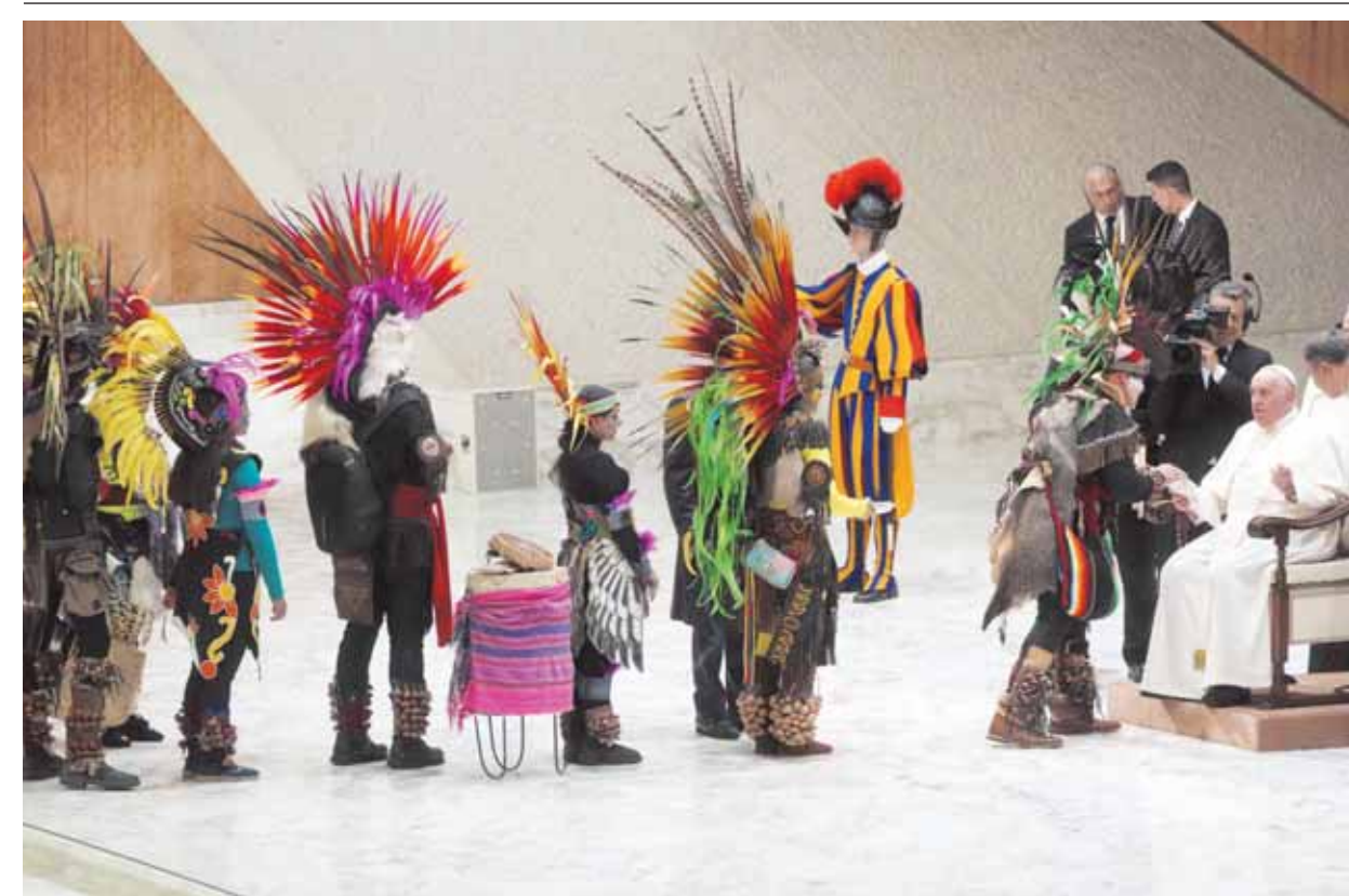
A group of Mexican faithful wearing traditional costumes meet with Pope Francis attends the weekly general audience in the Paul VI hall at the Vatican on Wednesday.

been back by mid-June. NASA is weighing all its options for returning the two veteran astronauts, including a ride home in a SpaceX capsule. "NASA and Boeing continue to evaluate the spacecraft's readiness, and no decisions have been made regarding Starliner's return," NASA said in a statement. Further details were expected at a news conference set for Wednesday. Only two docking ports at the space station can accommodate U.S. astronaut capsules and, right now, both are occupied. So one will need to be vacated before the next SpaceX crew can arrive. Russia has its own parking places for its Soyuz capsules. The latest setback means the four astronauts who flew up with SpaceX in March now also face a longer mission than planned. Over the past several weeks, Boeing has conducted thruster test firings on the ground as well as in space to better understand why five thrusters failed ahead of Starliner's June 6 arrival at the space station. All but one came back online. Helium leaks in the capsule's propulsion system also cropped up. Citing the testing, the company late last week said: "Boeing remains confident in the Starliner spacecraft and its ability to return safely with crew." Boeing and SpaceX topped NASA's list for astronaut taxi