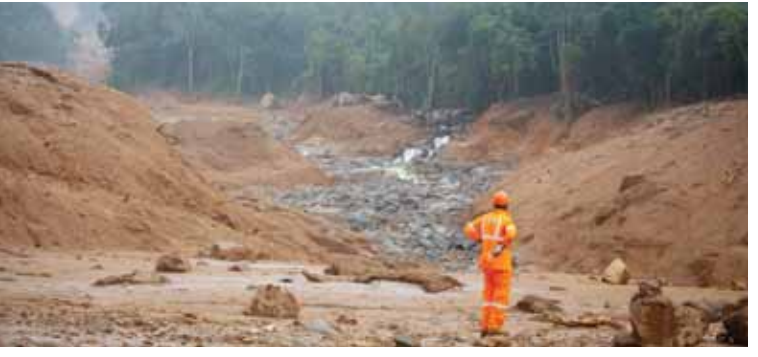
KUMAR CHELLAPPAN ■ KOCHI

Chief Minister Pinarayi Vijayan-led CPM in Kerala suffered a major setback on Wednesday as a widely respected party ideologue came out in the open lambasting the State Government for covering up its failures and blaming the Centre for last Tuesday's landslides and floods in Wayanad district.