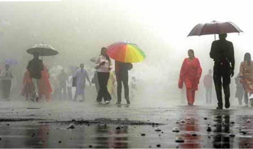
People walk to their work as torrential rains lash Shimla