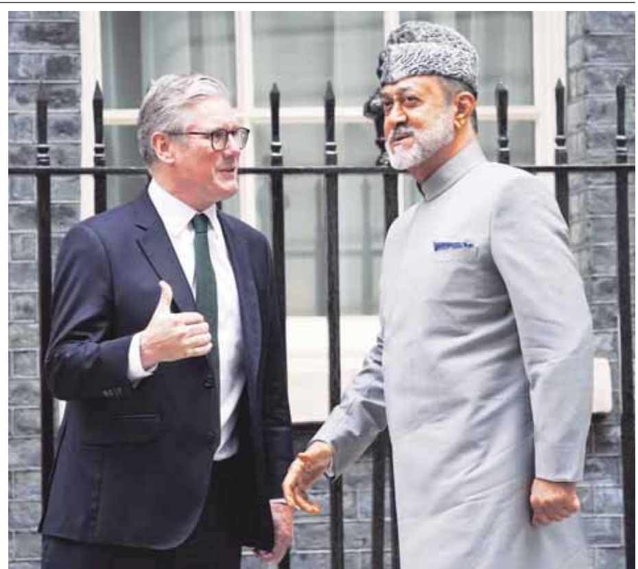
Britain's Prime Minister Keir Starmer welcomes Sultan Haitham bin Tariq Al Said, the Sultan of Oman to 10 Downing Street in London on Tuesday.

"Because of security concerns, US Embassy personnel in Bangladesh are subject to some movement and travel restrictions. The US government may have limited ability to provide emergency services to US citizens in Bangladesh due to these travel restrictions, a lack of infrastructure, and limited host government emergency response resources," it added.