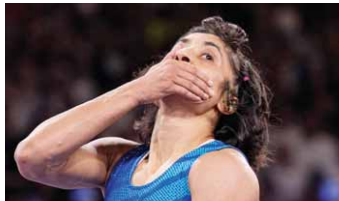
Vinesh Phogat reacts after the round of 16 of the women's freestyle 50kg wrestling match against Japan's Yui Susaki, at Champ-de-Mars Arena, during the 2024 Summer Olympics, on Tuesday