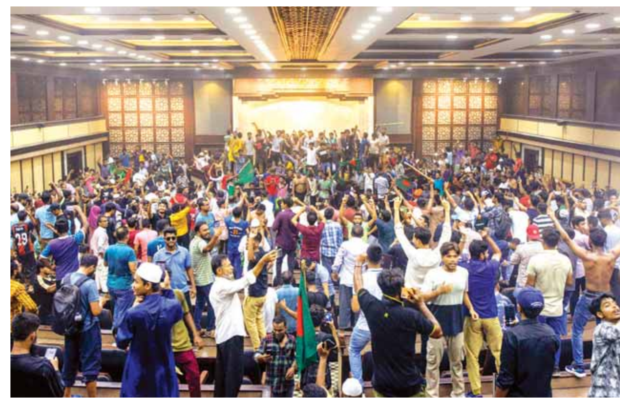
People in Dhaka celebrate the downfall of the Sheikh Hasina-led Bangladesh Government