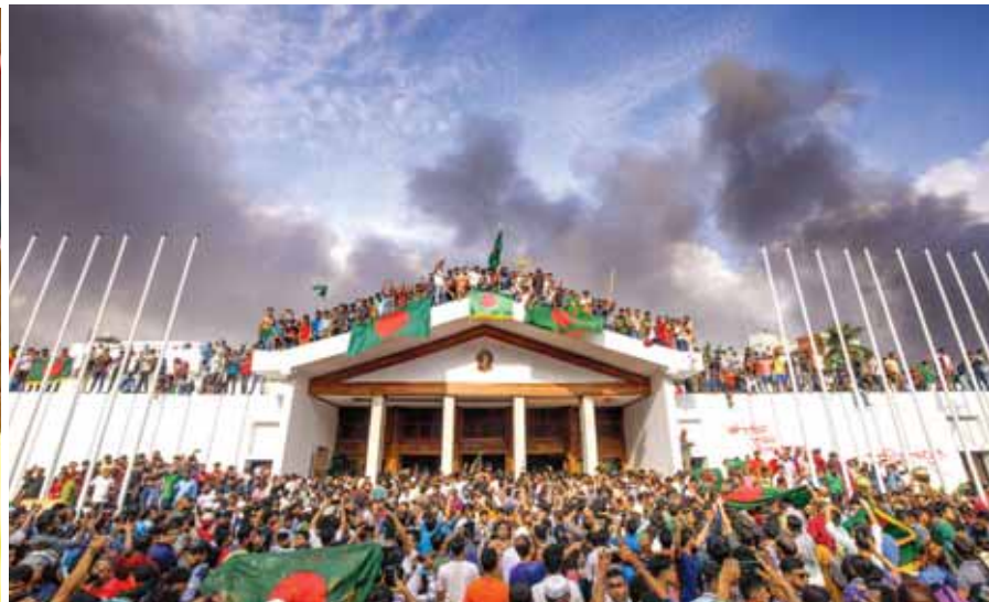
External Affairs Minister S Jaishankar speaks in the Lok Sabha on Tuesday (l); people gather around the residence of Bangladeshi Prime Minister in Dhaka, Bangladesh

request to come to India "for the moment".