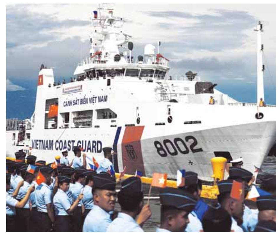
Manila : Philippine Coast Guard personnel wave flags as the Vietnam Coast Guard CSB-8002 patrol ship makes a port call at the Port of Manila, Philippines, 05 August 2024. Philippine and Vietnam coastguards will conduct joint maritime exercises in the disputed South China sea to foster mutual understanding and enhanced cooperation between the two nations