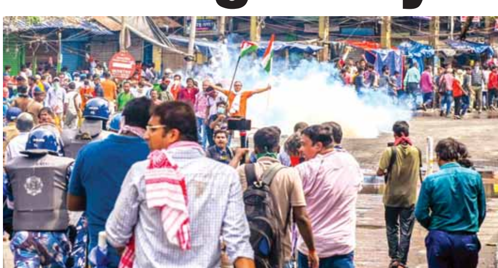
Tear gas shells being used by security personnel to disperse students during their protest march towards West Bengal Secretariat over the alleged sexual assault and murder of a trainee doctor, in Kolkata, on Tuesday

At various places people profusely bleeding from head were seen being carried away by their coagitators to the hospitals. Similarly the policemen who often got isolated were also attacked. At Babu Ghat a crowd of agitators badly beat up two policemen with lathis, rods, bricks and even shoes. Some even spit on them while