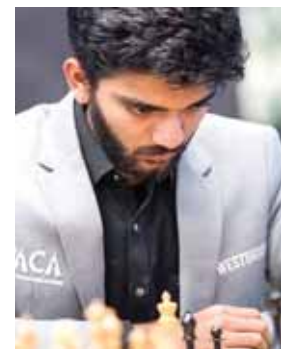
■ SAINT LOUIS (USA)

randmaster D Gukesh fought draw yet again, Exchanges signing peace with top seed and local favourite Fabiano Caruana, while Frenchman Alireza Firouzja stretched his lead by a full point after the round of Sinquefield Cup, which is a based player had to be part of the Grand Chess