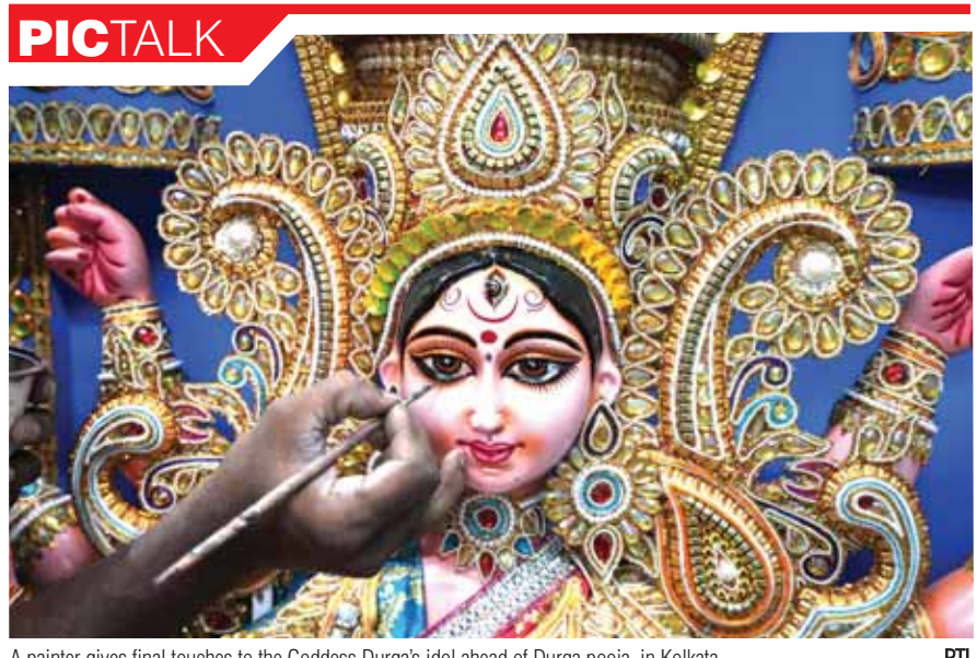
A painter gives final touches to the Goddess Durga's idol ahead of Durga pooja, in Kolkata

calculated over the last 12 months before retirement, as a pension. This assured payout provides a safety for retirees, addressing concerns about the volatility of marketlinked pensions. While the UPS offers greater security for employees, it also imposes a significant financial burden on the government. The expected cost to the exchequer for the fiscal year 2024-25 is approximately Rs 62.5 billion. This annual expenditure is likely to fluctuate based on the number of employees retiring each year. However, the shift to the UPS raises several concerns. First, the financial sustainability of the scheme is a critical issue. The guaranteed nature of the pension could strain government finances, especially if economic growth slows or tax revenues decline. Additionally, the UPS may lead to disparities between central and state government employees. Moreover, there is a risk that the shift back to a defined benefit pension system could set a precedent for other sectors, potentially leading to broader demands for similar guarantees. This could exacerbate fiscal challenges, particularly in a country where social welfare spending is already under pressure. As India prepares to implement the UPS in 2025, careful management and ongoing evaluation will be essential to ensure that the benefits of the scheme are balanced against its fiscal impact.