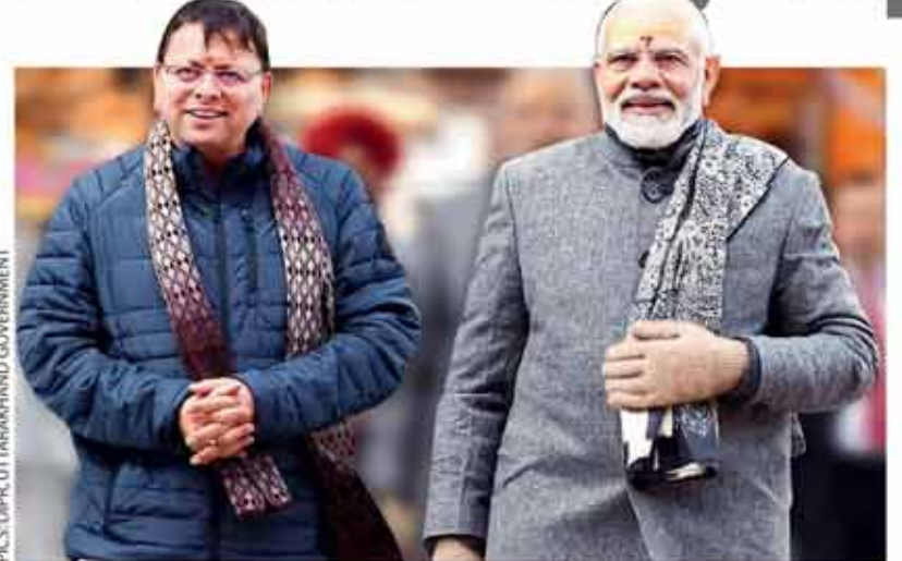
>> Narendra Modi, Prime Minister of India and Pushkar Singh Dhami, CM Uttarakhand

The proposed law has 392 sections divided into four parts and seven chapters providing equal rights to women in marriage. divorce, alimony, and inheritance of property, proscribes certain kinds of relationships, bans polygamy, sets the marriageable age for men and women (21 years and 18 years respectively), and makes registration of marriages mandatory